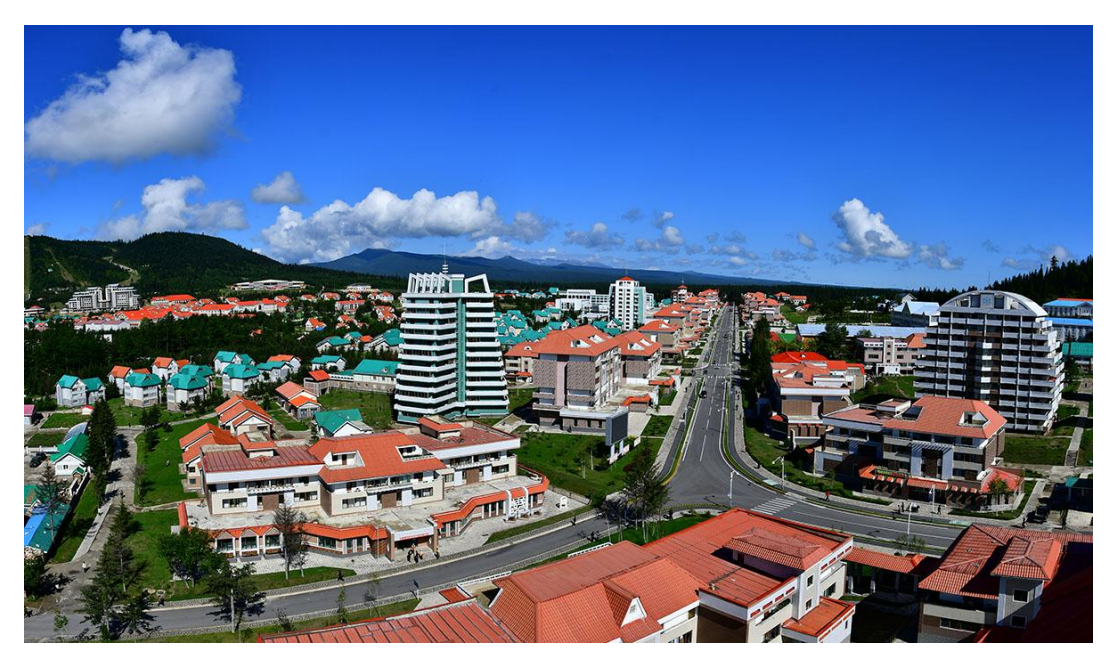
Part of Samjiyon, a cultured mountain city