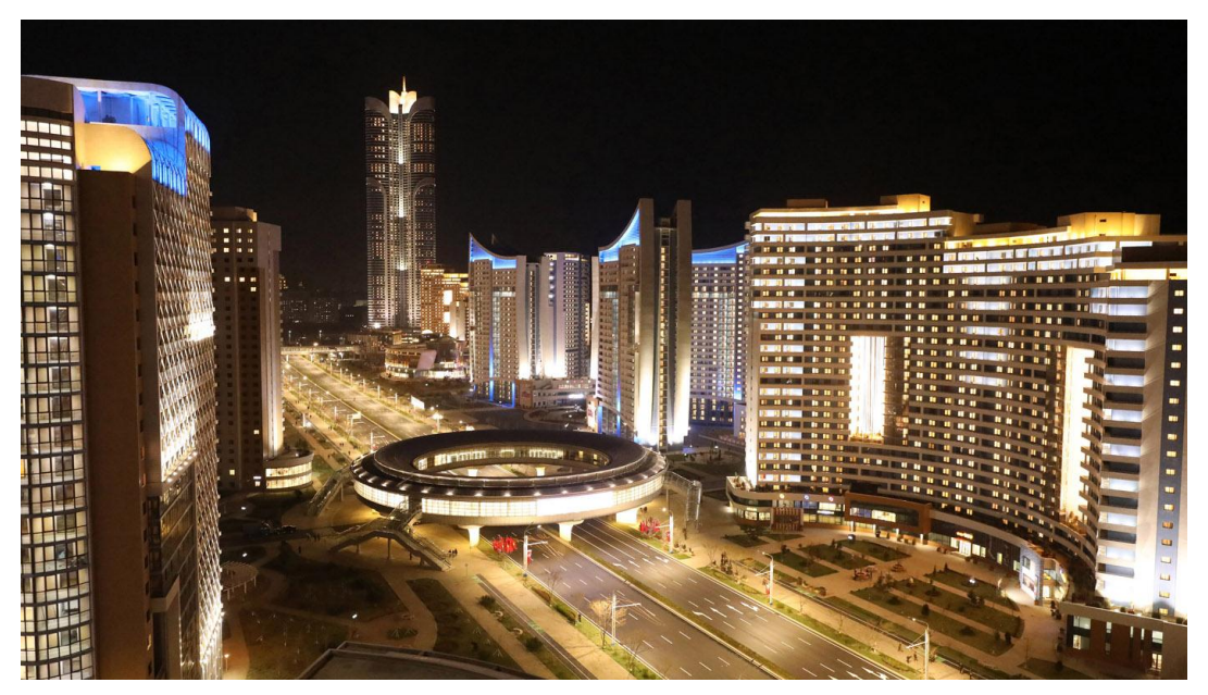
Night view of Songhwa Street