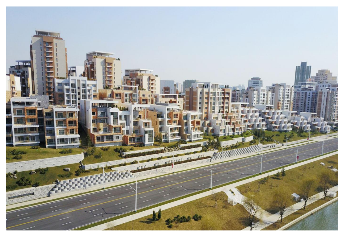
Part of the Pothong Riverside Terraced Houses District