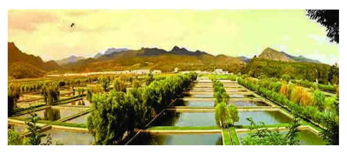
This is Poman-ri, Sohung County, North Hwanghae Province in the central part of the Democratic People's Republic of Korea.