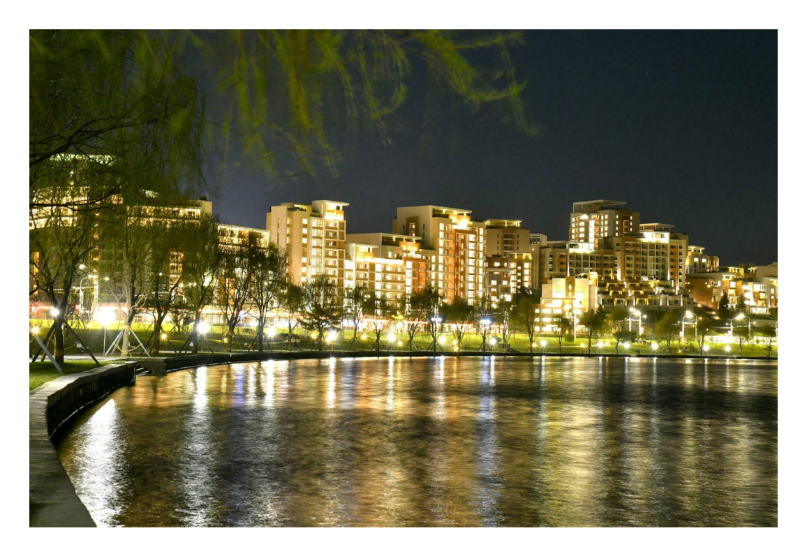
The Pothong riverside terraced houses district built in Kyongru-dong in the capital city of Pyongyang unfolded another peculiar scene on the Pothong River.