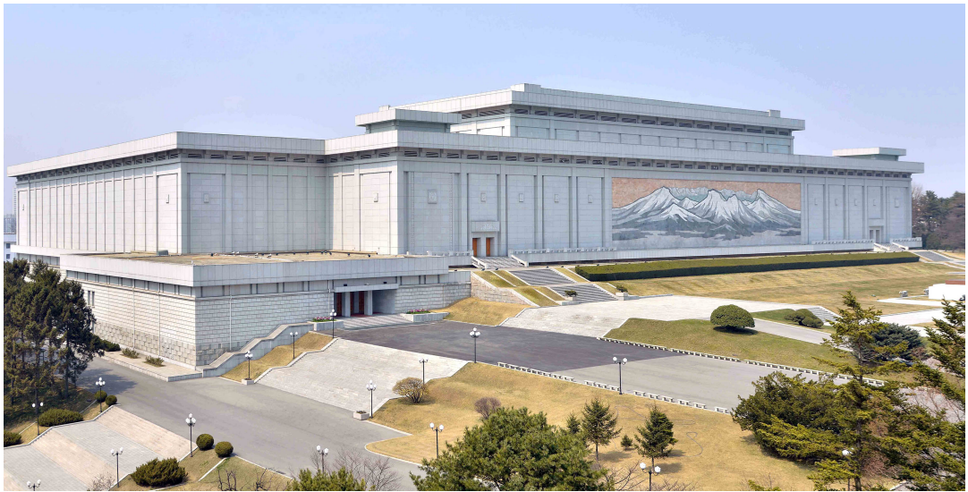
The Korean Revolution Museum

At the Victorious Fatherland Liberation War Museum, you will find out the truth about the Korean war (1950-1953) started by the US, the heroic struggle of the Korean people and the root cause of their deep-seated anti-Americanism.