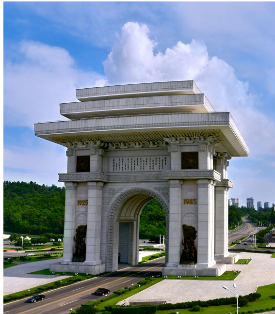
The Tower of the Juche Idea and the Arch of Triumph