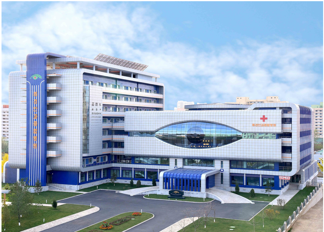
Ryugyong General Ophthalmic Hospital in the Munsu area