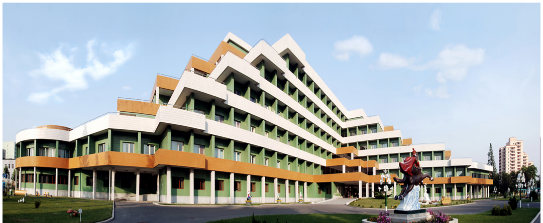
Okryu Children's Hospital in the Munsu area