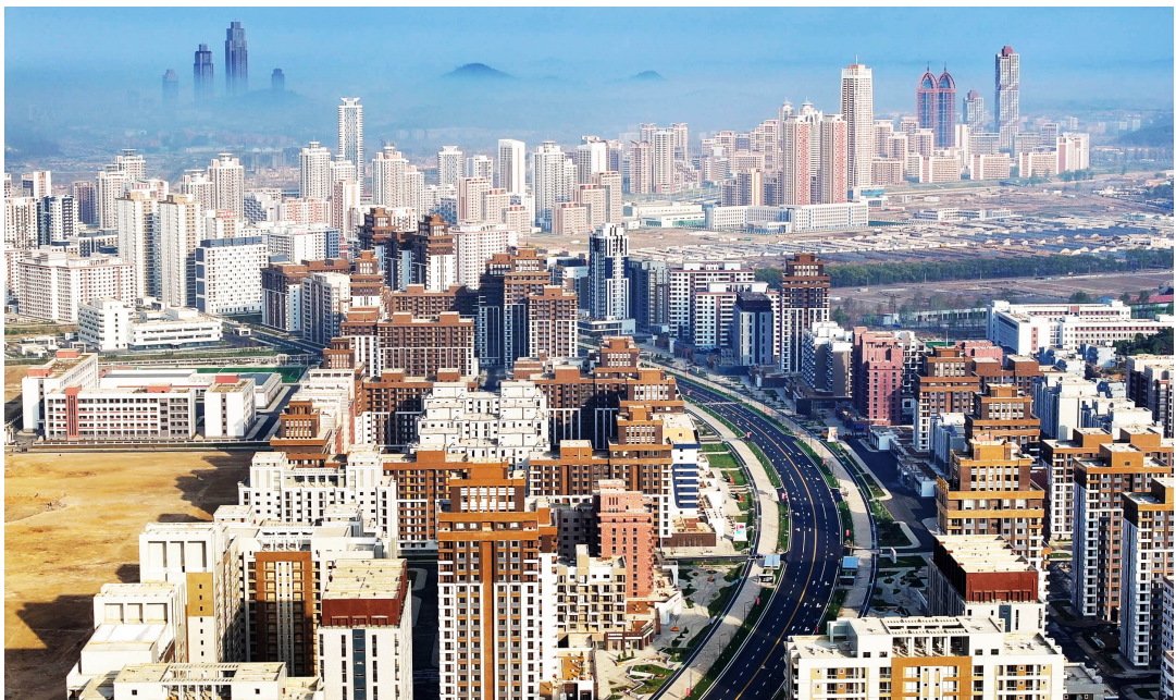
Modern streets newly built in the Hwasong area

The Mangyongdae Schoolchildren's Palace is children's heaven. This is one of the typical places in which you can grasp the educational development of the country.