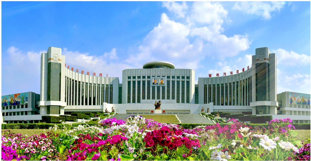
The Mangyongdae Schoolchildren's Palace