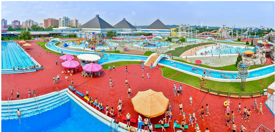
The Munsu Water Park