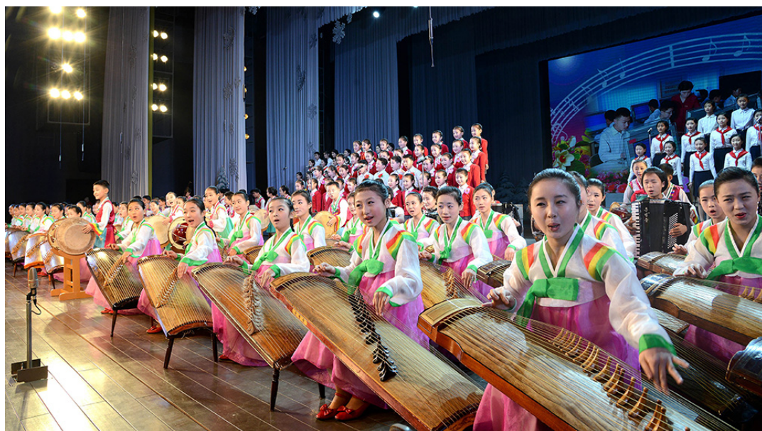
Students perform as part of their extracurricular activities at the palace.