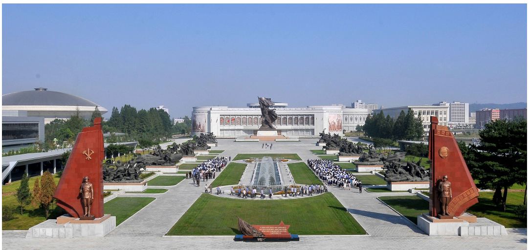
The Victorious Fatherland Liberation War Museum