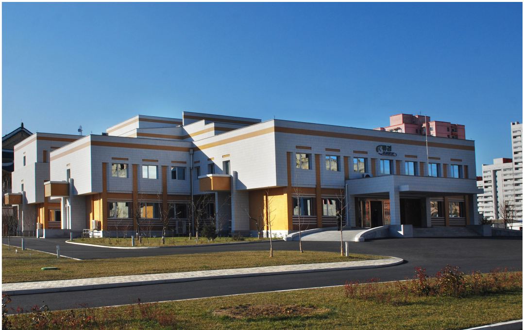
Ryugyong Dental Hospital in the Munsu area