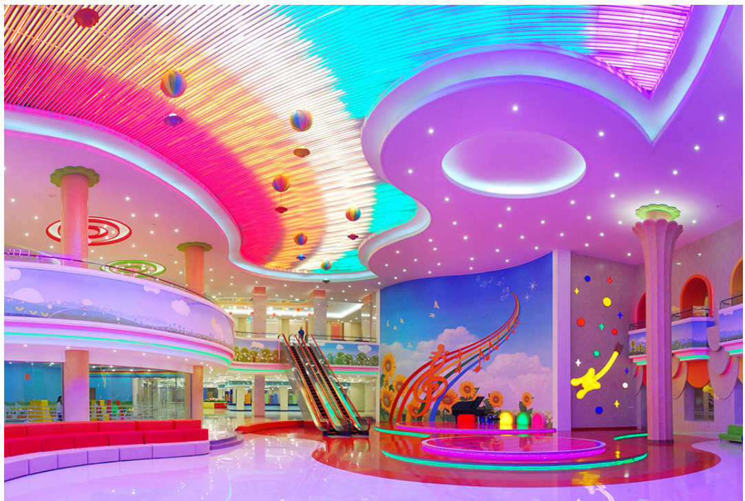
Hall of performing arts