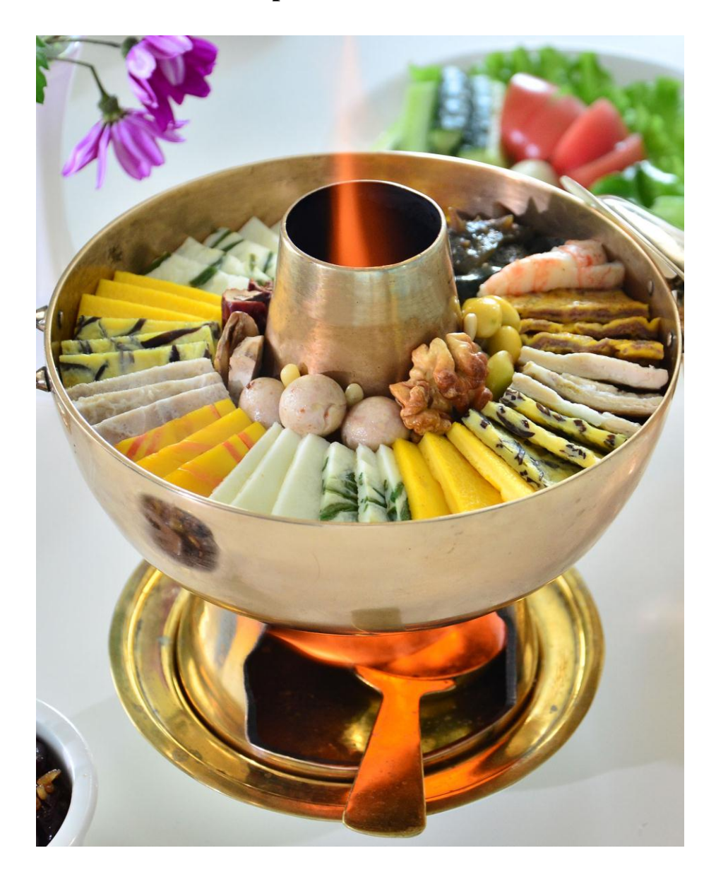
Sinsollo: A Masterpiece of Korean Traditional Dishes

As it is prepared by boiling the rare materials in the mountains, fields and seas, this dish makes it possible to taste every touch of delicacies. Sinsollo was originally the name of a cooking brazier, but with the passage of time it has turned into the name of a dish.