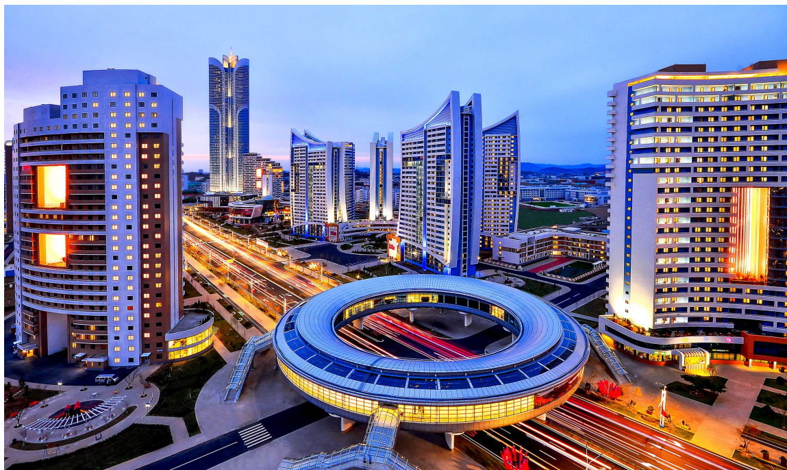
Iconic structures in Songhwa Street

be an inevitable outcome of the WPK's people-first politics over 80 years and the people's sincere support for it.