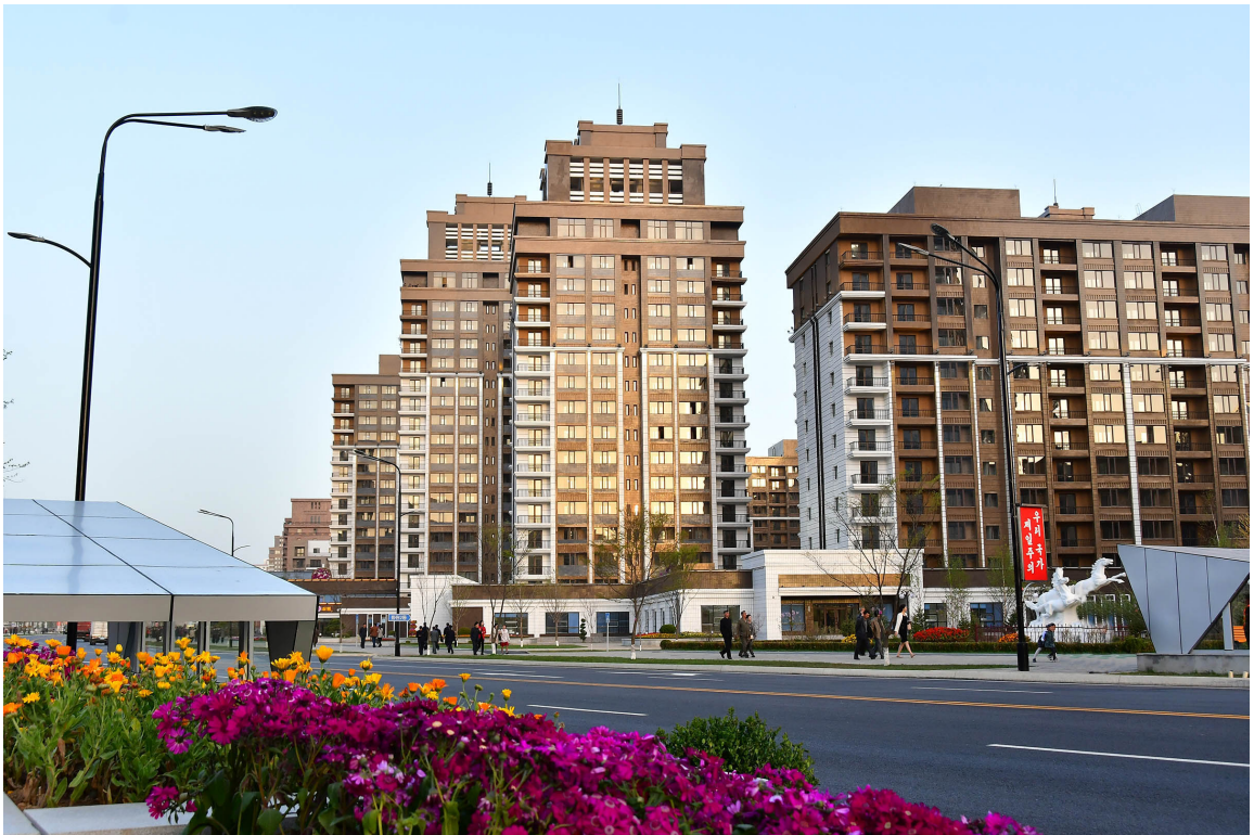
Some of the apartment houses in Rimhung Street