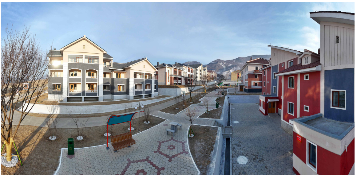
Some of the newly-built modern rural houses