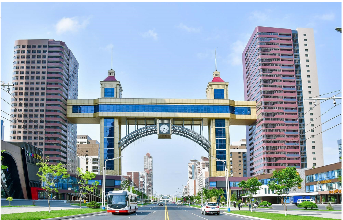
Houses and neighbourhood-serving amenities in the third-stage residential district of 10 000 flats in the Hwasong area