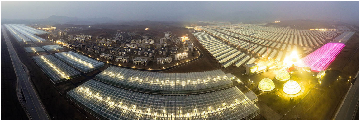
Kangdong Combined Greenhouse Farm