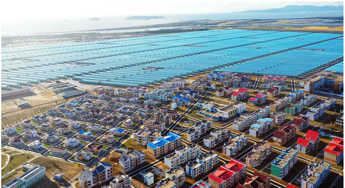
Ryonpho Greenhouse Farm