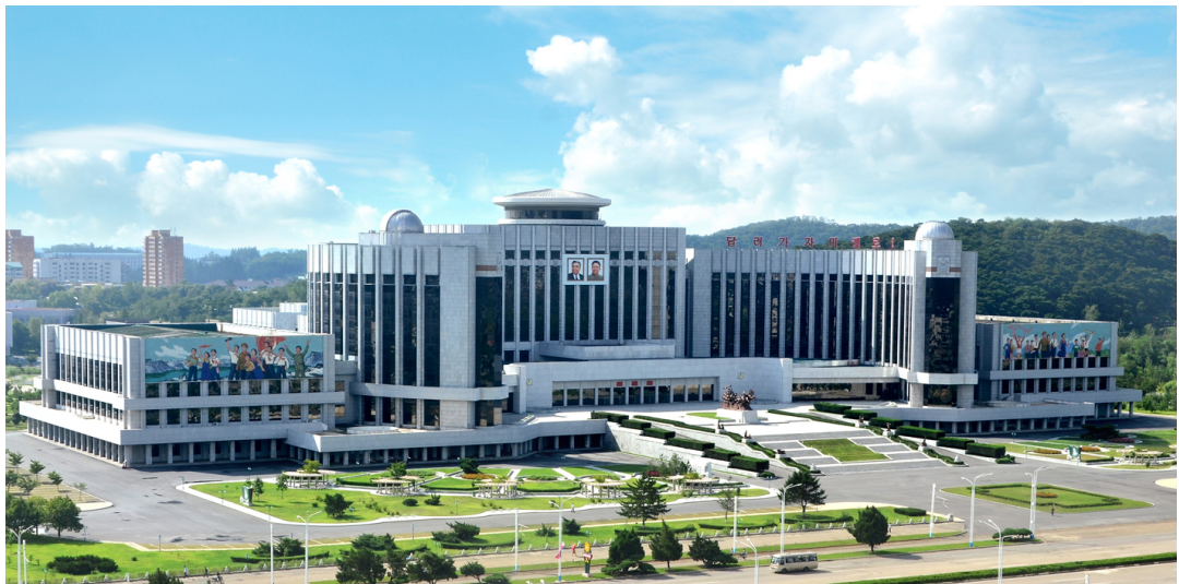
Renovated Mangyongdae Schoolchildren's Palace

Several years ago, a member of the Taekwon-Do federation of Britain, said after visiting the Mangyongdae Schoolchildren's Palace that he could not believe that such a magnificent and wonderful palace had been built for schoolchildren and that it was the best children's palace in the world as they can learn a profound knowledge of various sectors according to their hobbies and aptitudes, all free of charge.