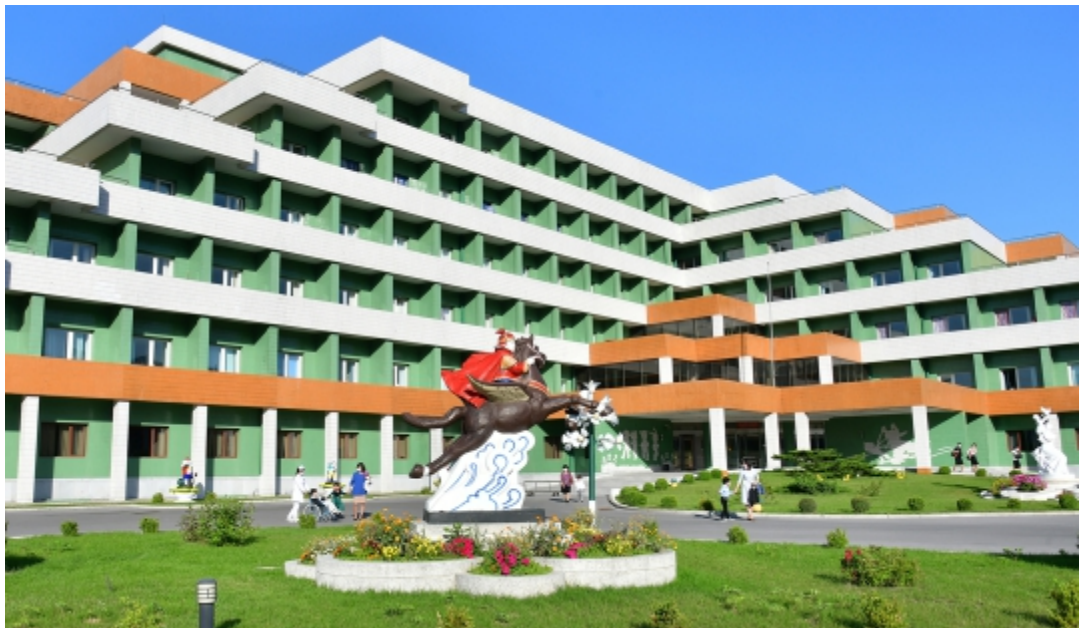
Okryu Children's Hospital

The country has also built a modernly-equipped hospital for children. The Okryu Children's Hospital in the capital city of Pyongyang has operation theatres, in-patient rooms and treatment rooms, as well as classrooms and playgrounds for the in-patients. Children can receive education and treatment during their stay at the hospital.