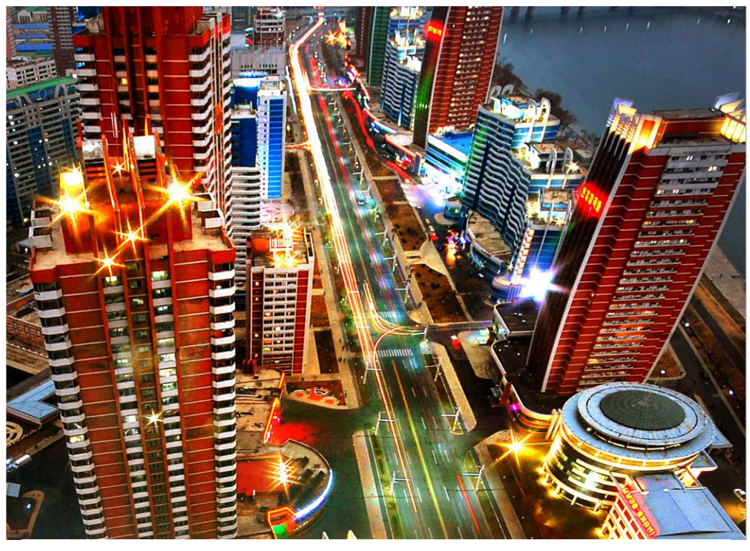
Mirae Scientists Street