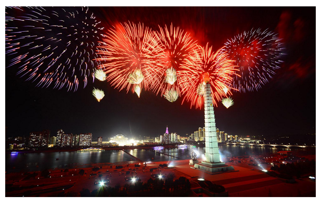
Tower of the Juche Idea