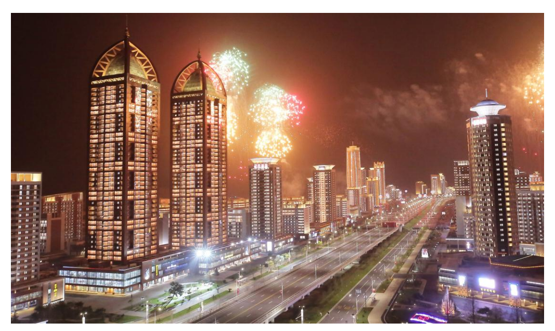
Hwasong Street completed in April 2023