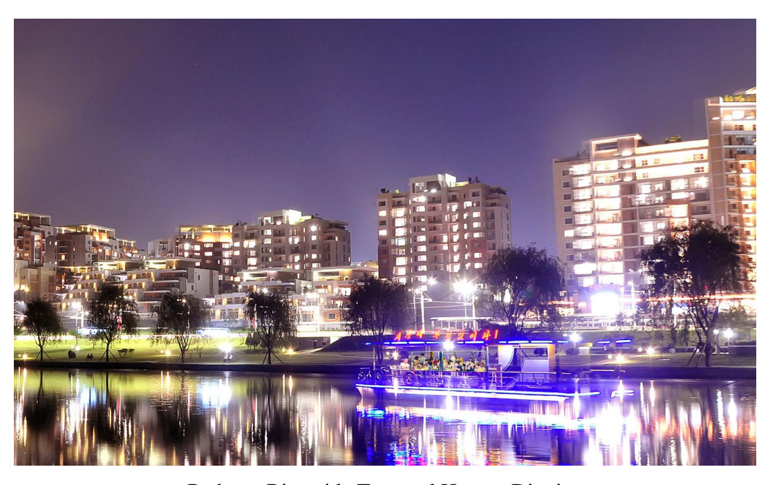
Pothong Riverside Terraced Houses District