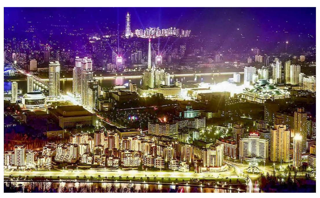
Part of Pyongyang at night