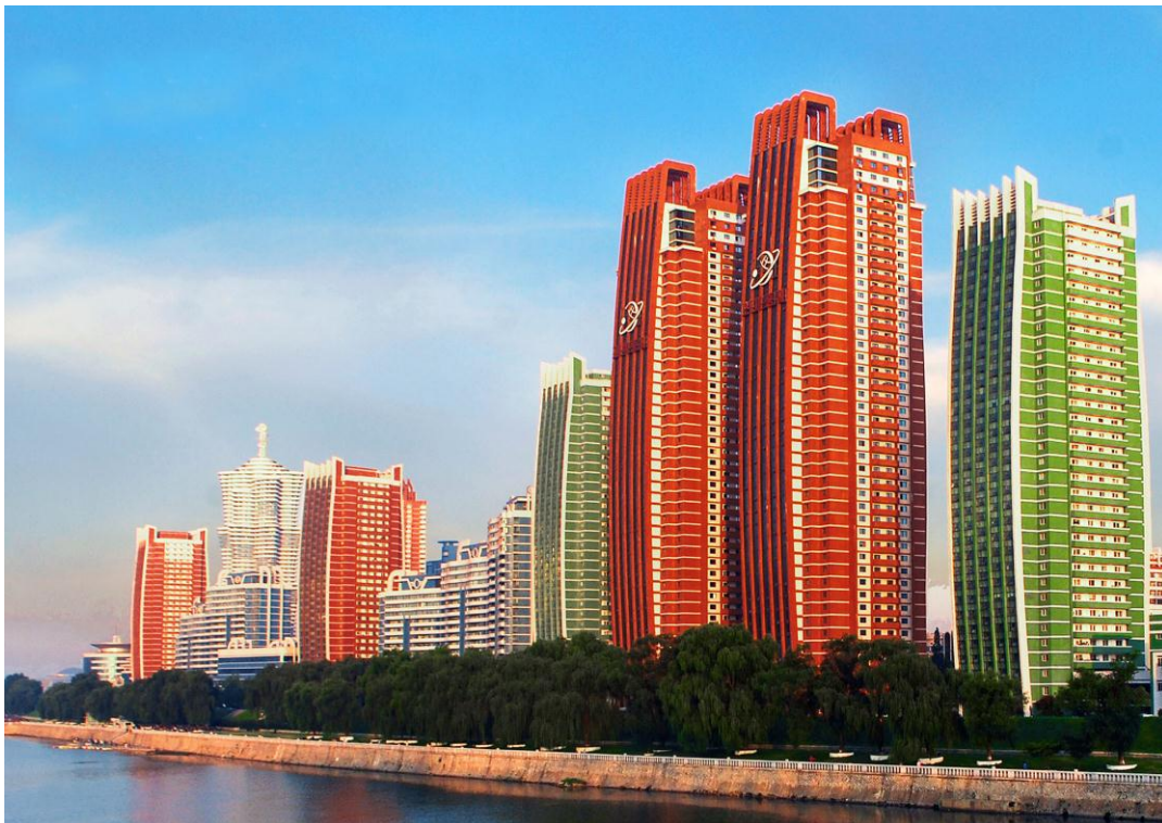
Houses on Mirae Scientists Street on the bank of the Taedong River in Pyongyang and other modern houses are provided to scientists and technicians on a preferential basis.