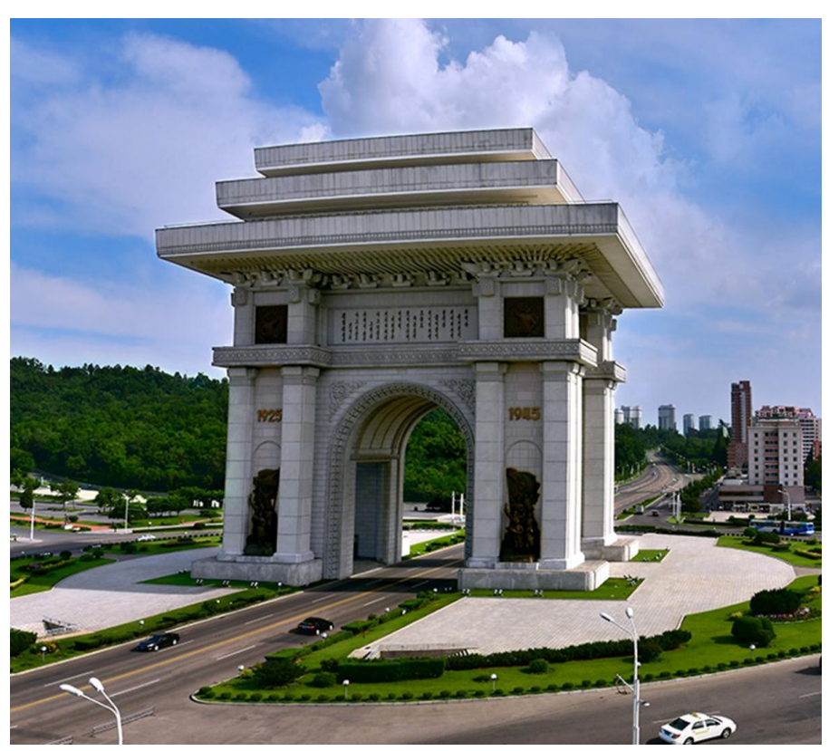
Arch of Triumph in the DPRK