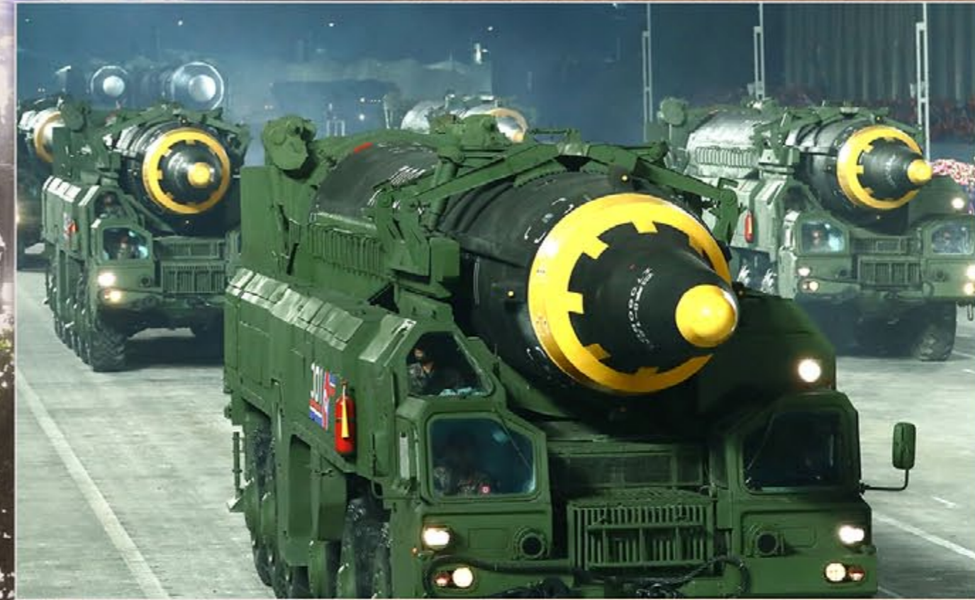
Columns of ICBMs demonstrate the dignity and strength of the DPRK