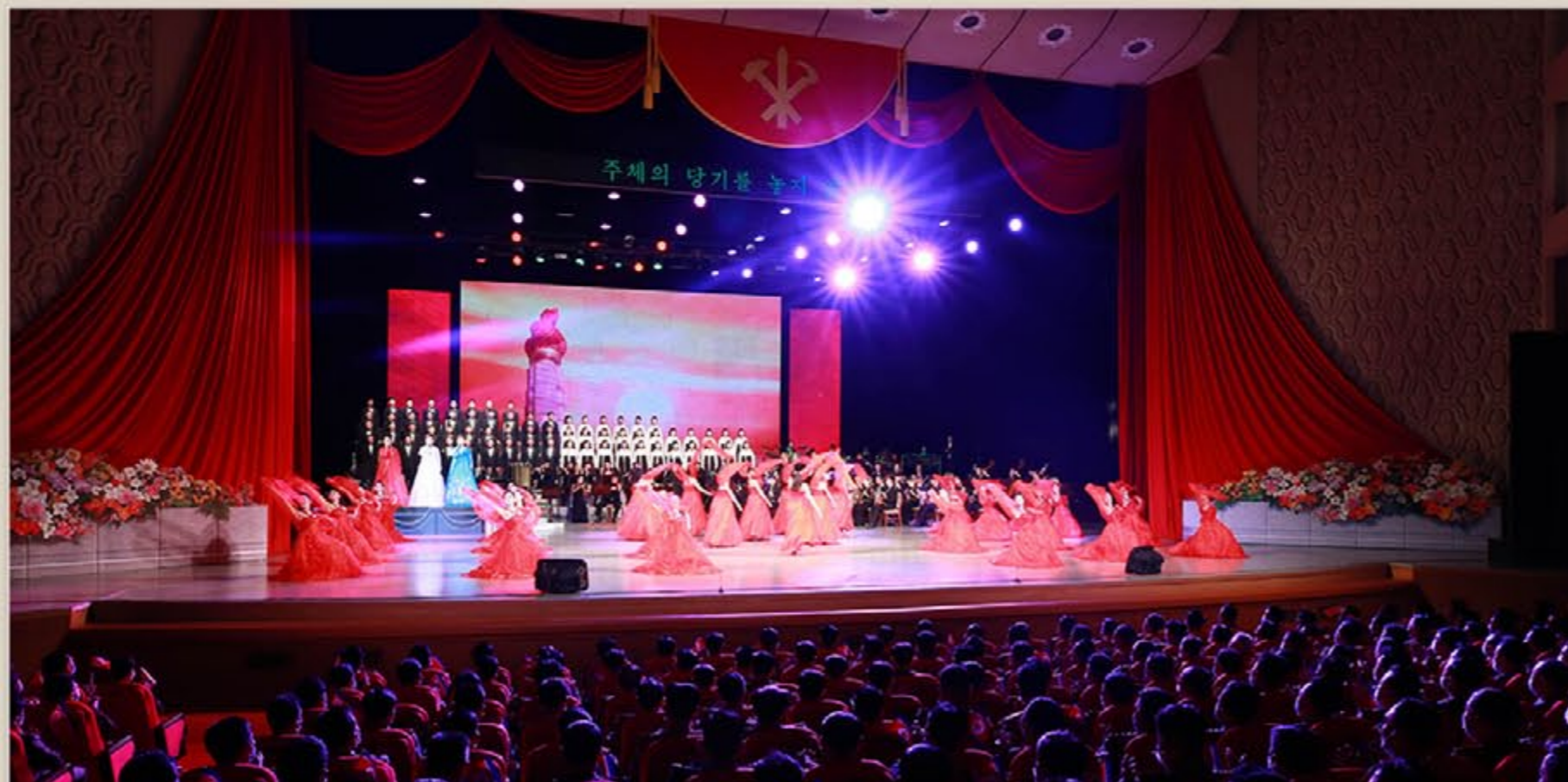
Joint performance of the Mansudae and Wangjaesan art troupes and concert of the National Symphony Orchestra