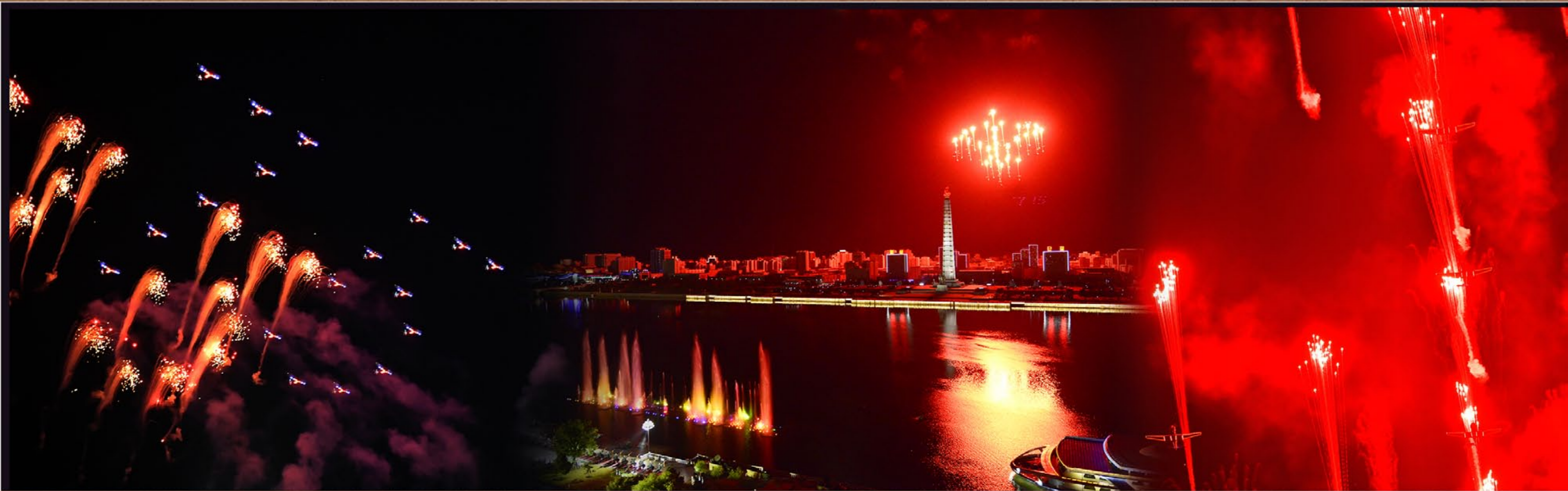
There was a flight in the sky above Kim Il Sung Square, demonstrating the invincible might of the Juche-oriented air force