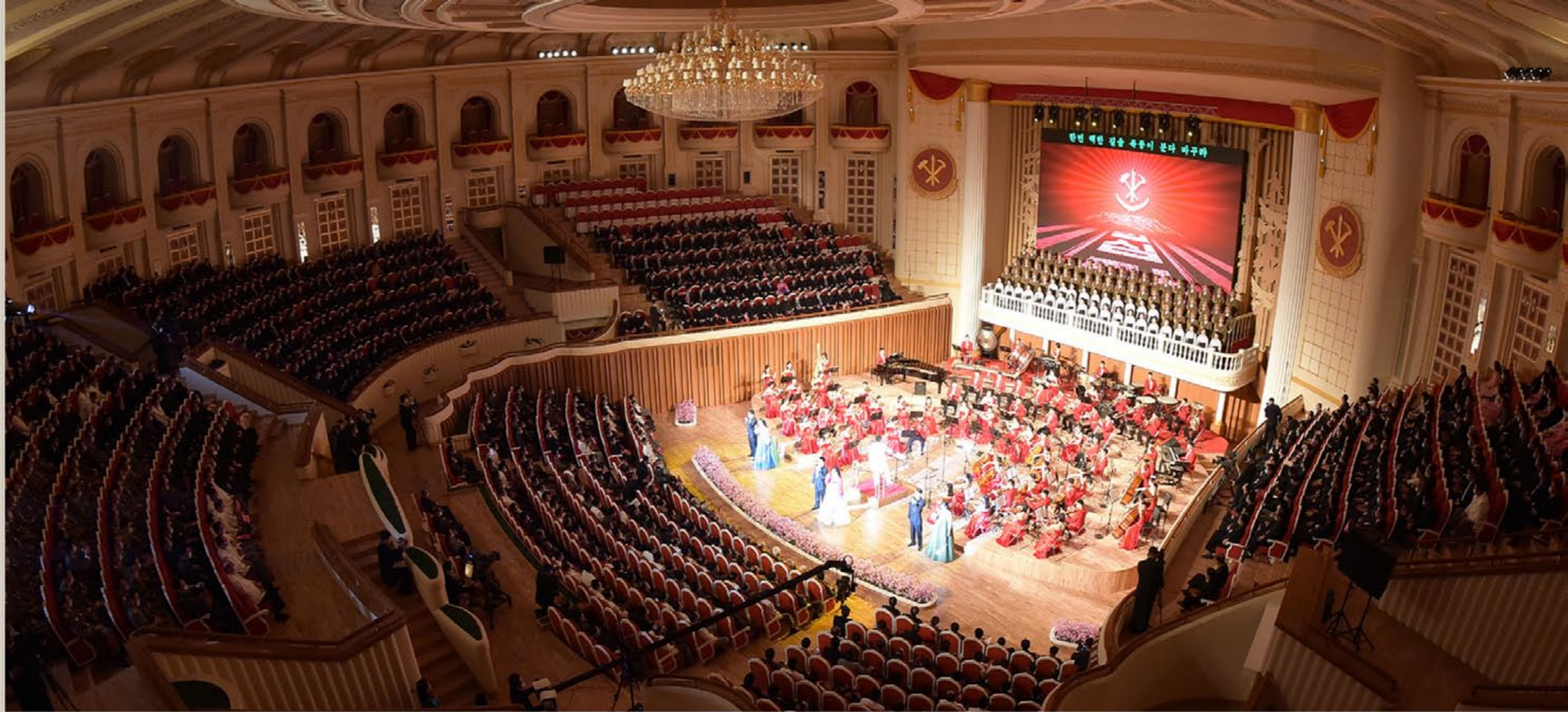
Performance of the Samjiyon Orchestra