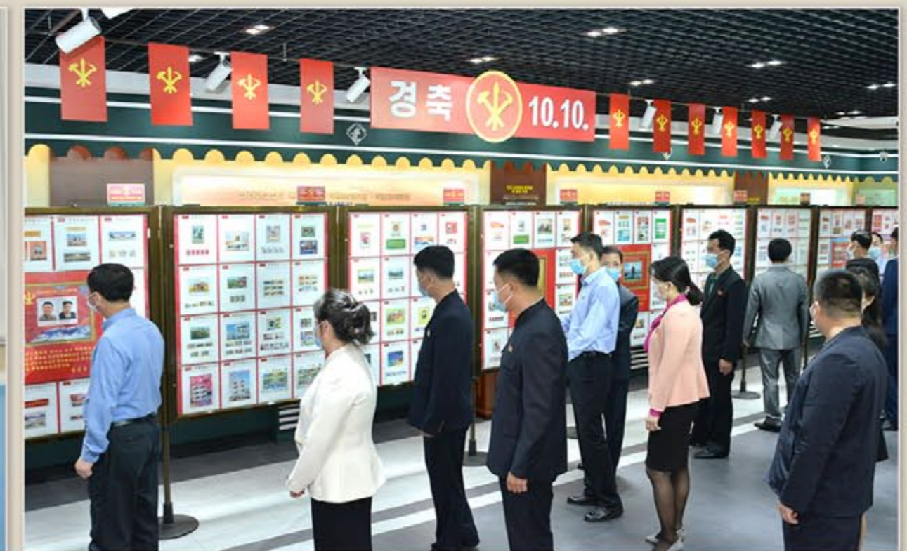
National exhibitions of books, industrial art designs and Korean stamps