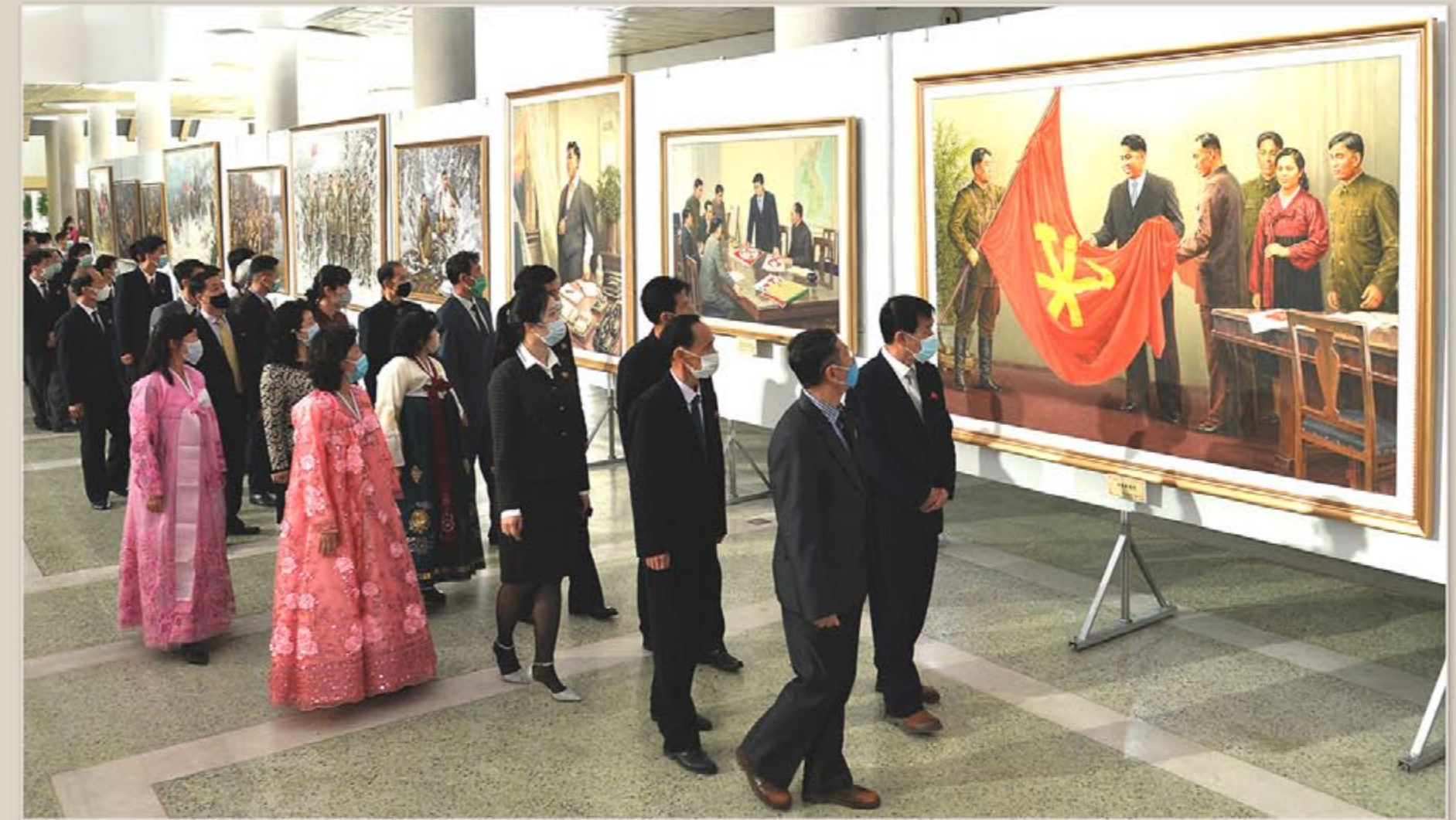
National art exhibition

All the Korean people celebrated the 75th birthday of the Workers' Party of Korea significantly.