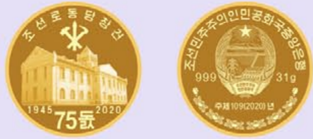
Commemorative coin "75th Founding Anniversary of the Workers' Party of Korea" (gold coin)