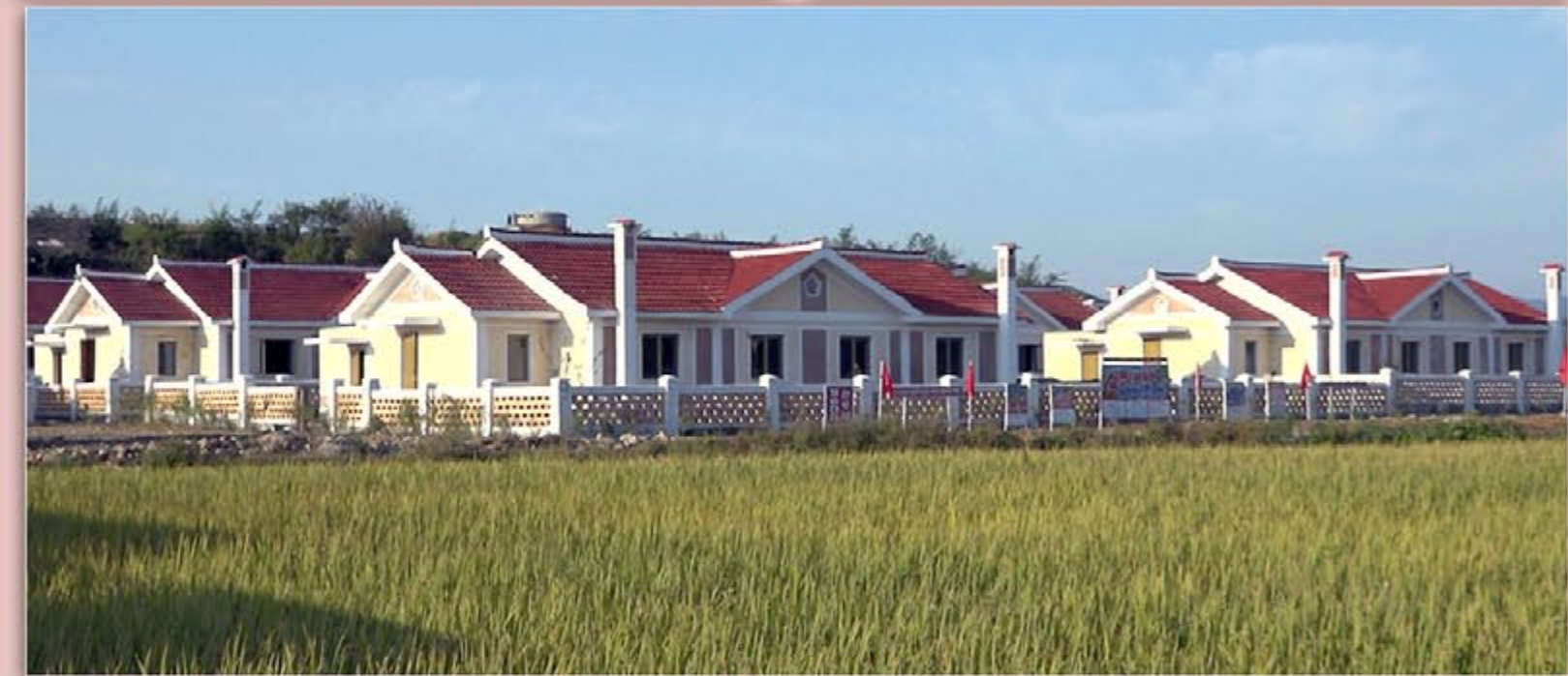
Flood victims moved to new houses on the eve of the October holiday