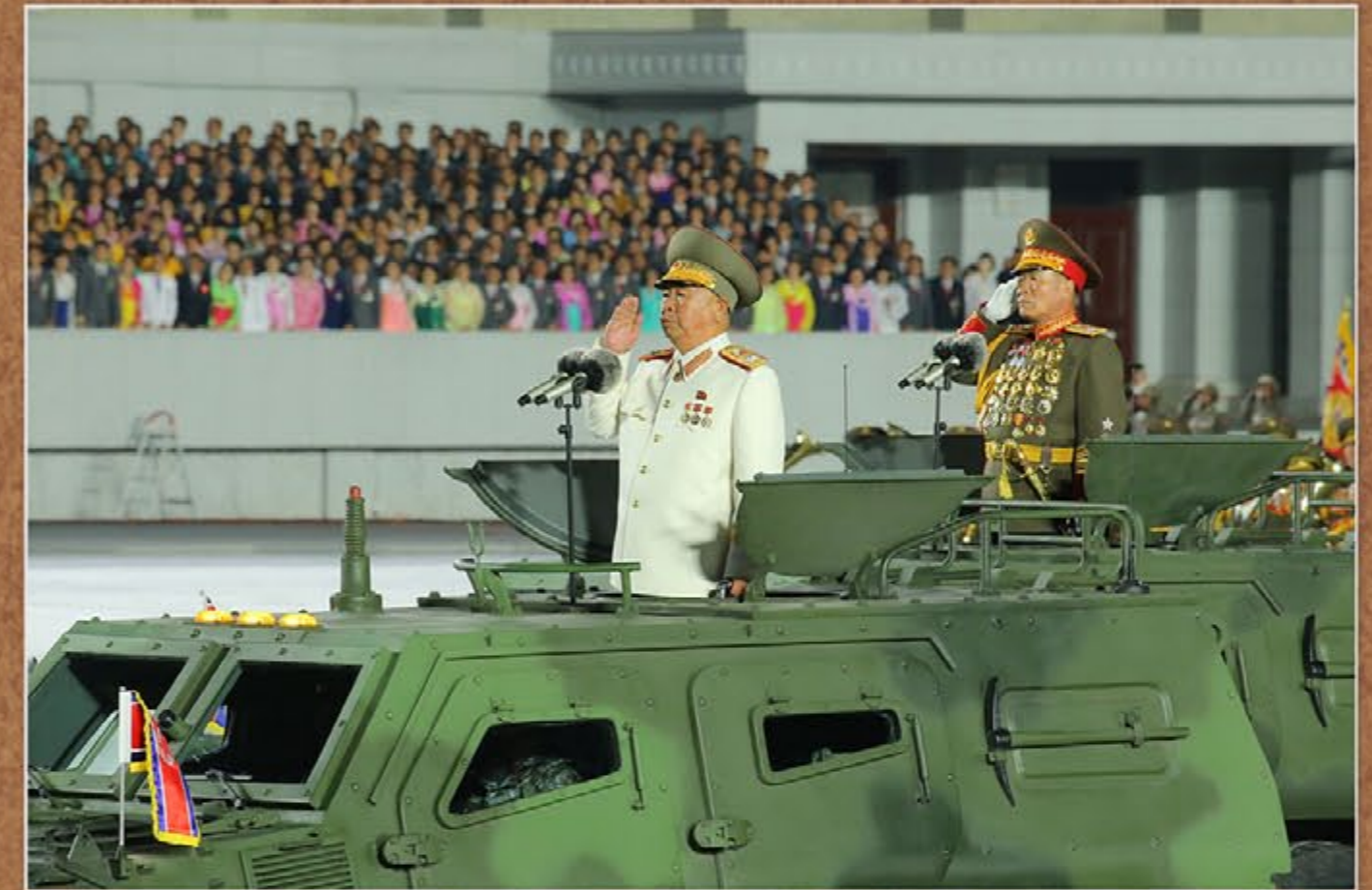
KPA Marshal Ri Pyong Chol, vice-chairman of the Central Military Commission of the WPK, reported to the Chairman of the WPK that the military parade was ready to start

On the order of Marshal Pak Jong Chon, chief of the