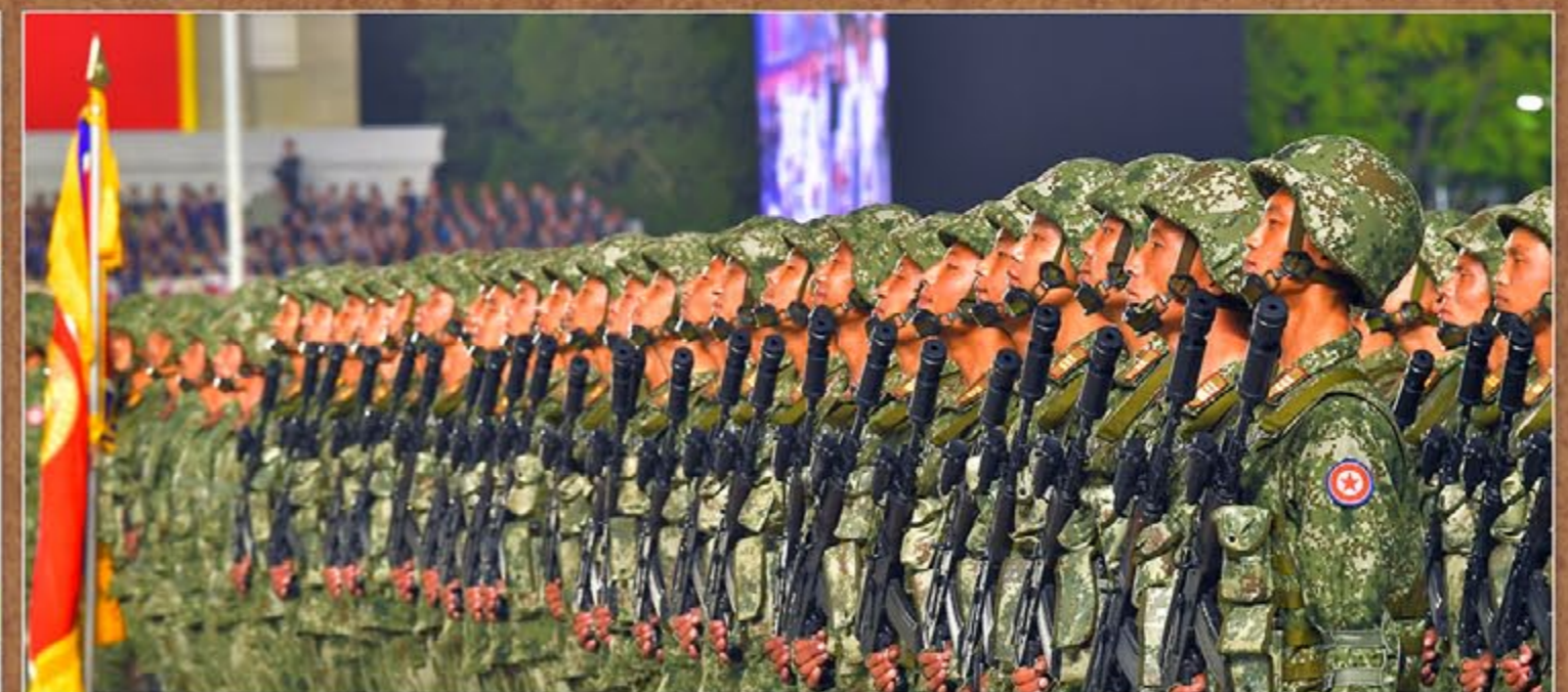
KPA Marshal Pak Jong Chon, chief of the KPA General Staff, ordered the columns of the armed forces of the DPRK to start the military parade