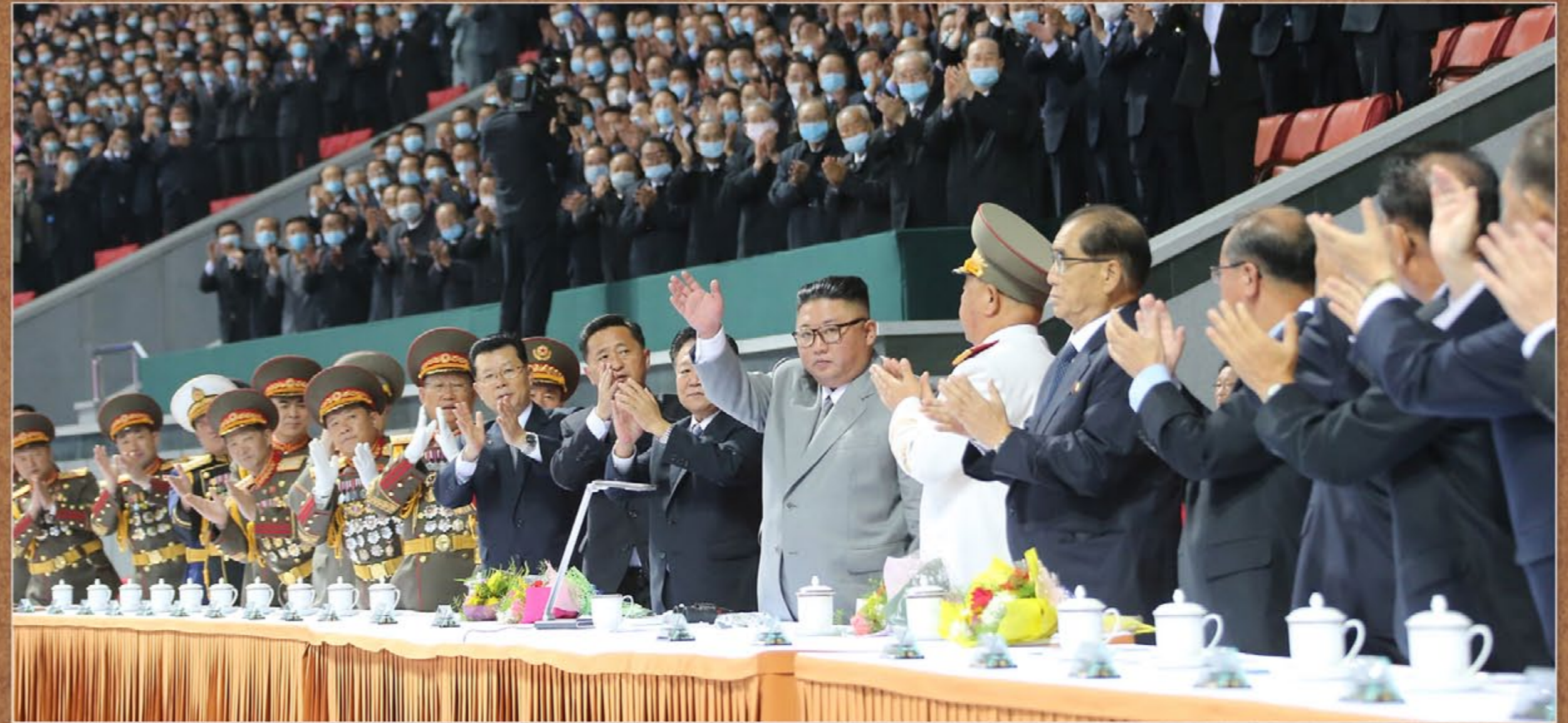
Supreme Leader Kim Jong Un waved back to the performers of the grand gala and the audience in October 2020