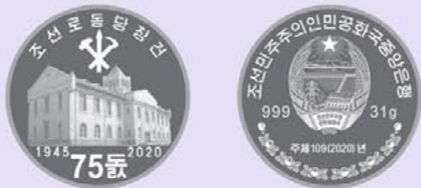
Commemorative coin "75th Founding Anniversary of the Workers' Party of Korea" (silver coin)