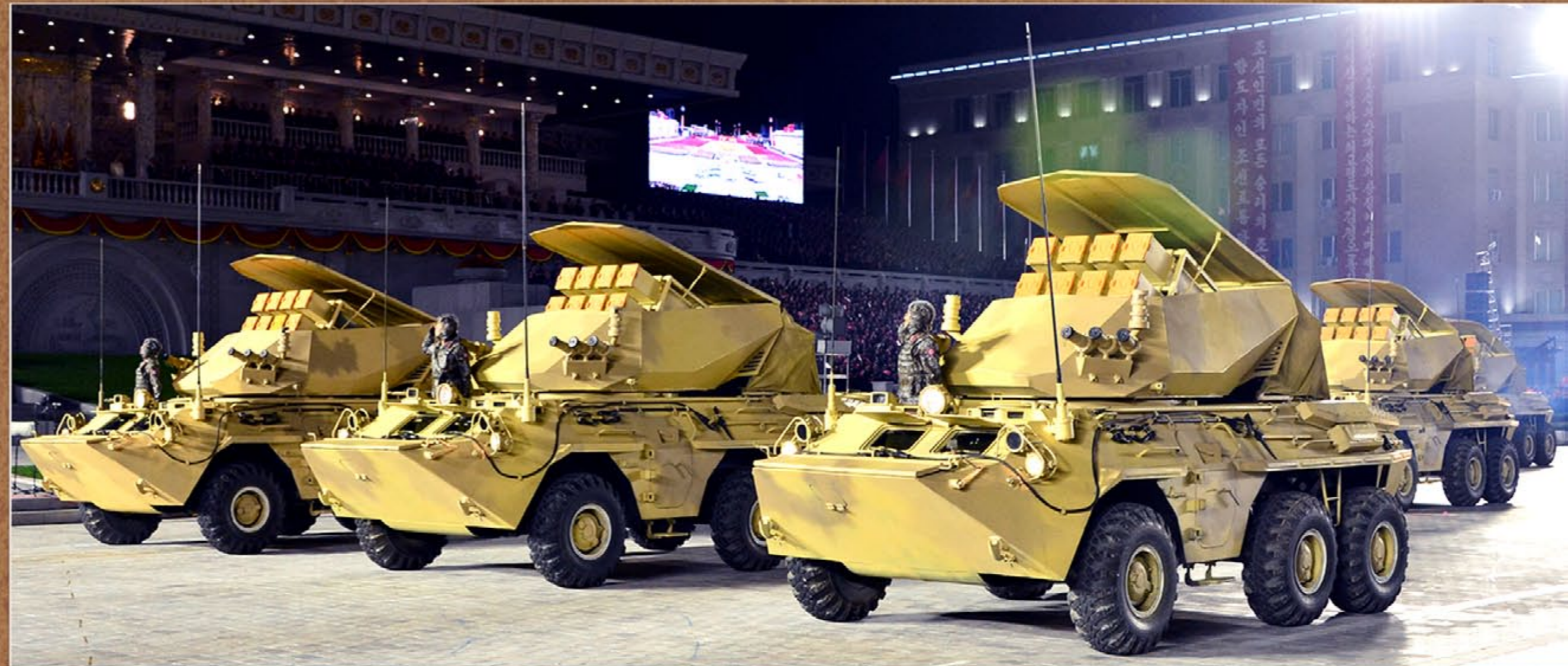
Columns of mechanized units began their procession led by the column of armoured vehicles

of pride of the armed forces of the DPRK.