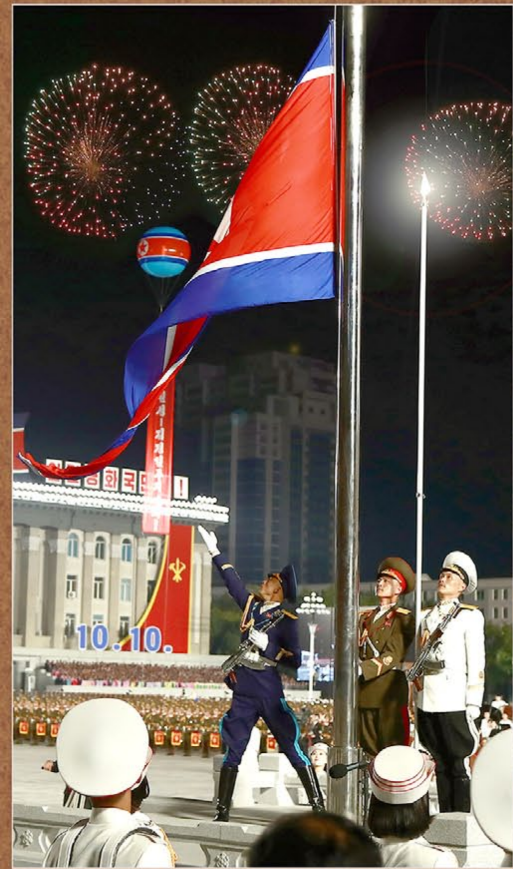
The national flag was hoisted amid the playing of The Patriotic Song