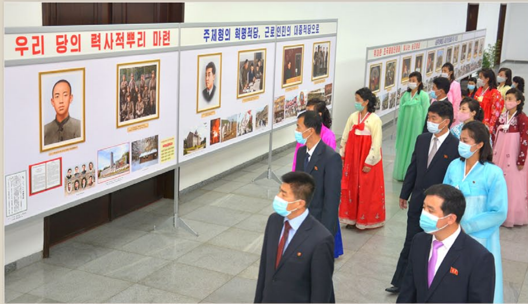
National photo exhibition