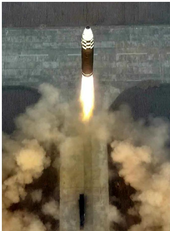
The drill confirmed the mobile and normal manoeuvrability and reliability of the DPRK's nuclear war deterrent.