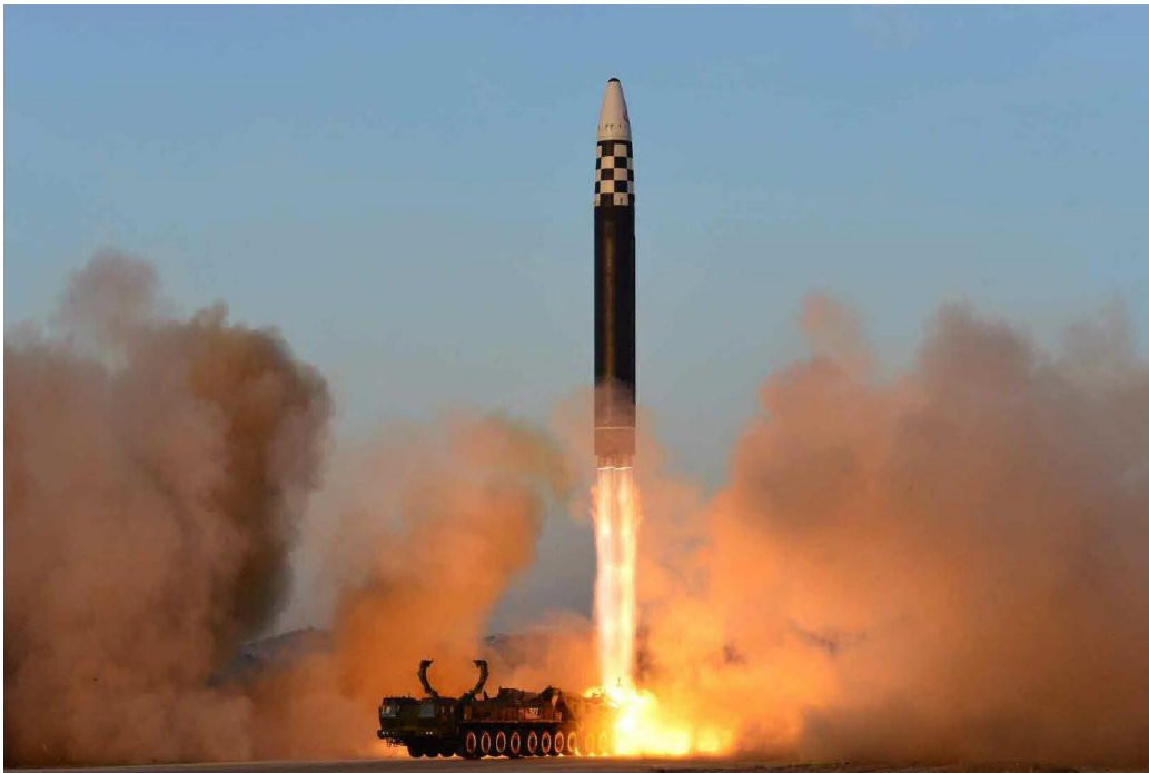
ICBM Hwasongpho-17 launched at Pyongyang International Airport