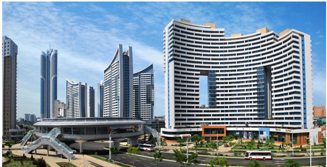
Some of the 10 000 flats in Songhwa Street, inaugurated in 2022