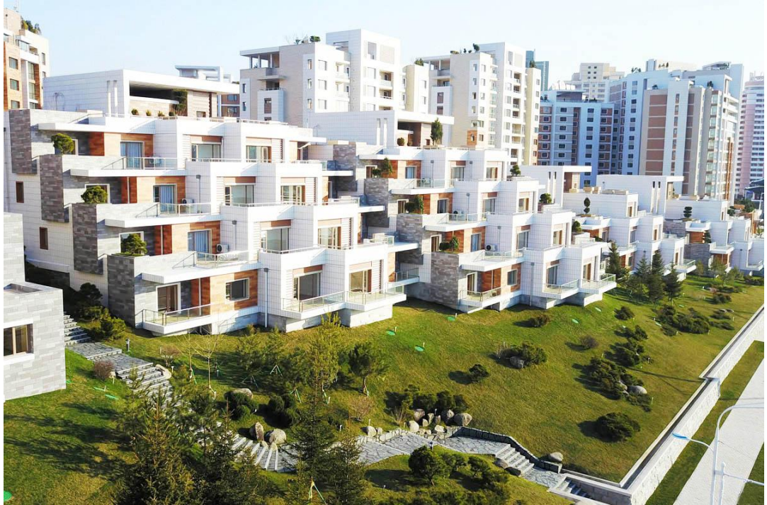
Flats in the luxury residential district in Kyongru-dong on the Pothong Riverside, were provided free of charge to the meritorious people and other labour innovators.