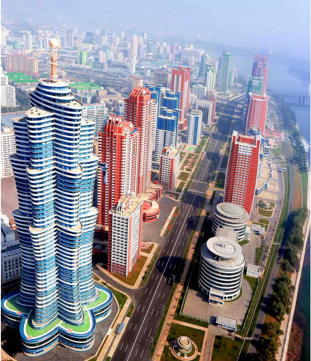
Unique style of Mirae Scientists Street completed in 2015