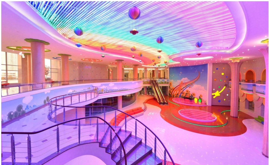
Colourfully-decorated interior of the Mangyongdae Schoolchildren's Palace