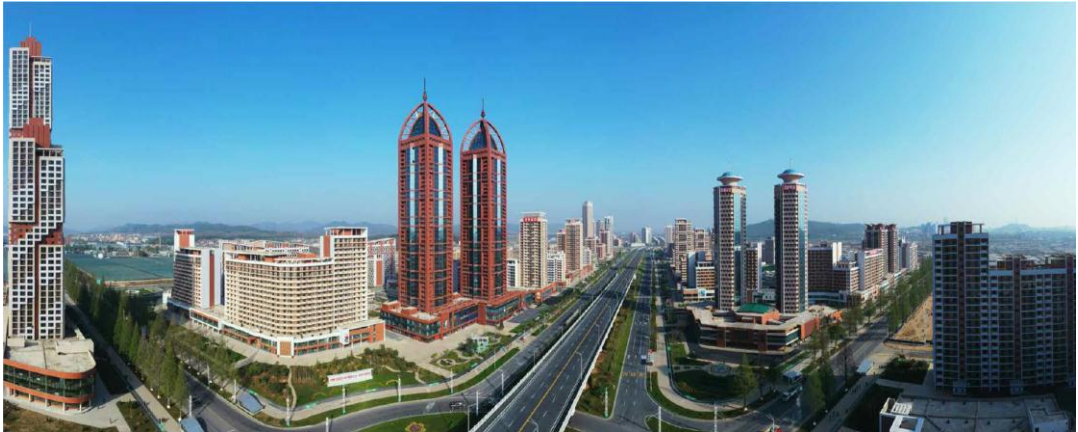
Some of the 10 000 flats built in the Hwasong area as the first stage (inaugurated in April this year)