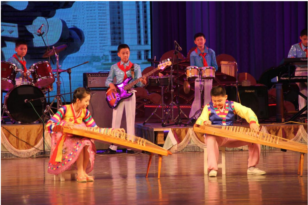
Students are displaying their talents to the full in an excellent theatre.