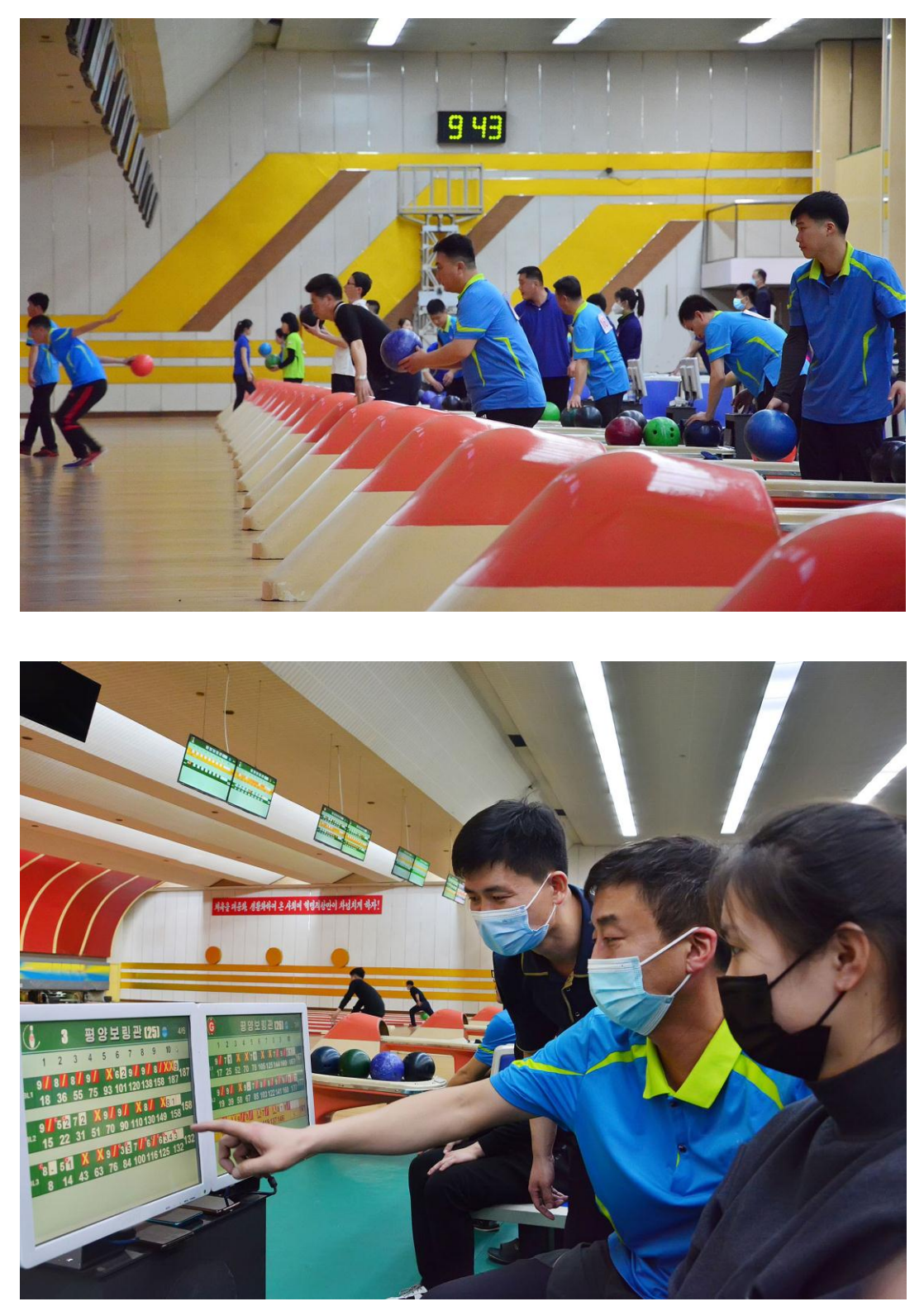
Fans analyzing game results