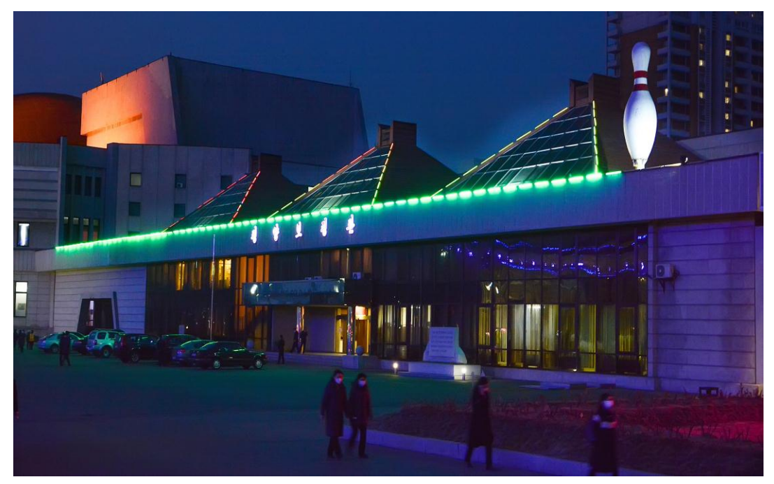
The Pyongyang Gold Lane