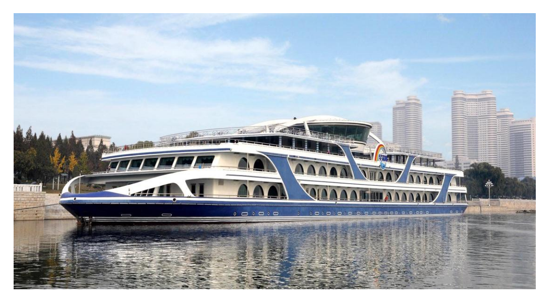
Full-service ship Mujigae