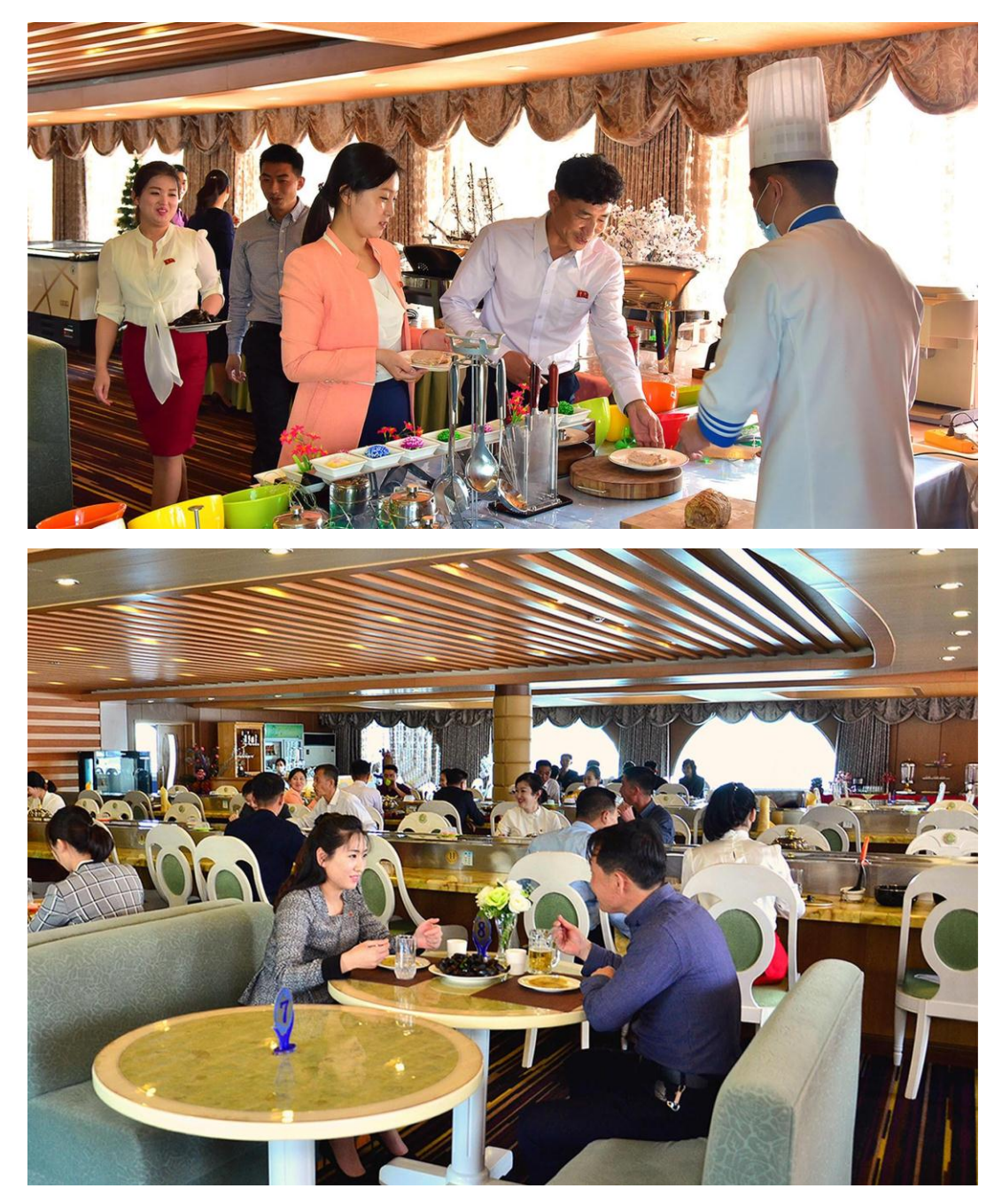
Pyongyang citizens enjoying themselves on board Mujigae