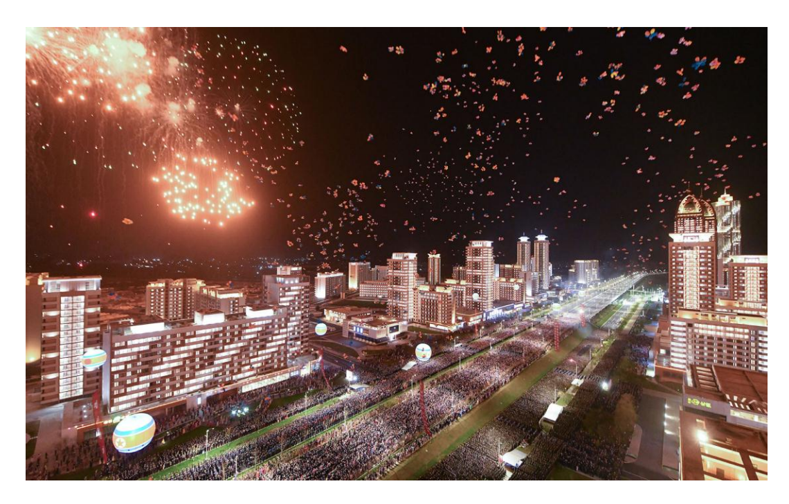
Inauguration ceremony on April 16 this year of 10 000 flats built as the first stage in the Hwasong area