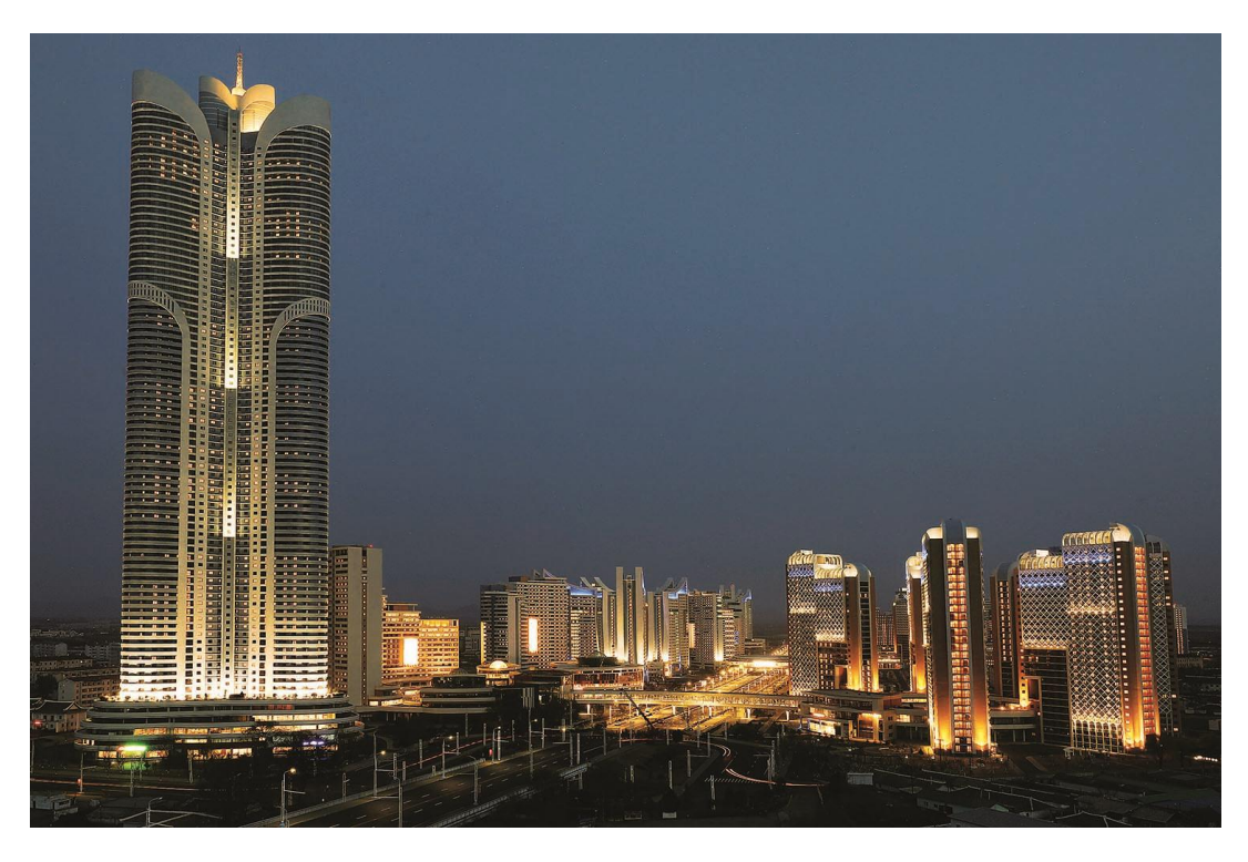
Part of 10 000-flat residential quarters in Songhwa Street inaugurated in April 2022