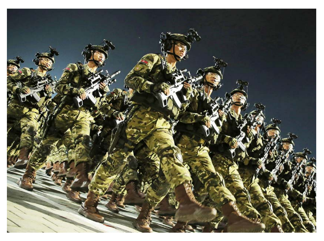
The service personnel are fully determined to defend peace and security in the Korean peninsula and beyond.