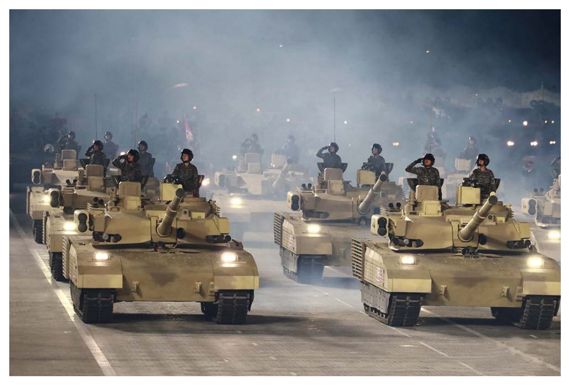
Leading tanks of the Korean People's Army