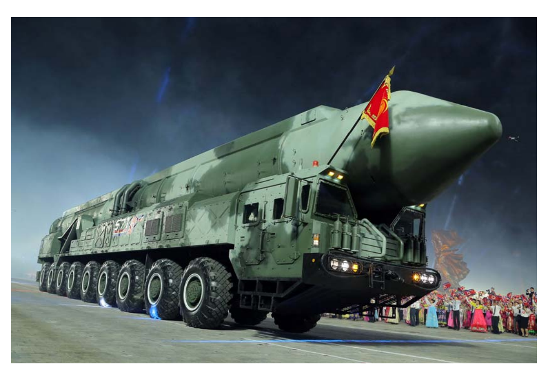
Hwasongpho-18, a new-type intercontinental ballistic missile