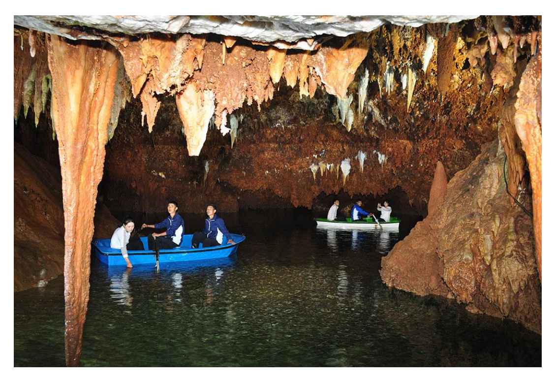
Visitors enjoying boating

Consisting of a trunk and dozens of branches, it exhibits indescribable scenes in over ten sections including Kuanmun, Phokpho and Kiam.