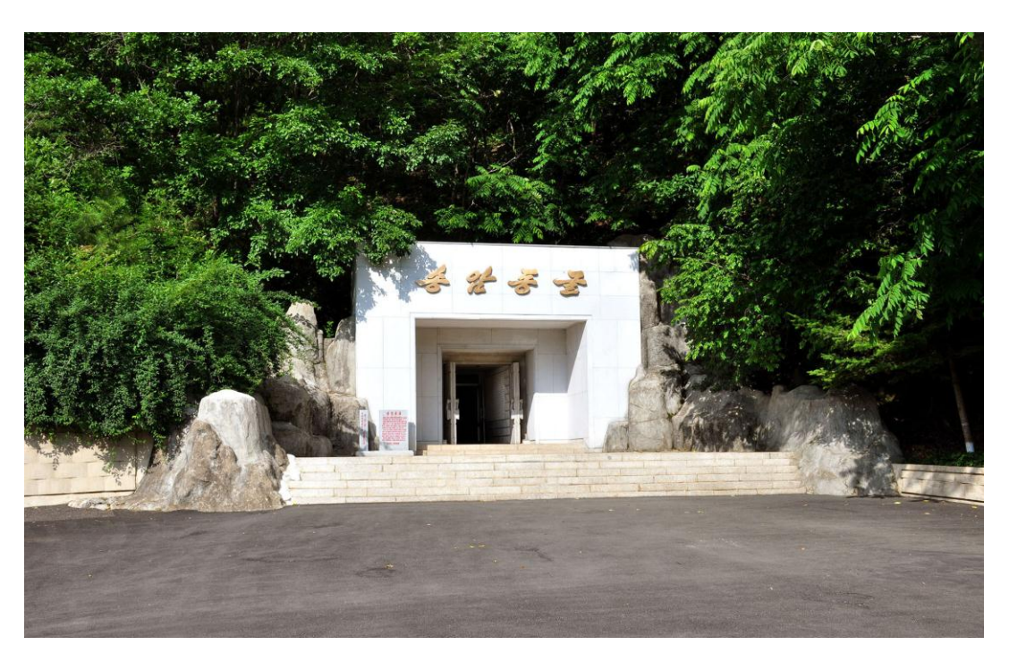
Entrance to the Songam Cavern