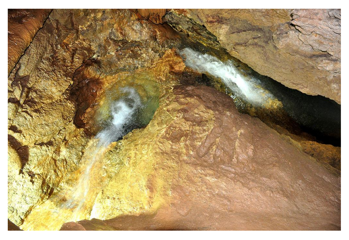
There are even waterfalls, streams and lakes with fish in the cavern.