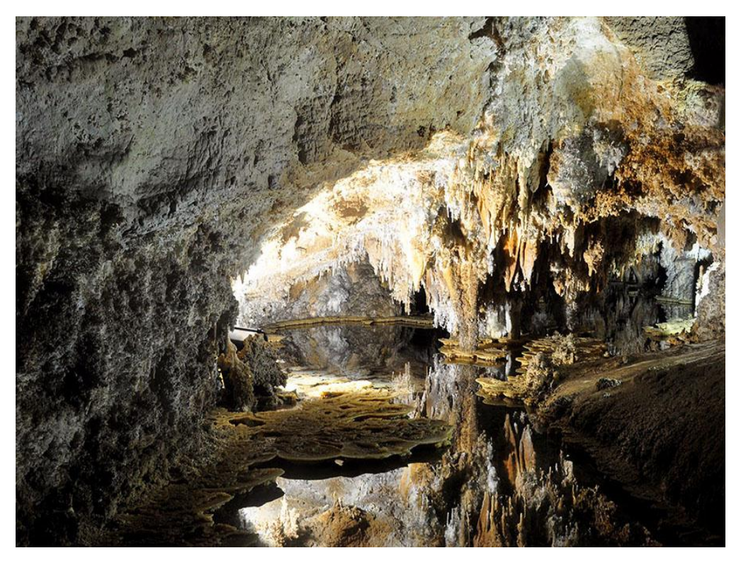
Parts of the Songam Cavern