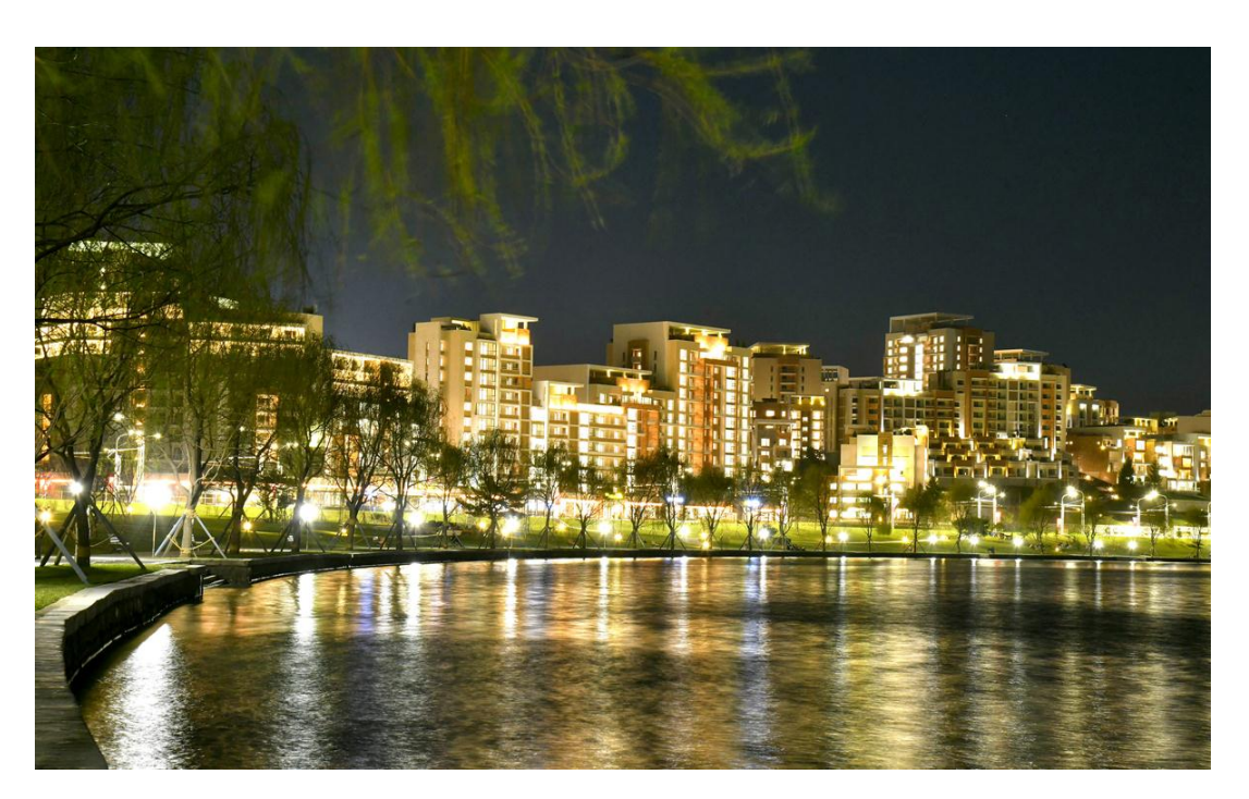
Part of Pothong Riverside Terraced Houses District