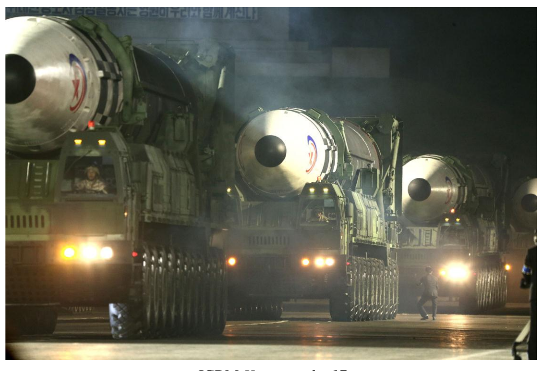
ICBM Hwasongpho 17