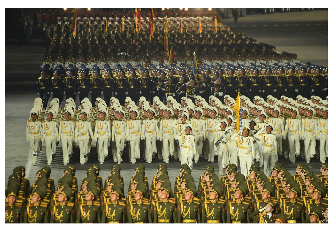
Columns of KPA units marching in fine array across Kim Il Sung Square in Pyongyang