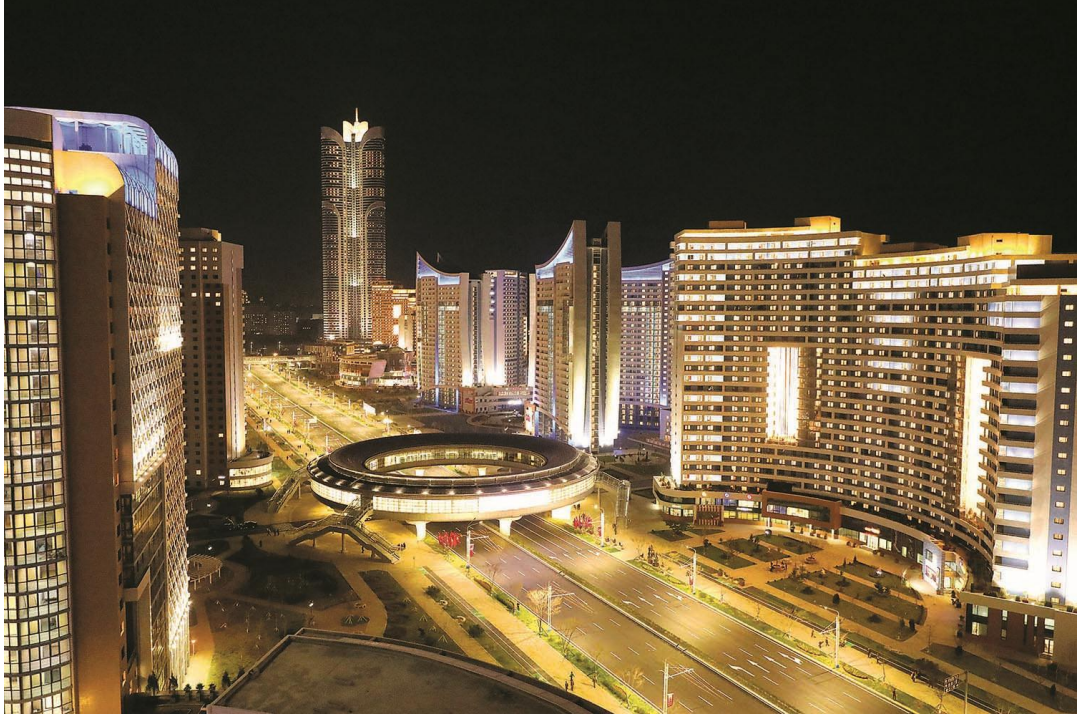
Songhwa Street, an architectural group of 10\ 000\ flats