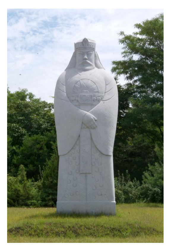
Tangun's eldest son Puru