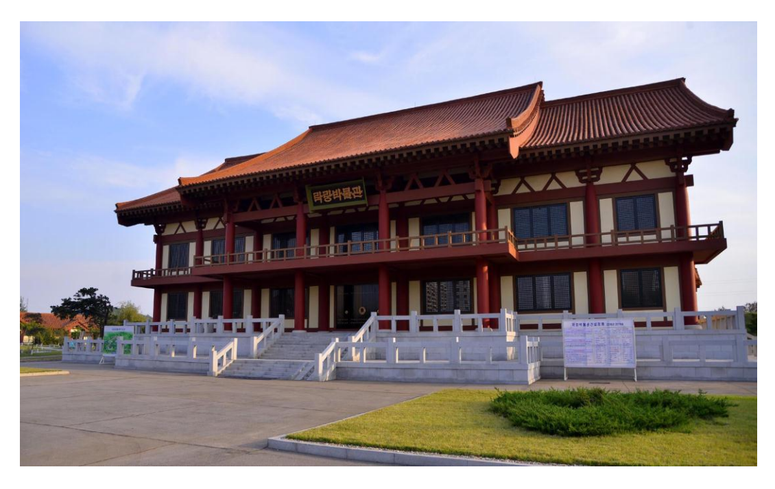
Rangnang Museum in Rangnang District, Pyongyang