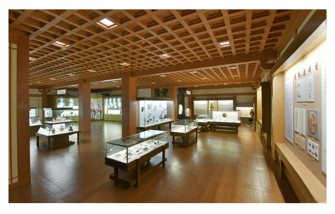
Relics and remains on display