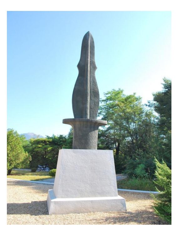
A dagger tower