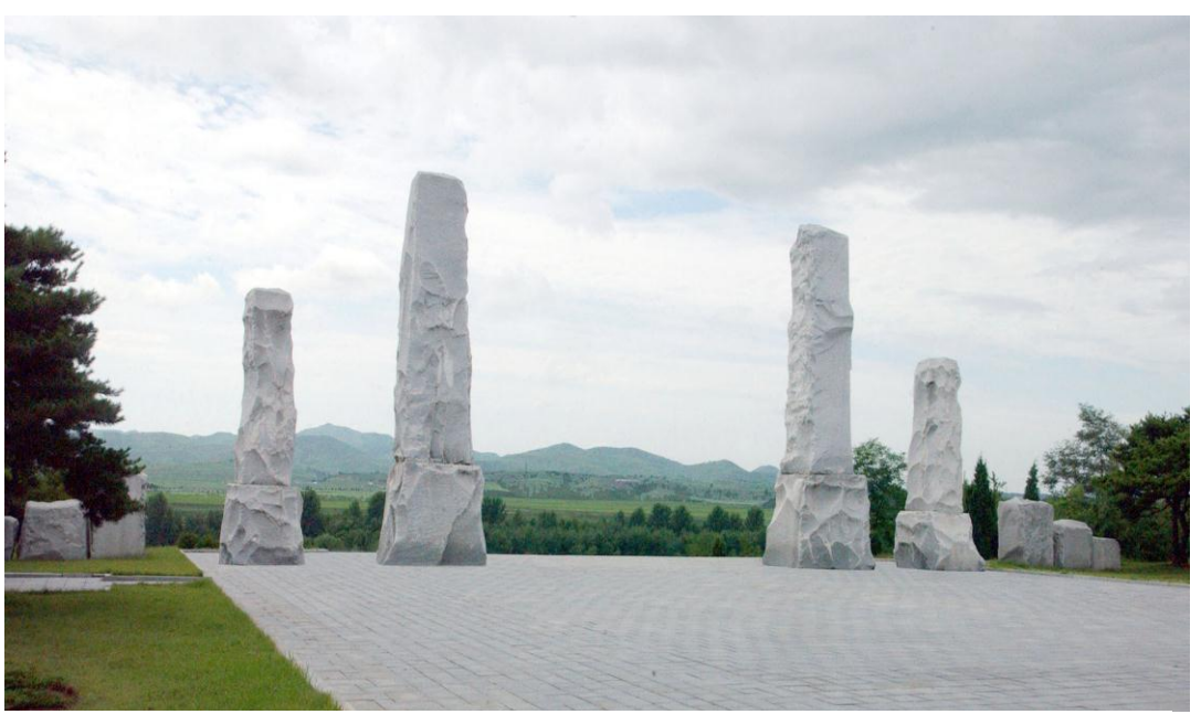
Gateposts at the entrance of the mausoleum (The gateposts represent the gate to the mausoleum.)