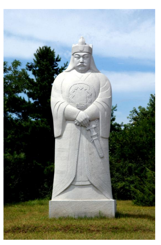
Tangun's fourth son Puyo