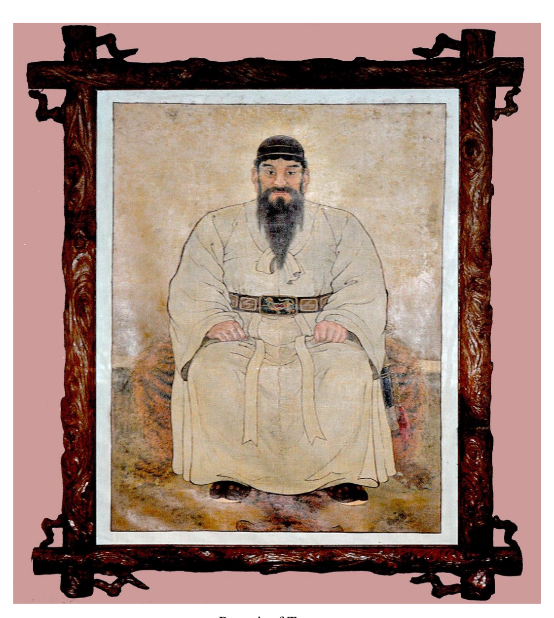
Portrait of Tangun