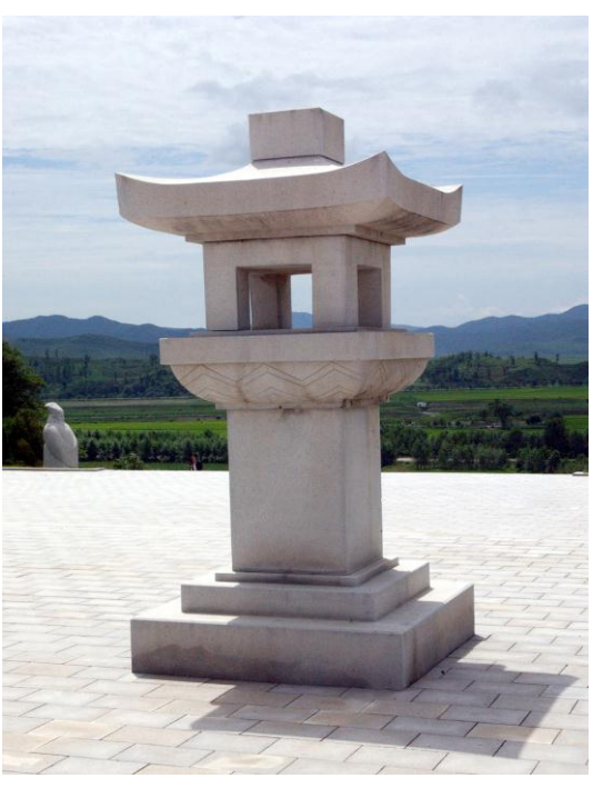
A stone lantern