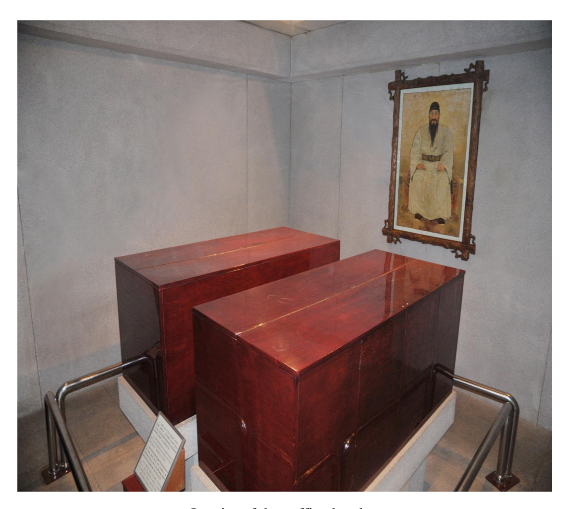
Interior of the coffin chamber