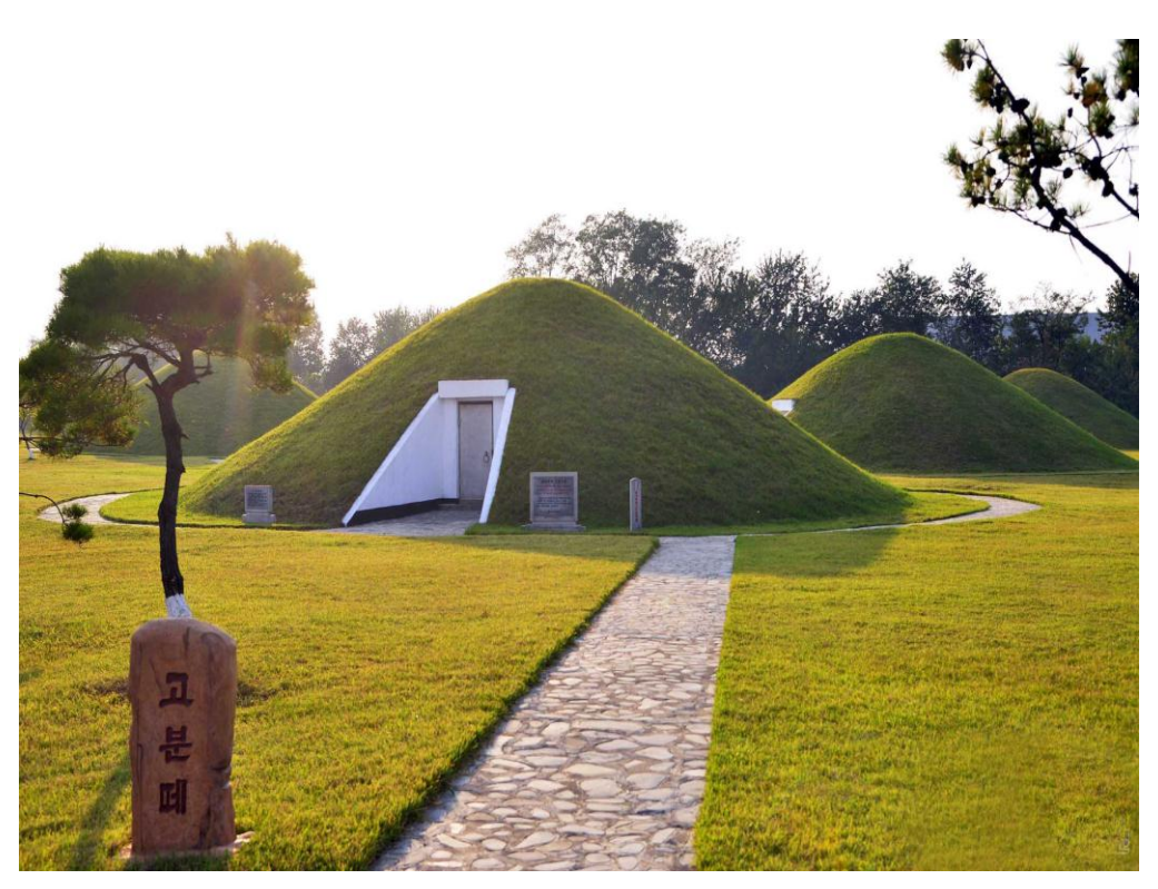
Restored ancient tombs showing the custom of the burial custom and architectural skills of the ancient people