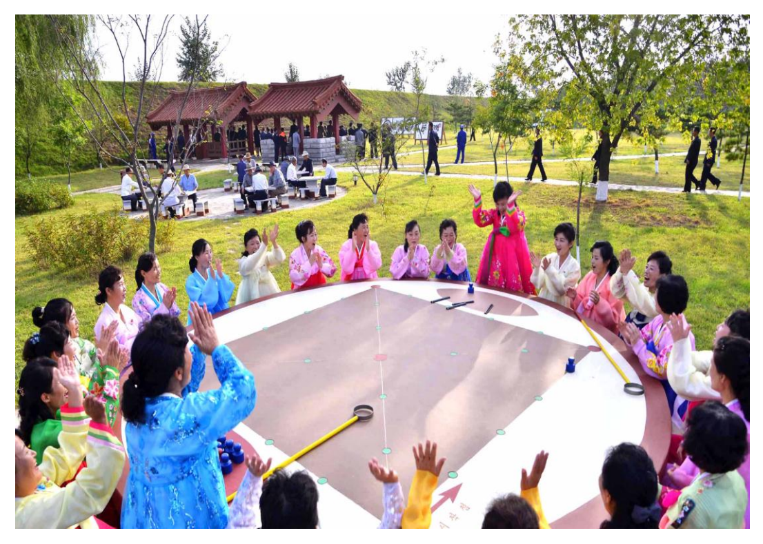
Pyongyang citizens enjoying folk games in the museum on a holiday