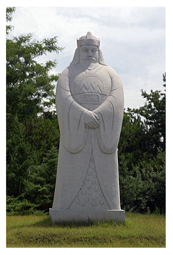
Tangun's third son Puu