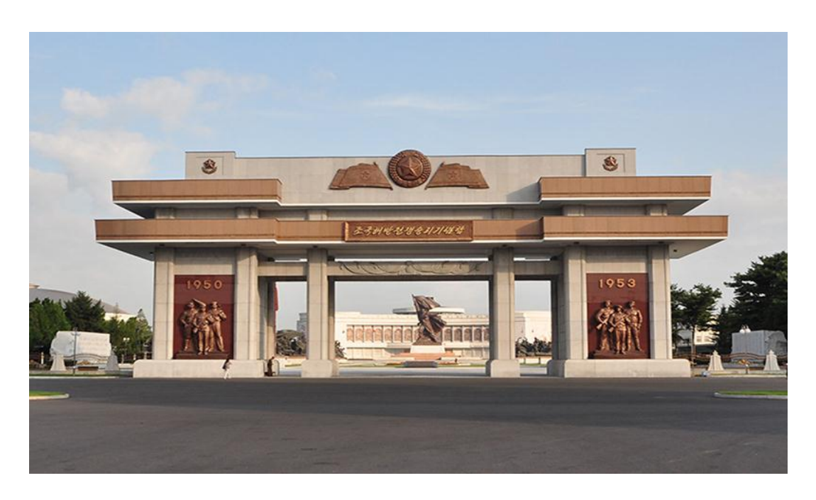
Gate to the monument