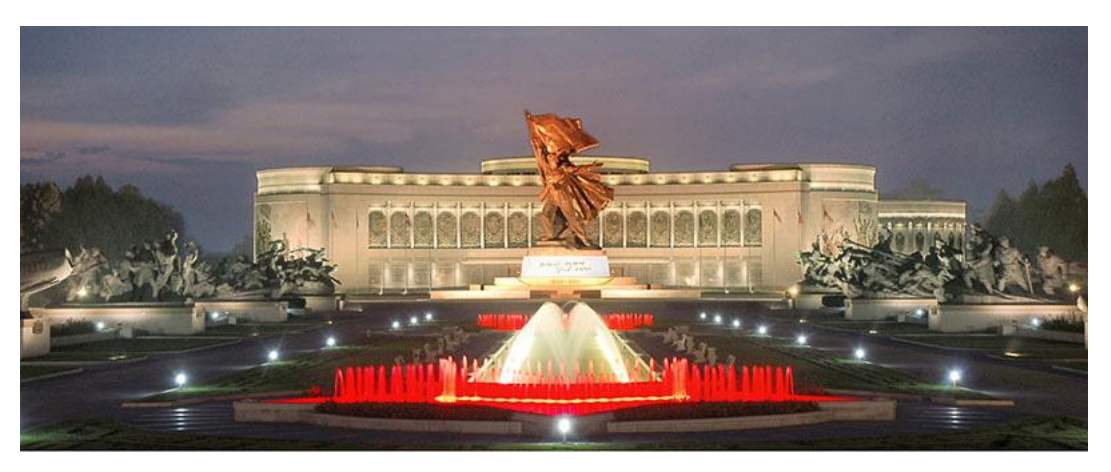
A panoramic view of the monument