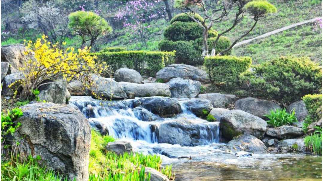
A limpid stream meandering through valleys