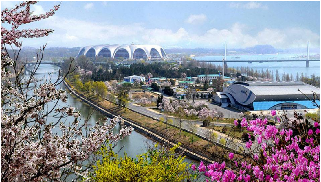
May Day Stadium with the largest number of seats in the world and Rungna People's Recreation Ground seen from Moran Hill

Moran Hill in April is an enchanting blend of natural beauty and artificial beauty.