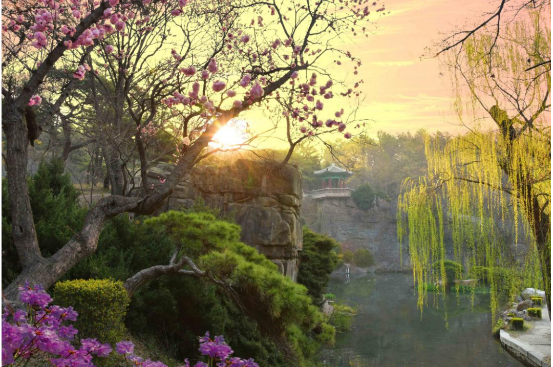
Moran Hill ablaze with morning glow