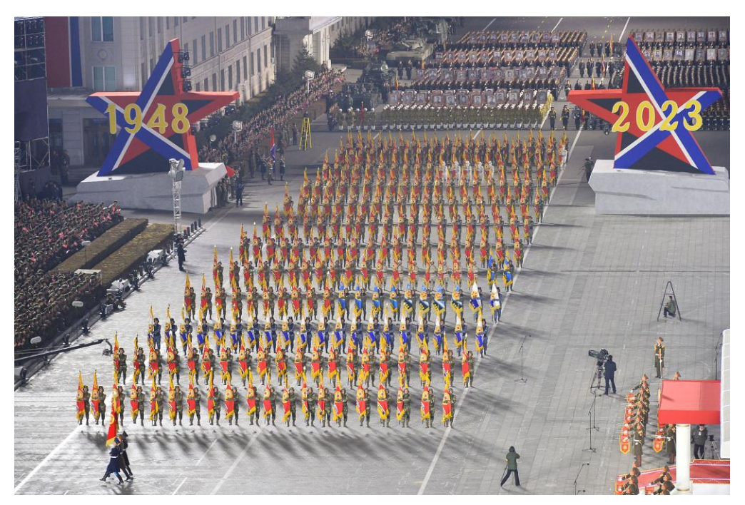
Column of the colours of the combined units at all levels of the KPA ceremoniously entering the parade ground

The redesigned colours made their debut in the parade, demonstrating their dignity and honour.