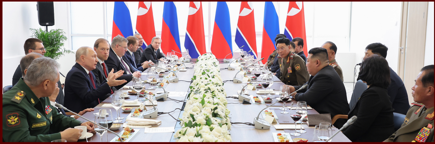
The banquet is going on in a friendly and amicable atmosphere without regard to stereotyped convention