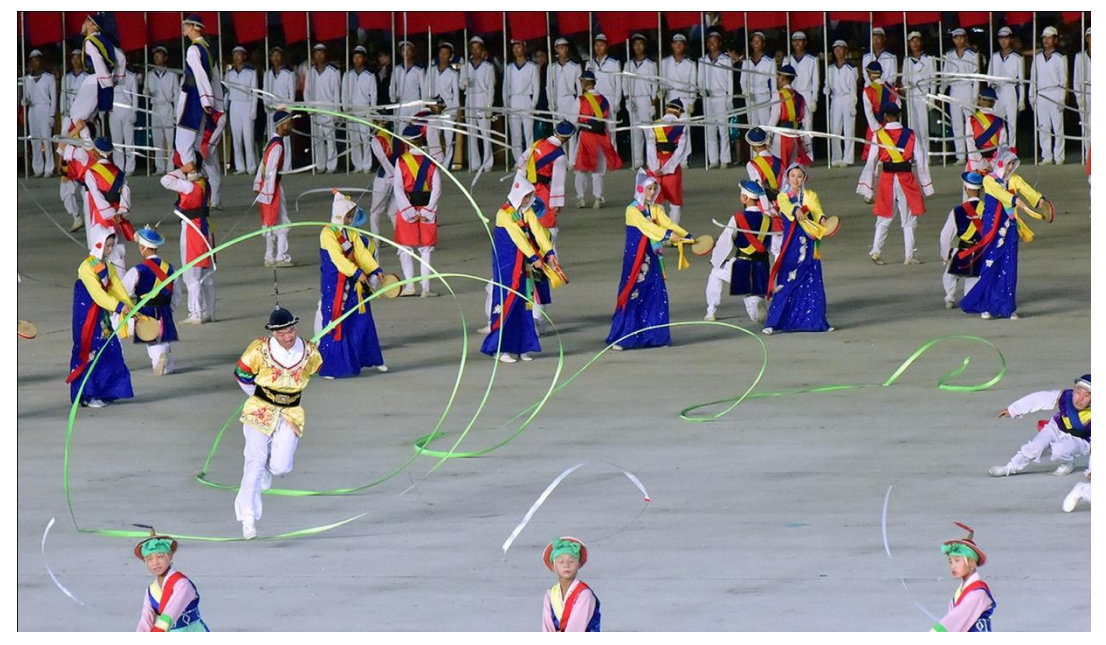
Sangmo dance was performed in various art shows including the grand mass gymnastics and artistic performance The Glorious Motherland (2018).