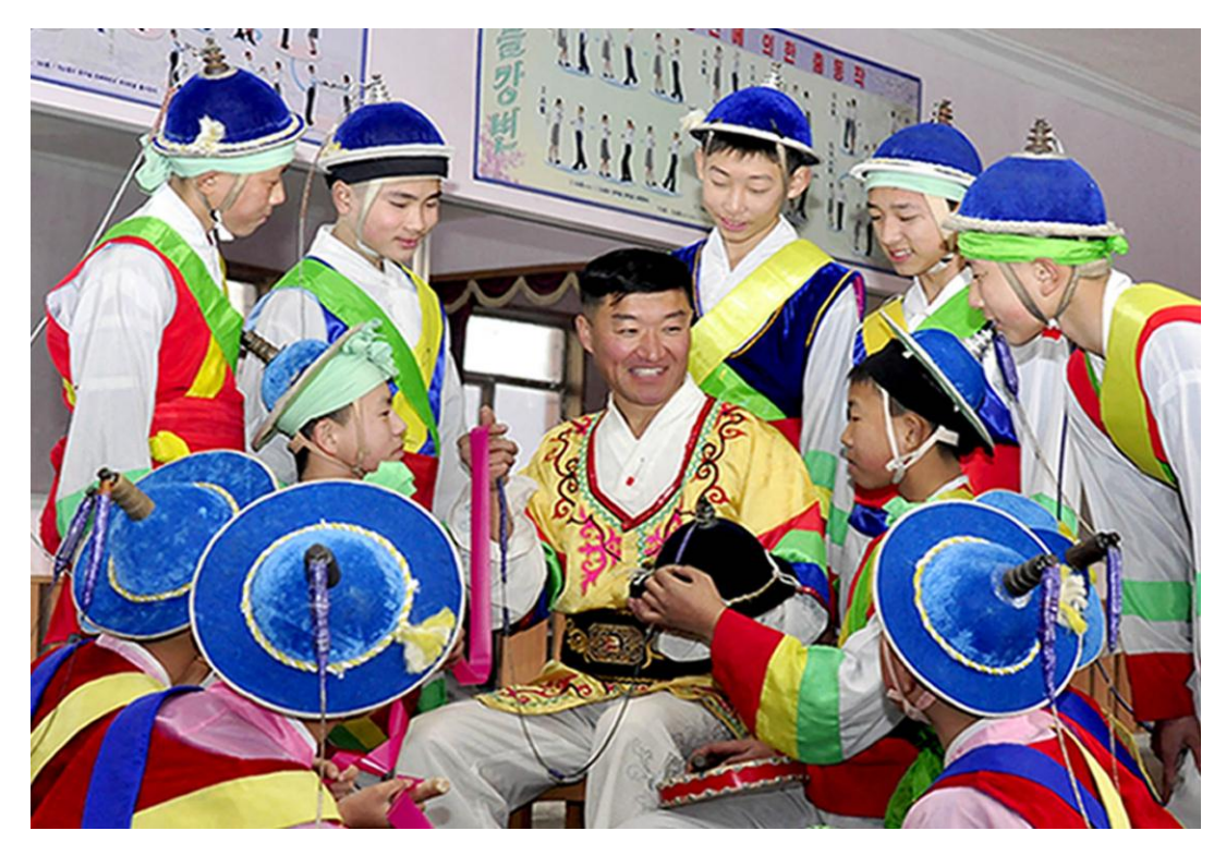
The students are learning the skills of Sangmo dance.