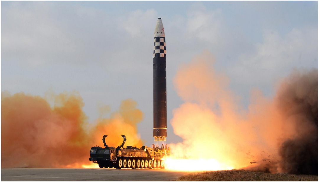
Test-launch of new-type ICBM Hwasongpho-17