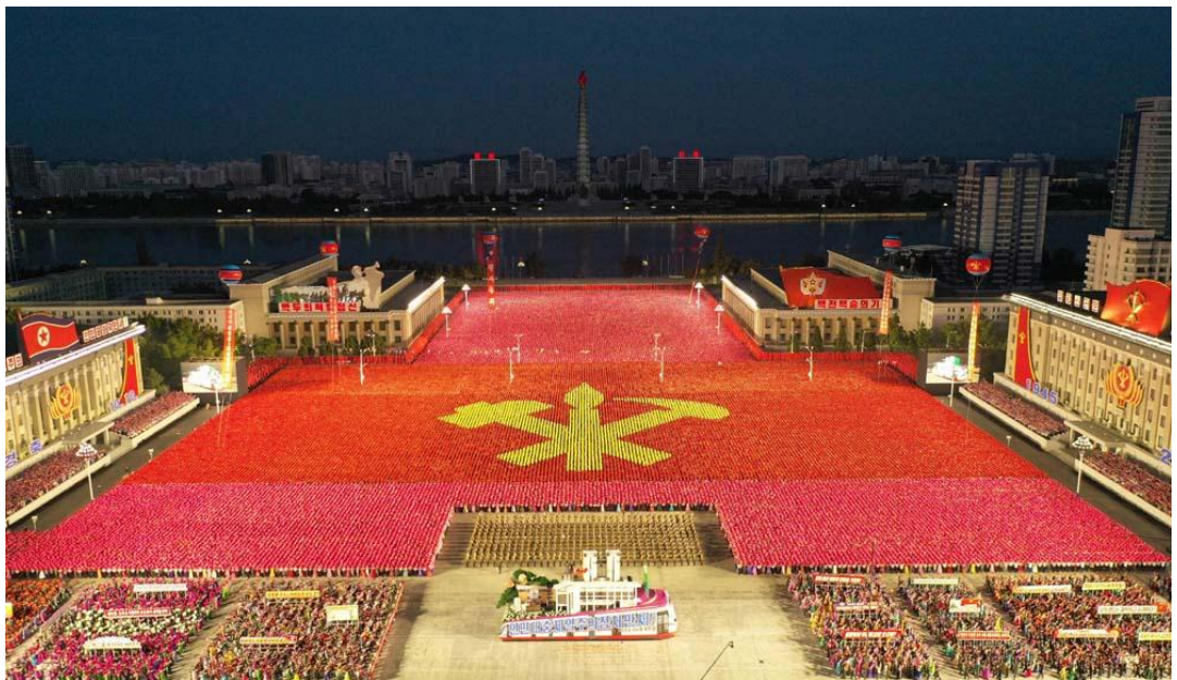
Public procession demonstrating single-minded unity of the Korean people behind the Workers' Party of Korea