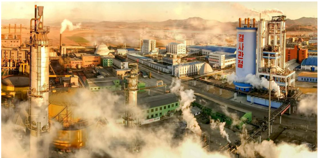
Namhung Youth Chemical Complex, a large chemical base, seething with increased production