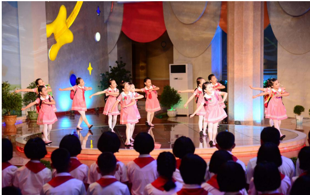
A dance reflects the country's benevolence of supplying school uniforms and other school things to schoolchildren at its expense.