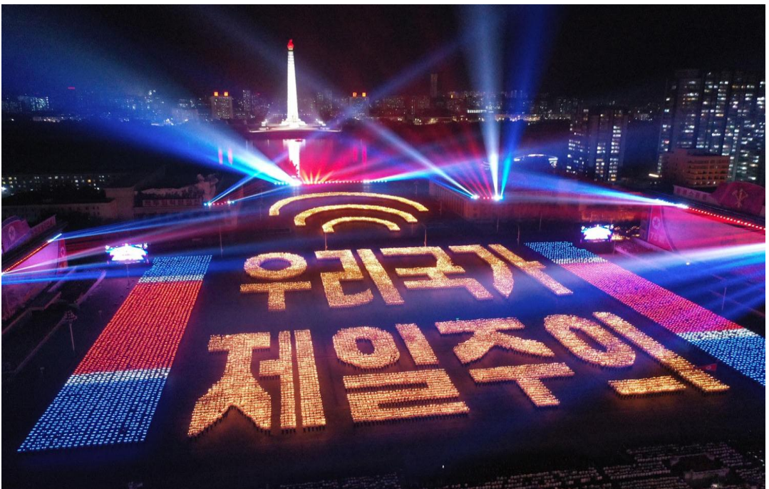
Our-Nation-First Principle portrayed on the square