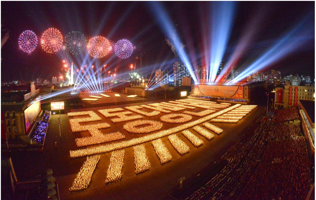
Long Live the Workers' Party! reflects the young people's gratitude to the Party for glorifying their life.