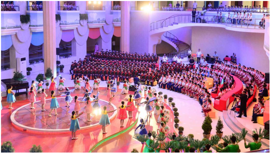
Well-known Mangyongdae Schoolchildren's Palace, venue of the concert