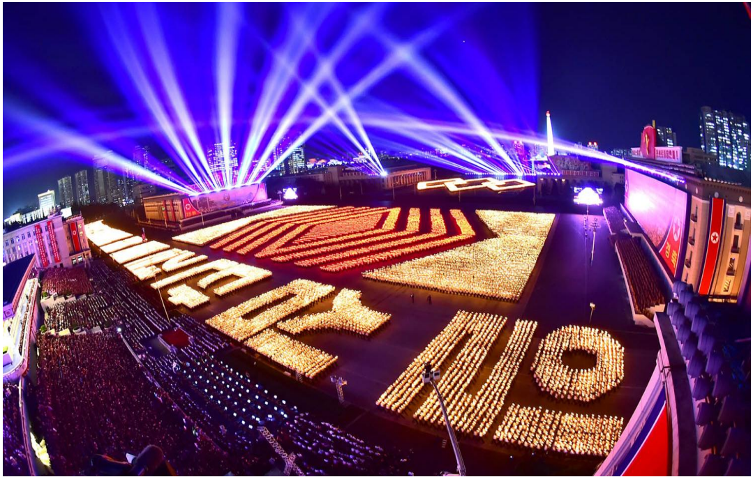
A formation portrays the word Single-Hearted Unity .