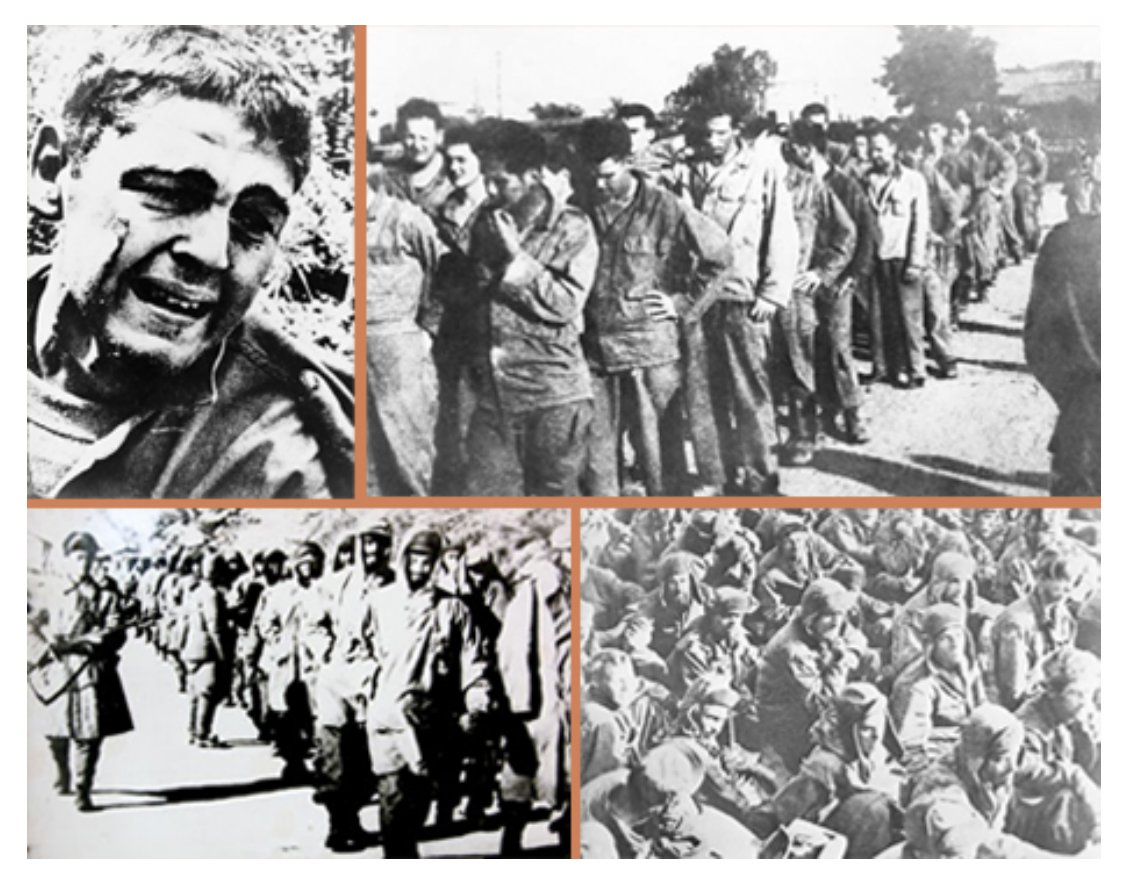
US prisoners of war