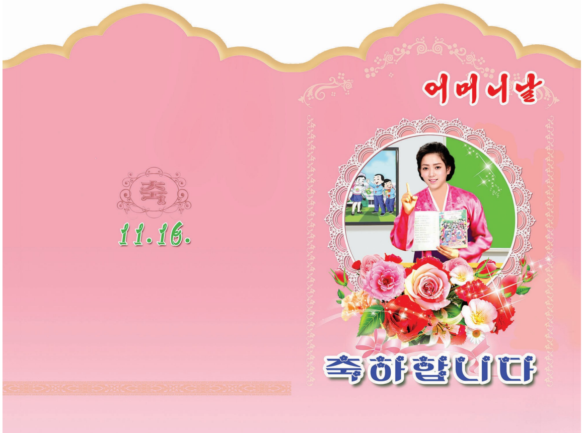
Congratulatory cards published on the occasion of Mother's Day