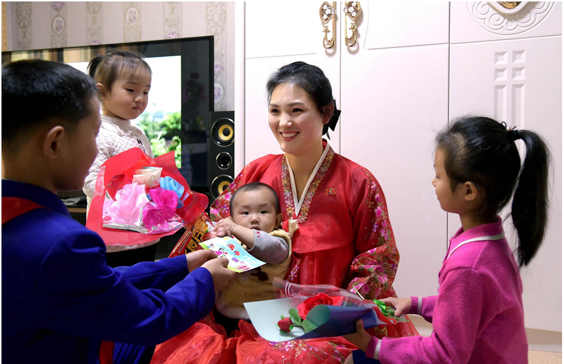
A woman happy with her children presenting a congratulatory card and bouquets on Mother's Day

In the DPRK congratulatory cards are published on the occasion of Mother's Day (November 16). The cards reflect the respect and love for mothers who bring up their children to be pillars of the country and do a lot of work for society and the collective.