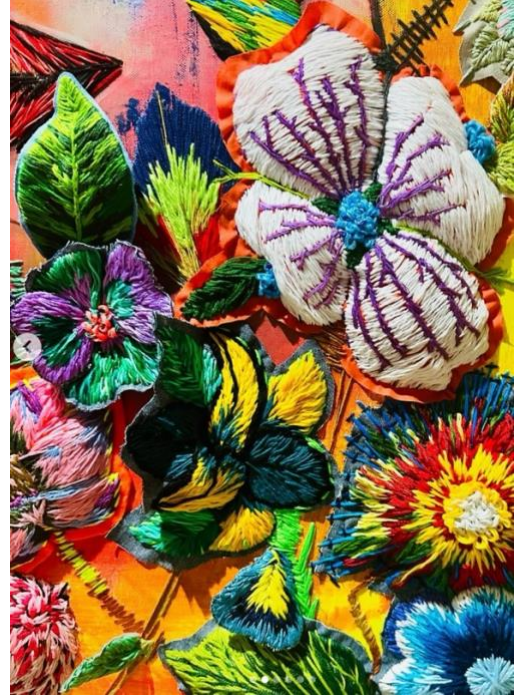
Detail by Yael Mizrahi