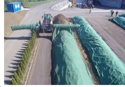
Windrow Pile Composting