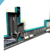
Waste To Energy