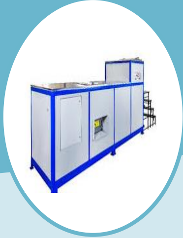
Organic Waste Composter