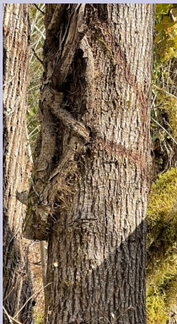
Ivy being pulled off a tree