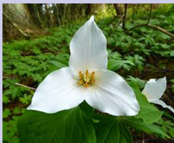
Common Western Trillium