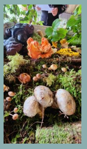
GH Coastal Shores & Spores at Schafer State Park