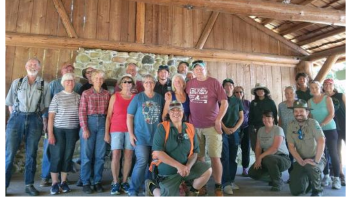
FOSLS Volunteers setting up for the Schafer Centennial