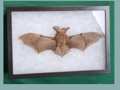
BATS by the Woodland Park Zoo