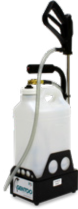
Gentoo Cordless Sprayer