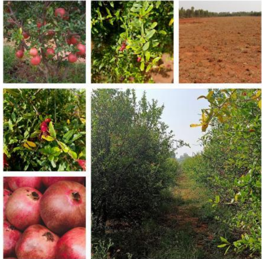
*ACTUAL SITE IMAGES