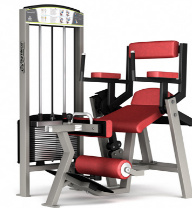
Lumbar/Abdominal Art.nr: 365B

Length: 100 cm Width: 90 cm Height: 160 cm