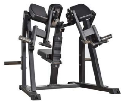
Iso Lateral Biceps Art.nr: 050

Length: 104 cm Width: 120 cm Height: 103 cm