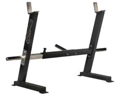
Curl Bar Rack Art.nr: 150

Length: 70 cm Width: 95 cm Height: 127 cm