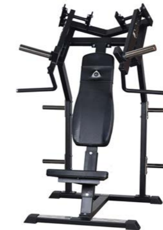
Lateral Incline Press Art.nr: 020

Length: 110 cm Width: 113 cm Height: 177 cm