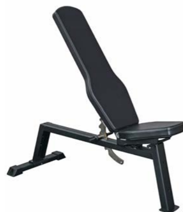
Adjustable Bench Art.nr: 190

Length: 125 cm Width: 45 cm Height: 43,5 cm