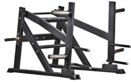
Deadlift / Squat machine Art.nr: 083

Length: 140 cm Width: 130 cm Height: 82 cm