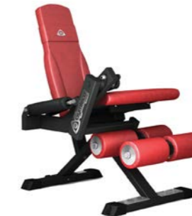
Leg extension/legcurl Art.nr: 949

Length: 173 cm Width: 86 cm Height: 107 cm Weight: 67 kg