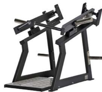
Upright Row Art.nr: 032

Length: 120 cm Width: 140 cm Height: 94 cm