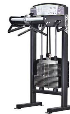
Forearm, 3 exercises Art.nr: 356

Length: 61 cm Width: 75 cm Height: 136 cm