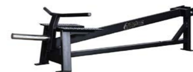
T-bar Row Art.nr: 115

Length: 206 cm Width: 86 cm Height: 47 cm