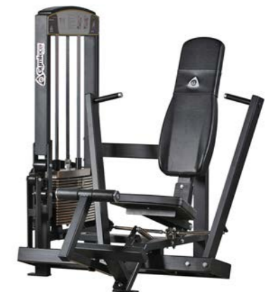
Chest Press, Seated Art.nr: 321

Length: 139 cm Width: 137 cm Height: 149 cm