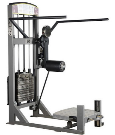
Multihip Art.nr: 369

Length: 115 cm Width: 110 cm Height: 160 cm