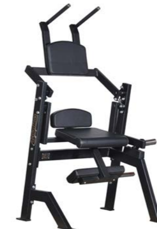
Abdominal Seated Art.nr: 070

Length: 83 cm Width: 114 cm Height: 168 cm