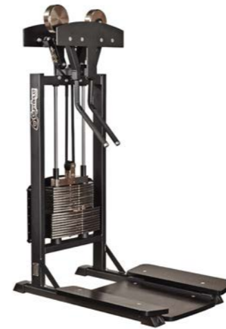
Standing Shoulder Rotation Art.nr: 334

Length: 112 cm Width: 82 cm Height: 167 cm