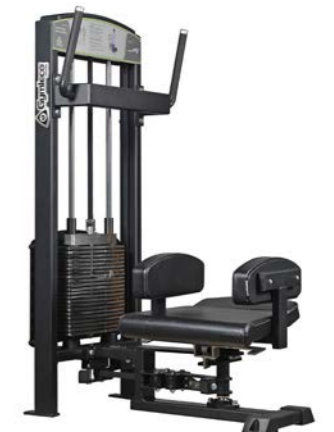
Abdominal, Kneestanding Art.nr: 376

Length: 95 cm Width: 65 cm Height: 125 cm