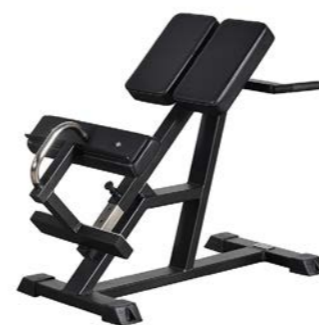
Back Raise, 45 degrees Art.nr: 162F45

Length: 102 cm Width: 60 cm Height: 117 cm