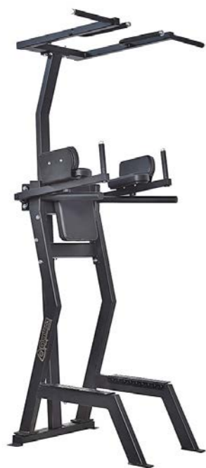
Leglift with chins and dips Art.nr: 179

Length: 70 cm Width: 91 cm Height: 227 cm