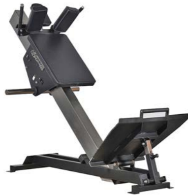
Hack Lift 45° Art.nr: 244

Length: 195 cm Width: 80 cm Height: 145 cm