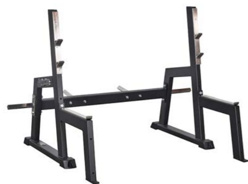
Stand for Decline Bench Art.nr: 154

Length: 125 cm Width: 170 cm Height: 110 cm