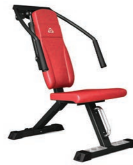
Pulldown/shoulderpress Art.nr: 911

Length: 113 cm Width: 69 cm Height: 115 cm Weight: 45 kg