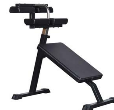
Abdominal Bench Plus Art.nr: 171

Length: 102 cm Width: 58 cm Height: 105 cm