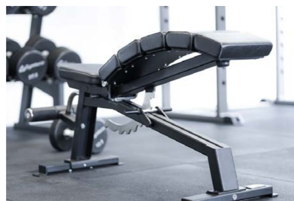
100 - Series Basic Equipment 17-24