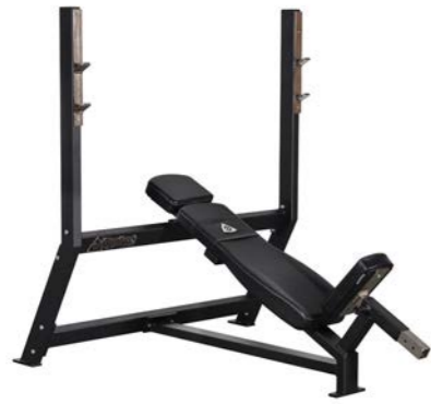
Incline Bench Press Art.nr: 120

Length: 125 cm Width: 150 cm Height: 124 cm