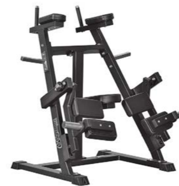
Leg Curl Standing Art.nr: 042

Length: 96 cm Width: 117 cm Height: 123 cm