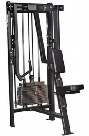
Iso Lateral Low Row Art.nr: 312

Length: 121 cm Width: 81 cm Height: 166 cm