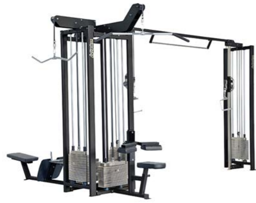
Multigym 4 Station With Cable Cross Art.nr: 215K

Length: 410 cm Width: 323 cm Height: 243 cm