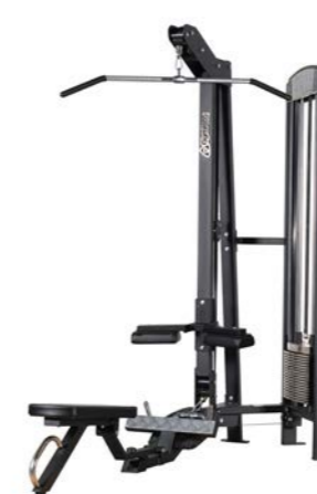
Lateral Pulldown/Seated Row Art.nr: 214

Length: 112 cm Width: 132 - 213 cm Height: 225 cm