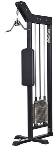
Lateral Triceps Pushdown Art.nr: 251

Cable Cross: 60 kg x2 Row: 100 kg x2 Pulldown: 100 kg x2 Triceps: 60 kg x2