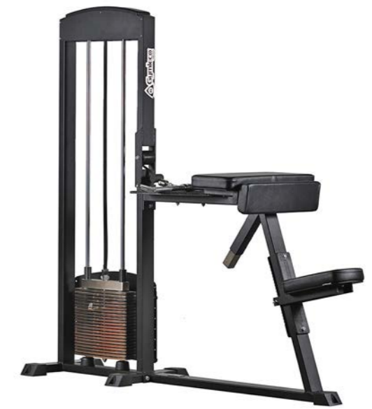
Lateral Biceps/Triceps Art.nr: 255

Length: 192 cm Width: 60 cm Height: 180 cm