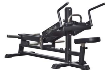
Dip Press Art.nr: 055

Length: 190 cm Width: 70 cm Height: 90 cm