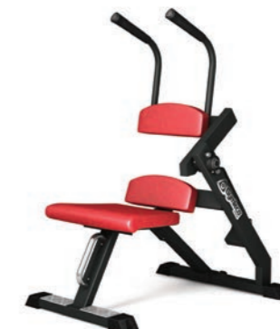
Lumbar/Abdominal Art.nr: 965

Length: 133 cm Width: 71 cm Height: 113 cm Weight: 56 kg