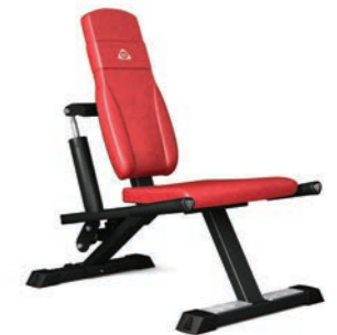
Shoulder Pull/Dips Art.nr: 954

Length: 105 cm Width: 77 cm Height: 117 cm Weight: 63 kg