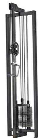
Half of a Cable Cross Art.nr: 225B

Length: 48 cm Width: 58 cm Height: 225 cm