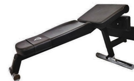
Decline Bench Adjustable Art.nr: 194R

Length: 148 cm Width: 60 cm Height: 60 cm