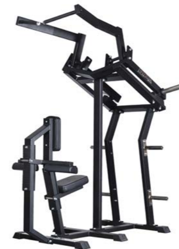
Iso Lateral High Row Art.nr: 013

Length: 160 cm Width: 110 cm Height: 198 cm