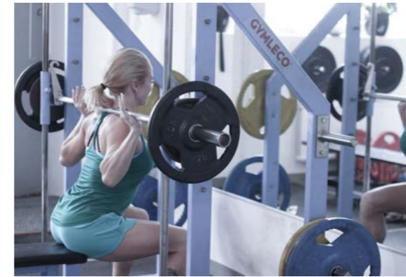
200 - Series Multigym and Cable Stations 25-30