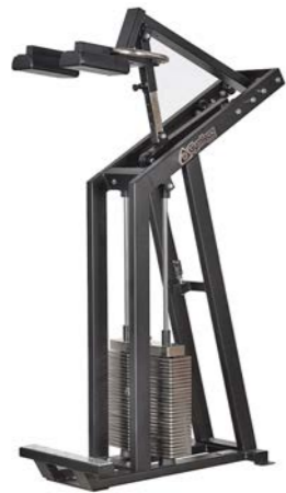
Calf Press, Standing Art.nr: 347

Length: 130 cm Width: 60 cm Height: 180 cm