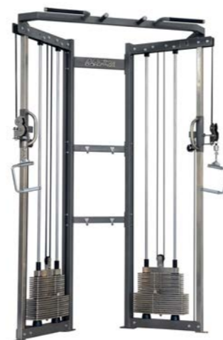
Dual Pulley, Adjustable Art.nr: 226

Length: 151 cm Width: 77 cm Height: 228 cm