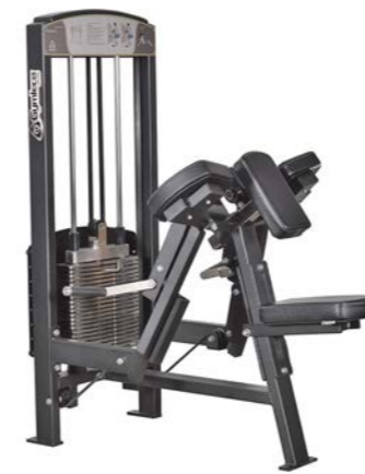
Biceps Curl Art.nr: 350

Length: 100 cm Width: 95 cm Height: 153 cm