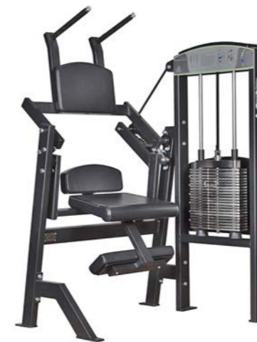
Abdominal, Seated Art.nr: 370

Length: 170 cm Width: 101 cm Height: 104 cm