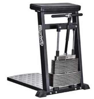
Forearm Curl Art.nr: 357

Length: 93 cm Width: 78 cm Height: 103 cm