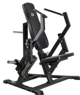
Iso Lateral Triceps Art.nr: 051

Length: 124 cm Width: 102 cm Height: 136 cm