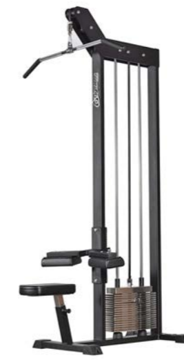
Lateral Pulldown Art.nr: 211

Length: 124 cm Width: 52 cm Height: 227,5 cm