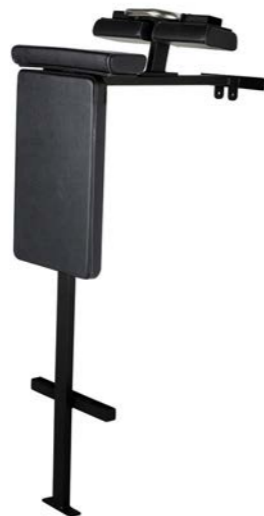
Brutal Bench Art.nr: 174

Length: 75 cm Width: 50 cm Height: 160 cm