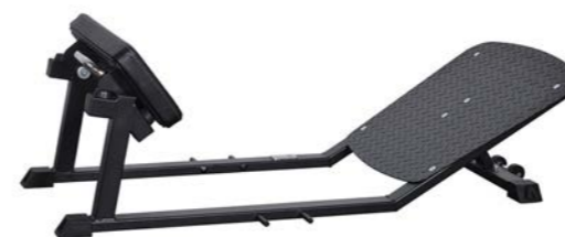
Hip Thrust bench Art.nr: 166

Length: 150 cm Width: 73 cm Height: 50 cm