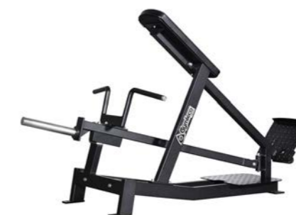
Incline T-bar row with Breast Cushion Art.nr: 116

Length: 219 cm Width: 92 cm Height: 109 cm