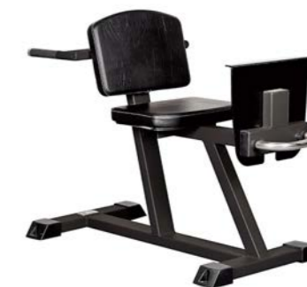
Back Raise, Knee standing Art.nr: 163

Length: 105 cm Width: 59 cm Height: 79 cm