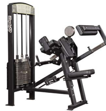
Biceps/Triceps Art.nr: 355

Length: 129 cm Width: 84 cm Height: 149 cm