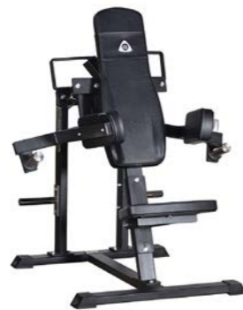
Shoulder Rotation Art.nr: 031

Length: 105 cm Width: 114 cm Height: 135 cm