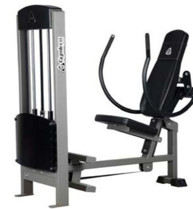
Triceps Extension Art.nr: 351

Length: 130 cm Width: 60 cm Height: 140 cm