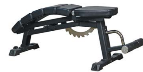
Decline Bench Curved, Adjustable -15+85 degree Art.nr: 193S

Length: 133 cm Width: 45 cm Height: 42 - 115 cm