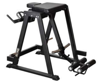
Reverse Hyper Pendulum Art.nr: 062

Length: 137 cm Width: 133,5 cm Height: 111 cm