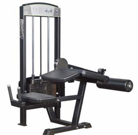
Leg Curl Lying Art.nr: 342

Length: 170 cm Width: 97 cm Height: 149 cm