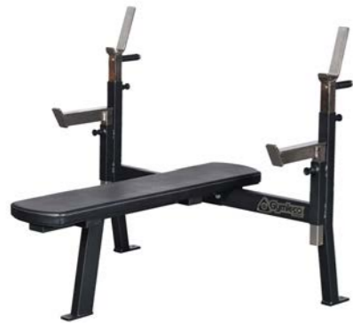
Bench Press with Safety Bar Support Art.nr: 122RS

Length: 125 cm Width: 124 cm Height: 104 cm