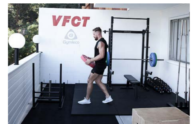
Gymleco Worldwide, Dealers 45-48