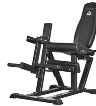
Leg Extension Art.nr: 040

Weight: 125 kg Start weight in the handles: 21 kg