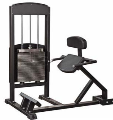
Calf Press, 45 Degree Art.nr: 348

Length: 150 cm Width: 86 cm Height: 146 cm