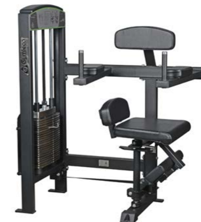
Waist Rotation Art.nr: 375

Length: 120 cm Width: 75 cm Height: 139 cm