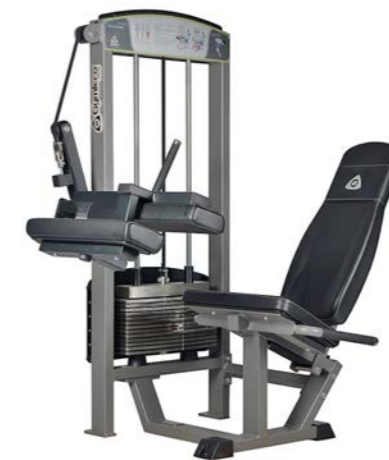
Leg Curl Seated Art.nr: 341

Length: 100 cm Width: 136 cm Height: 148 cm