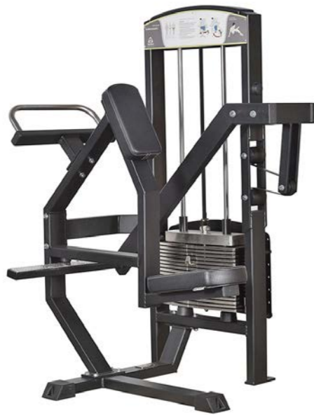
Gluteus, One Leg kick Art.nr: 360

Length: 86 cm Width: 75 cm Height: 136 cm