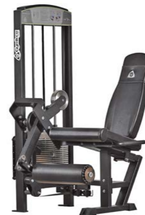
Leg Extension Rehab Art.nr: 340R

Length: 95 cm Width: 99 cm Height: 162 cm