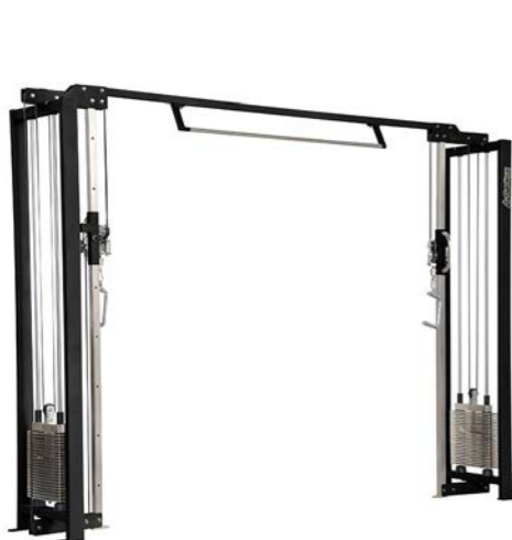
Cable Crossover Multigym Art.nr: 225

Length: 308 cm Width: 58 cm Height: 225 cm