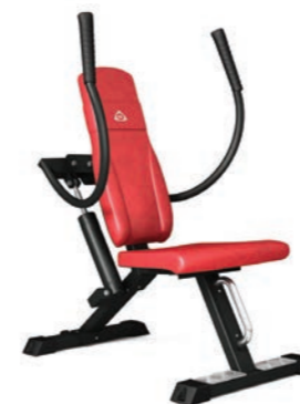
Biceps / Triceps Art.nr: 955

Length: 113 cm Width: 69 cm Height: 115 cm Weight: 45 kg