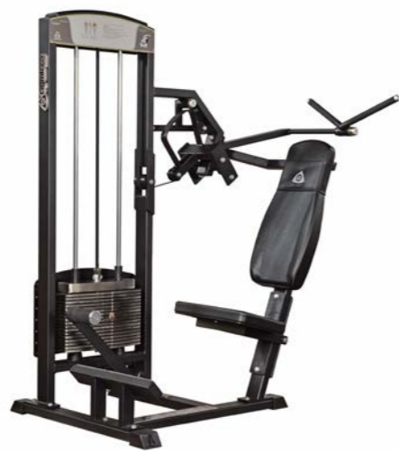
Pullover with handles Art.nr: 324

Length: 143 cm Width: 89 cm Height: 172 cm