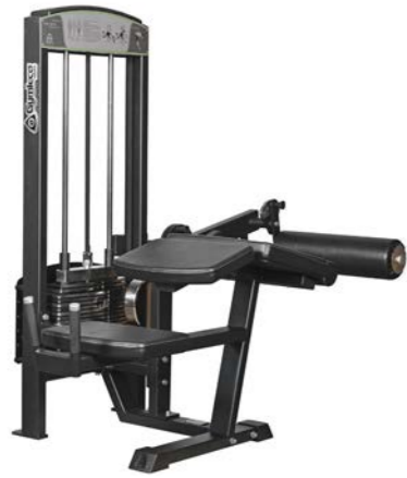
Leg Curl Lying, Rehab Art.nr: 342R

Length: 170 cm Width: 97 cm Height: 149 cm