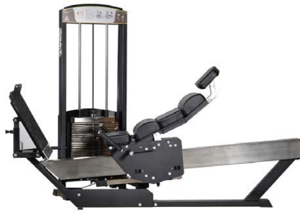
Leg Press, Seated Art.nr: 343

Length: 221 cm Width: 116 cm Height: 162 cm