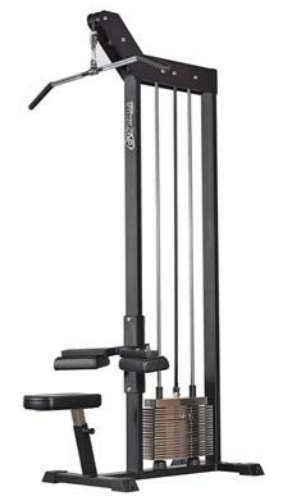
Lateral Pulldown Rehab Art.nr: 211R

Length: 124 cm Width: 52 cm Height: 227,5 cm