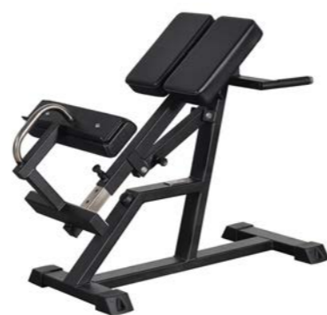
Back Raise, Adjustable Art.nr: 162

Length: 102 cm Width: 60 cm Height: 117 cm