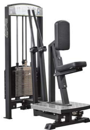
Rear Deltoid Shoulder Art.nr: 333

Length: 147 cm Width: 70 - 174 cm Height: 149 cm