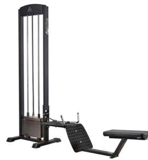
Seated Row Art.nr: 210

All the machines have black frame as standard color and black or red cushions. Read more about each product on our website: www.gymleco.com