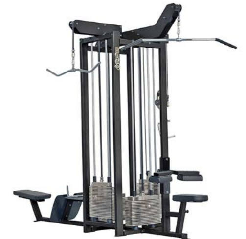
Four Station Multigym Art.nr: 215

Length: 323 cm Width: 58 cm Height: 243 cm Weight N.W: 545 kg Cable Cross: 60 kg Row: 100 kg Pulldown: 100 kg Triceps: 60 kg