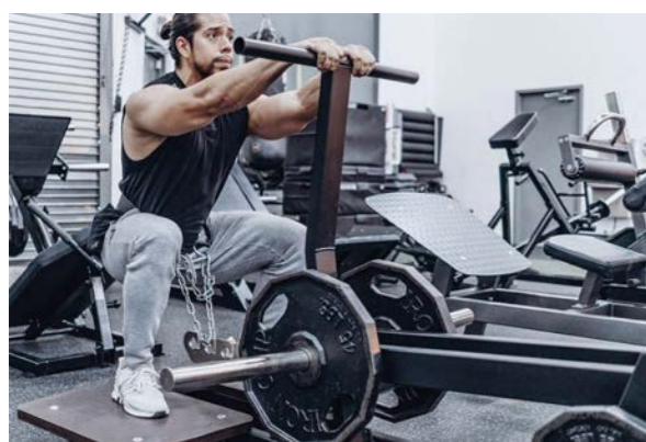
010 - Series Plate Loaded Machines 11-16