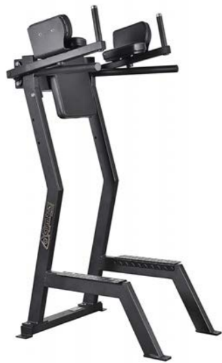
Leglift with dips Art.nr: 173

Length: 70 cm Width: 91 cm Height: 143 cm