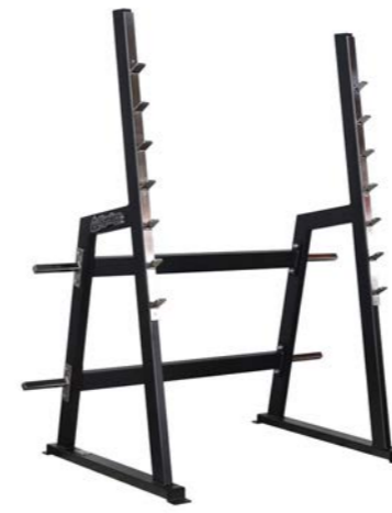
Squat Rack Art.nr: 148

Length: 162 cm Width: 100 cm Height: 186 cm