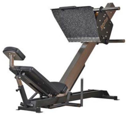
Leg Press Art.nr: 243

Length: 218 cm Width: 78 cm Height: 142 cm