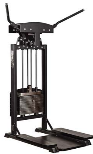
Standing Wide Chest Art.nr: 326

Length: 112 cm Width: 135 cm Height: 177 cm