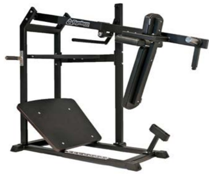
Pendulum Squat Art.nr: 045

Length: 191 cm Width: 87-110 cm Height: 163 cm