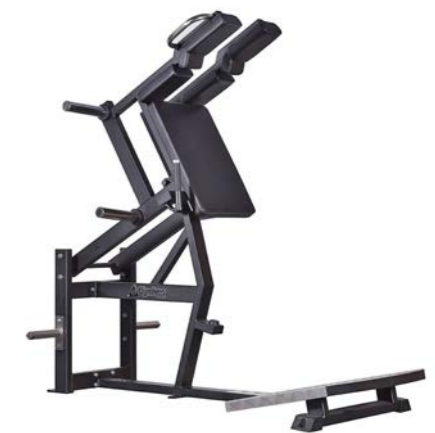
Squat / Hack Squat Art.nr: 044

Length: 177 cm Width: 85 cm Height: 156 cm