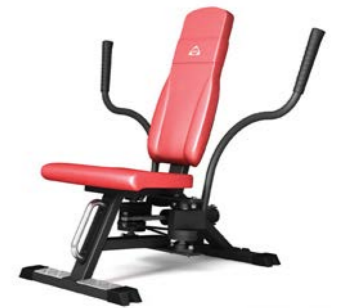
Pec Dec/Shoulders Art.nr: 935

Length: 94 cm Width: 57 cm Height: 104 cm Weight: 43 kg