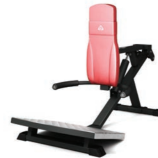
Hacksquat Art.nr: 944

Length: 94 cm Width: 146 cm Height: 104 cm Weight: 50 kg