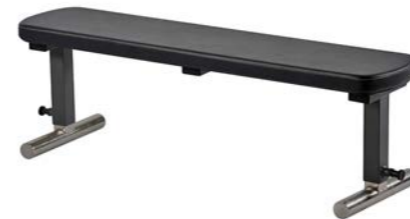
Flat Bench Adjustable Art.nr: 192

Length: 122 cm Width: 35,5 cm Height: 56 cm