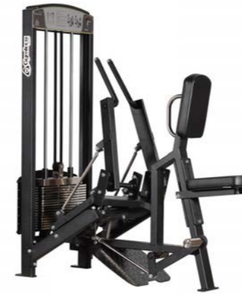
Row, Seated Art.nr: 310

Length: 120 cm Width: 60 cm Height: 162 cm