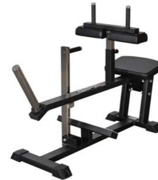
Calf Press, Seated Art.nr: 145

Length: 140 cm Width: 60 cm Height: 85 cm