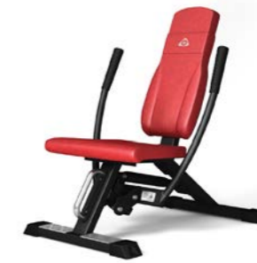
Chest press and back Art.nr: 921

Length: 113 cm Width: 69 cm Height: 115 cm Weight: 45 kg