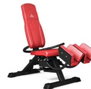
Adductor/Abductor Art.nr: 964

Length: 101 cm Width: 76 cm Height: 124 cm Weight: 45 kg