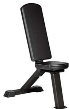
Fixed Bench 70 degrees Art.nr: 153

Length: 76 cm Width: 40 cm Height: 92 cm