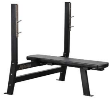
Bench Press with Fixed Bar Holder Art.nr: 122F

Length: 123 cm Width: 123 cm Height: 124 cm