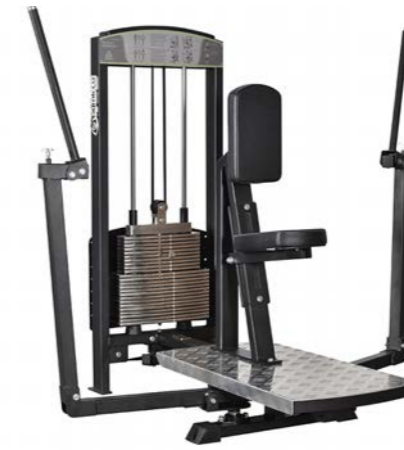
Rear Deltoid/Pec Deck Art.nr: 335

Length: 147 cm Width: 70 - 174 cm Height: 149 cm