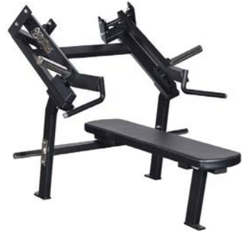
Iso Lateral Bench Press Art.nr: 022

Length: 163 cm Width: 133 cm Height: 114 cm