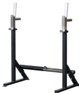
Bench Press and Squat Rack Art.nr: 142

Length: 128 cm Width: 69 cm Height: 75 - 163 cm