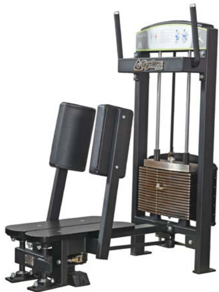
Standing Gluteus Abductor Art.nr: 362

Length: 110 cm Width: 65 cm Height: 142 cm