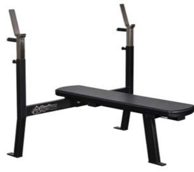
Bench Press Stand with Adjustable Bar Holders Art.nr: 122R

Length: 125 cm Width: 123 cm Height: 104 cm