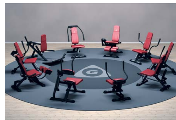
Circuit Training 39-40