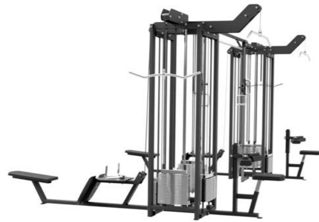
Multigym 8 Station With Cable Cross Art.nr: 215DK

Cable Cross: 60 kg x 2 Row: 100 kg Pulldown: 100 kg Triceps: 60 kg