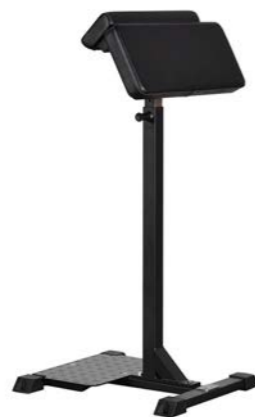
Scott Curl Bench, standing Art.nr: 152