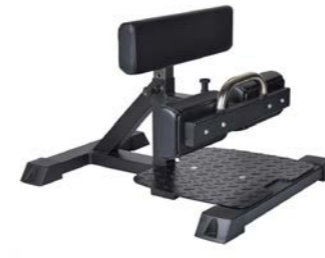
Sissy Squat Art.nr: 144

Length: 77 cm Width: 64 cm Height: 57 cm