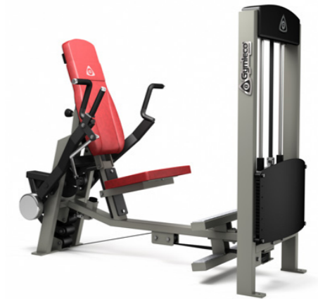
Dips press/Shoulder Pull Art.nr: 354

Length: 174 cm Width: 85 cm Height: 136 cm