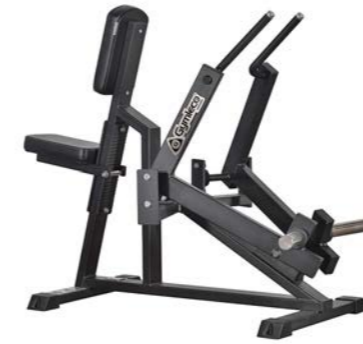
Seated Row Art.nr: 010

All the machines have black frames as standard color and black or red cushions. Read more about each product on our website: www.gymleco.com