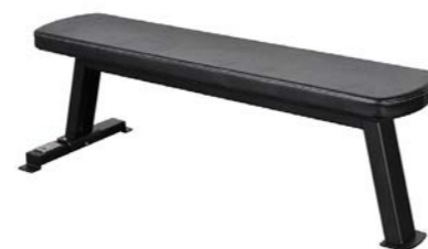
Flat Bench Fixed Art.nr: 191

Length: 124 cm Width: 45 cm Height: 43,5 cm