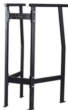
Dip Press stand Art.nr: 155

Length: 80 cm Width: 80 cm Height: 140 cm