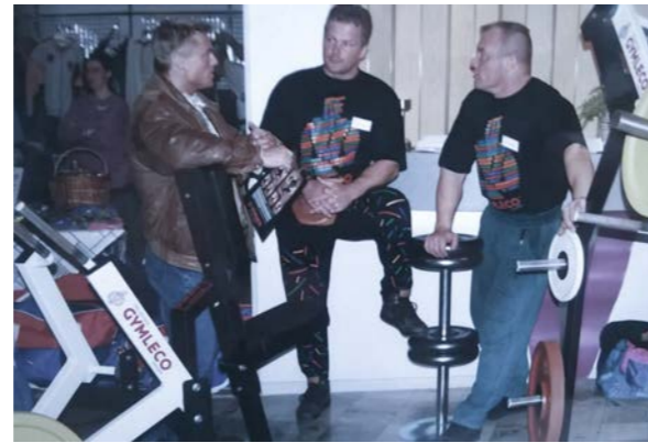
About Gymleco 5-6