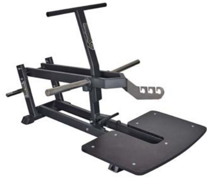
Belt Squat machine Art.nr: 082

Length: 170 cm Width: 100 cm Height: 115 cm