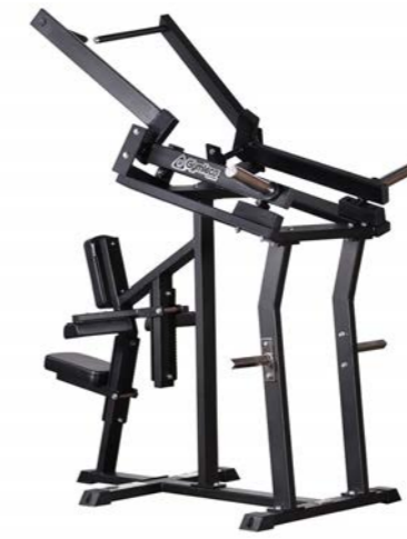
Iso Lateral Pulldown Art.nr: 011

Length: 156 cm Width: 104 cm Height: 199 cm