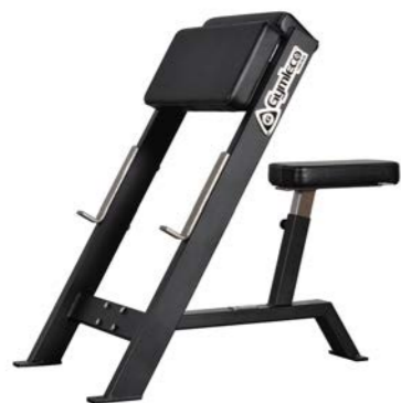
Scott Curl Bench, seated Art.nr: 151

Length: 101 cm Width: 70 cm Height: 95 cm