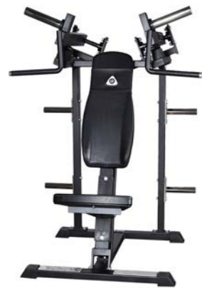
Shoulder Press Art.nr: 030

Length: 130 cm Width: 114 cm Height: 149 cm