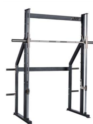
Smith Machine Art.nr: 280

Length: 207 cm Width: 90 cm Height: 208 cm