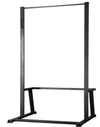
Chins Rack, Standing Art.nr: 111

Length: 126 cm Width: 150 cm Height: 240 cm