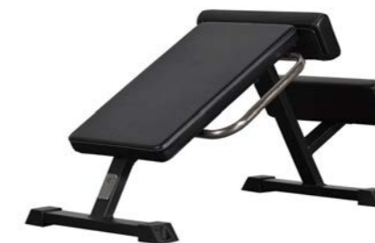
Abdominal Bench (Romain Chair) Art.nr: 170

Length: 102 cm Width: 58 cm Height: 57 cm