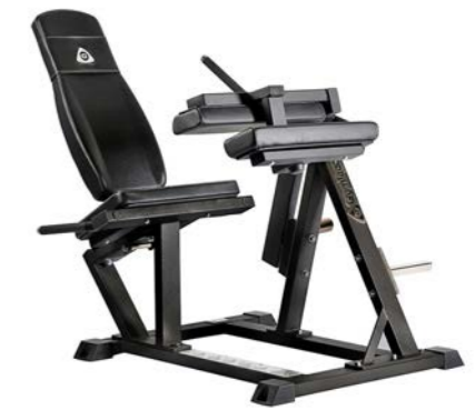
Leg Curl Seated Art.nr: 041

Length: 125 cm Width: 100 cm Height: 110 cm