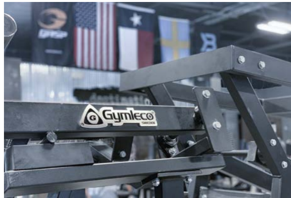
Machine Details 7-8