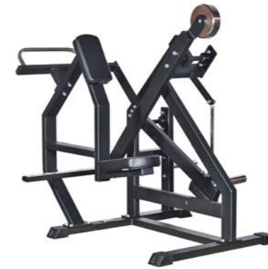
Gluteus, One Leg kick Art.nr: 060

Length: 126 cm Width: 119 cm Height: 133 cm