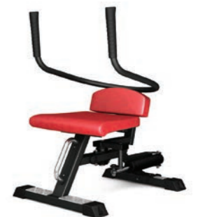
Waist Trainer Art.nr: 975

Length: 101 cm Width: 83 cm Height: 134 cm Weight: 46 kg