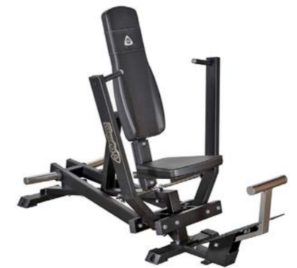
Lateral Wide Chest Art.nr: 021

Length: 180 cm Width: 104 cm Height: 137 cm