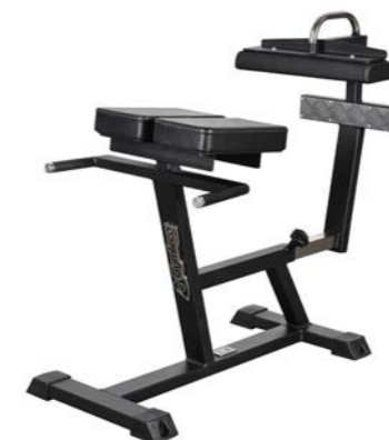
Back Raise, 90 degrees Art.nr: 162F90

Length: 102 cm Width: 60 cm Height: 104 cm