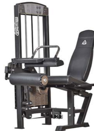
Leg Extension/Leg Curl Art.nr: 349

Length: 115 cm Width: 99 cm Height: 163 cm