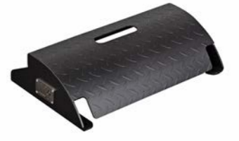
Calf Raise Block Art.nr: 146

Length: 51 cm Width: 31 cm Height: 13 cm