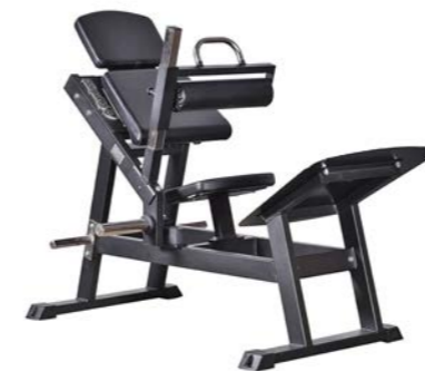
Hip Thrust machine Art.nr: 066

Length: 160 cm Width: 96 cm Height: 124 cm