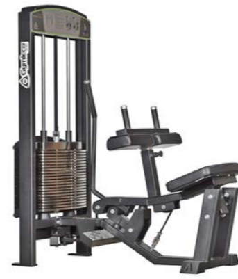
Calf Press, Seated Art.nr: 345

Length: 120 cm Width: 60 cm Height: 140 cm