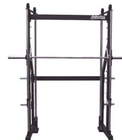
Smith Machine with counterweight Art.nr: 281

Length: 207 cm Width: 90 cm Height: 208 cm