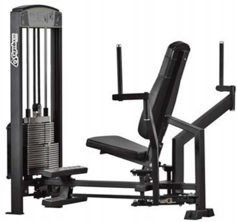
Pec Deck, Seated Art.nr: 323

Length: 146 cm Width: 171 cm Height: 150 cm