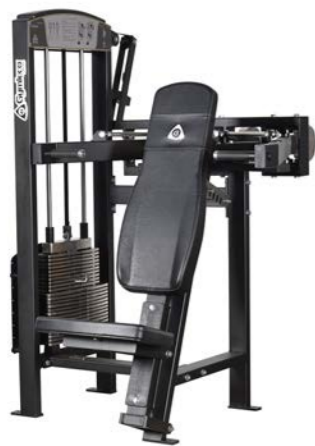
Shoulder Press Art.nr: 330

Length: 155 cm Width: 125 cm Height: 165 cm