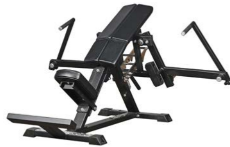
Pec Deck, Individual arms Art.nr: 023

Length: 155 cm Width: 164 cm Height: 93 cm