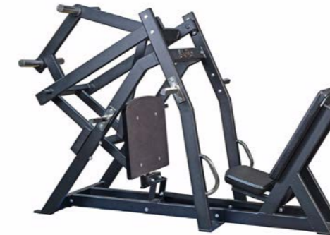
Leg Press Art.nr: 043

Length: 226 cm Width: 78 cm Height: 180 cm