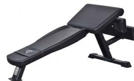
Decline Bench Fixed Art.nr: 194

Length: 148 cm Width: 60 cm Height: 60 cm