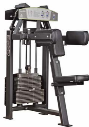
Shoulder Rotation, Seated Art.nr: 331

Length: 87 cm Width: 75 cm Height: 135 cm