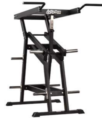
Viking Press Art.nr: 038

Length: 121 cm Width: 98 cm Height: 154 cm