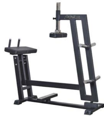
Donkey Raise Art.nr: 046

Length: 146 cm Width: 65 cm Height: 156 cm