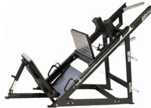
Leg Press/Hack Lift Combination Art.nr: 245

Length: 230 cm Width: 81 cm Height: 145 cm