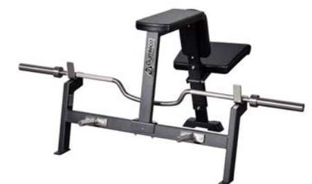
Seal Rowing Bench Art.nr: 117

Length: 147 cm Width: 122,5 cm Height: 91 cm