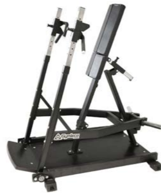
Chest Press, Standing Art.nr: 028

Length: 152 cm Width: 100 cm Height: 163 cm