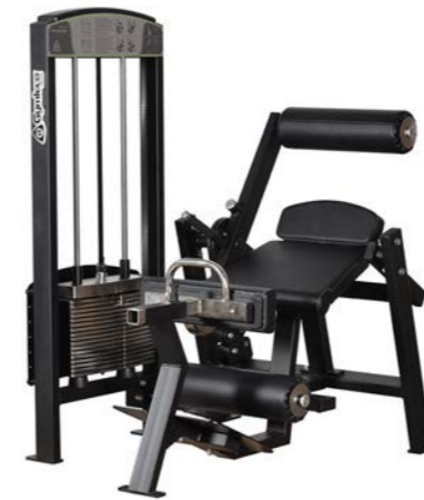
Lumbar/Abdominal Art.nr: 365A

Length: 100 cm Width: 90 cm Height: 160 cm