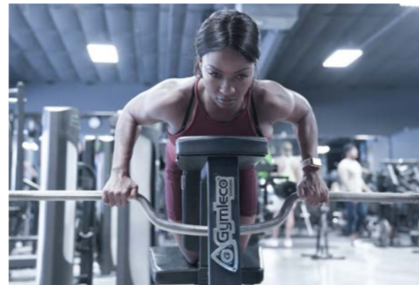
Assistance and Warranty 9-10