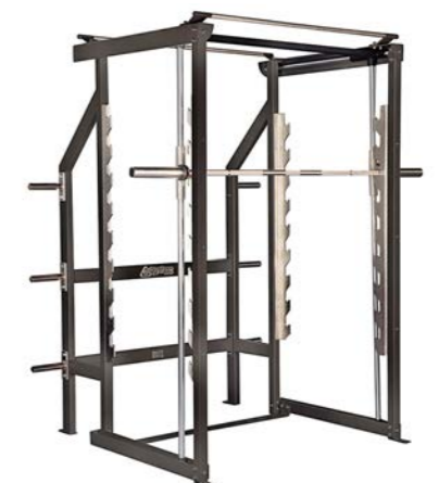
Multi Smith Machine Art.nr: 285

Length: 207 cm Width: 149 cm Height: 220 cm