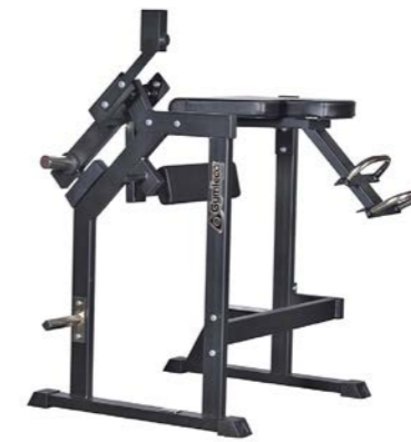
Reverse Hyper Art.nr: 061

Length: 116 cm Width: 140 cm Height: 144 cm