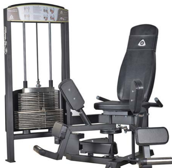
Adductor/Abductor Art.nr: 364

Length: 130 cm Width: 86 cm Height: 137 cm