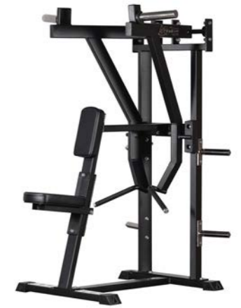
Iso Lateral Low Row Art.nr: 012

Length: 120 cm Width: 112 cm Height: 174 cm