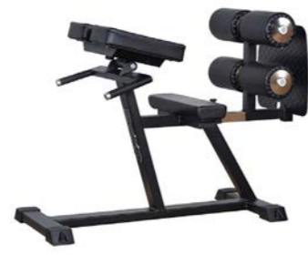
Glute Ham Raise Art.nr: 141

Length: 110 cm Width: 60 cm Height: 90 cm