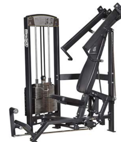
Chest Press, Incline Art.nr: 320

Length: 156 cm Width: 122 cm Height: 173 cm