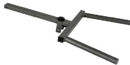
Dip for Brutal Bench Art.nr: 174-1