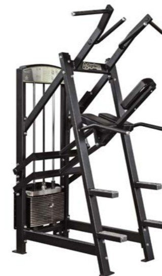
Chins and dips Art.nr: 314

Length: 126 cm Width: 120 cm Height: 200 cm