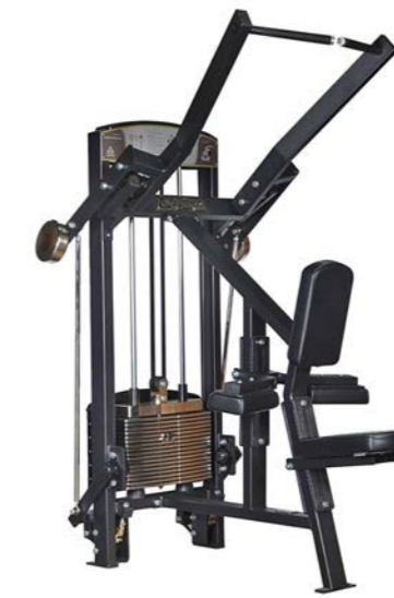
Lateral Pulldown Art.nr: 311

Length: 126 cm Width: 95 cm Height: 186 cm