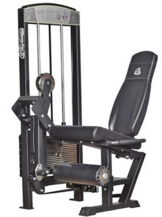
Leg Extension Art.nr: 340

Length: 95 cm Width: 99 cm Height: 162 cm