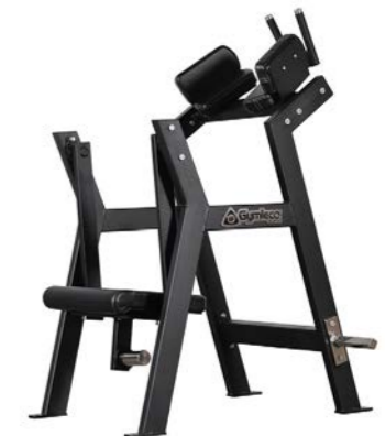
Ab Roll up Art.nr: 072

Length: 100 cm Width: 96 cm Height: 140 cm