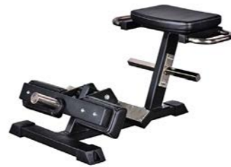
Tibia Dorsi Flexion Art.nr: 047

Length: 102 cm Width: 60 cm Height: 51 cm