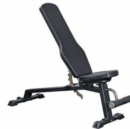
Decline Bench, Adjustable Art.nr: 193

Length: 133 cm Width: 45 cm Height: 42 - 115 cm