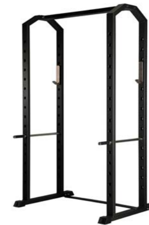
Power Rack Art.nr: 149

Length: 122 cm Width: 90 cm Height: 205 cm