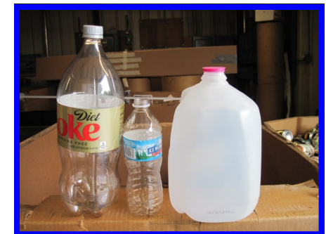
PLASTIC #1 & #2