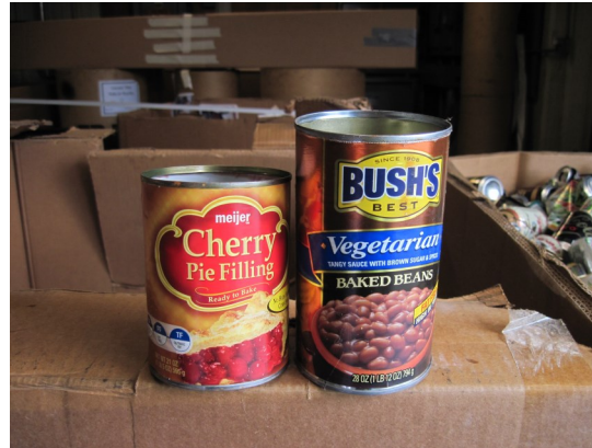
TIN FOOD CANS