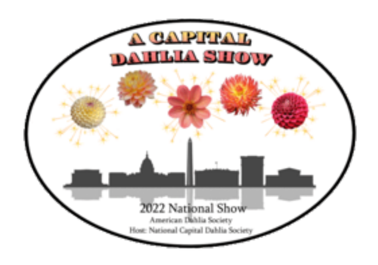
September 22-25, 2022