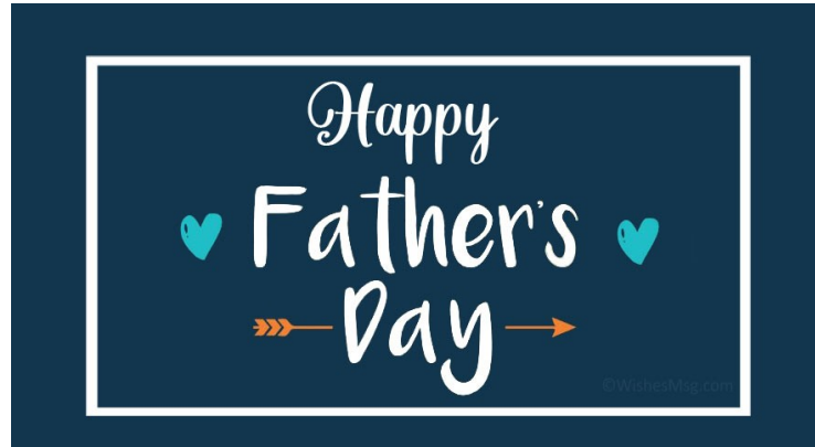
June 19th, 2022

All ladies, young and not so young, are welcome to sing for our men on Sunday, June 19th. A rehearsal will be held before the service at 9:00. Let's have a good turn-out just as the men did for us last month!