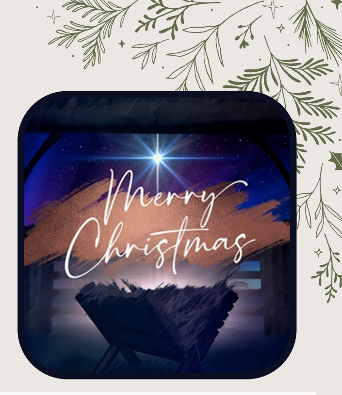
December 25, 2023