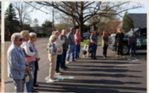
Ground Breaking Ceremony