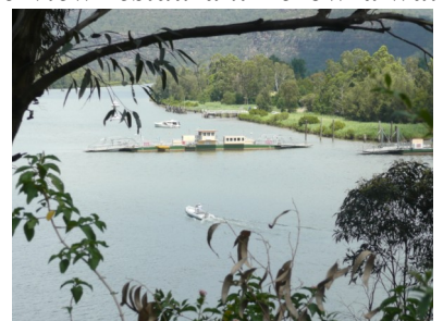
Wisemans Ferry Hawkesbury river

Time Out and Chill Pill headed downstream to our next rendezvous point – Royal Prince Alfred Yacht Club in Newport (Pittwater). We were to spend two nights here with showers! It was great to step foot on solid ground and we all enjoyed a meal at the Newport Arms hotel. The Time Out crew set out for a day in Sydney, traveling by bus the next day. Chill Pill and Zero Tolerance decided to explore around Lion Island and headed towards Brisbane Waters. We found a protected beach surrounded by national park, anchored here for a swim ashore and fishing. Zero Tolerance and Chill Pill went to Refuge Bay for lunch and to find the well known water falls. Much to our surprise the water fall was a trickle set back from a small but popular beach. There were many boats, all shapes and sizes, moored. Fortunately there were many wet moorings available. Returning back to the Prince Alfred Yacht Club, we had tea at Royal Motor Yacht Club much to the delight of Zero Tolerance boys of a pool and playground. Had we arrived a little earlier, they could have enjoyed swimming at the pool.