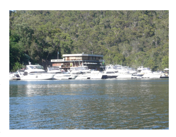
Waterview restaurant Berowra waters

The next day all three boats headed upstream, approximately 20km to Wiseman's ferry, stopping at Spencer for supplies. The vistas changed from open waters of the Hawkesbury to the steep cliffs and dense bush land of the river upstream. The boat craft changed from cruising/sailing boats to ski and house boats. Public moorings were difficult to come by - a common experience in these waters. found private mooring each and spent the night. The challenge for this area was managing the strong tidal flow. Historically, Wiseman ferry was the only way north of Sydney by road. Zero Tolerance crew took a ride on the ferry and explored the remains of a bridge the convicts built.