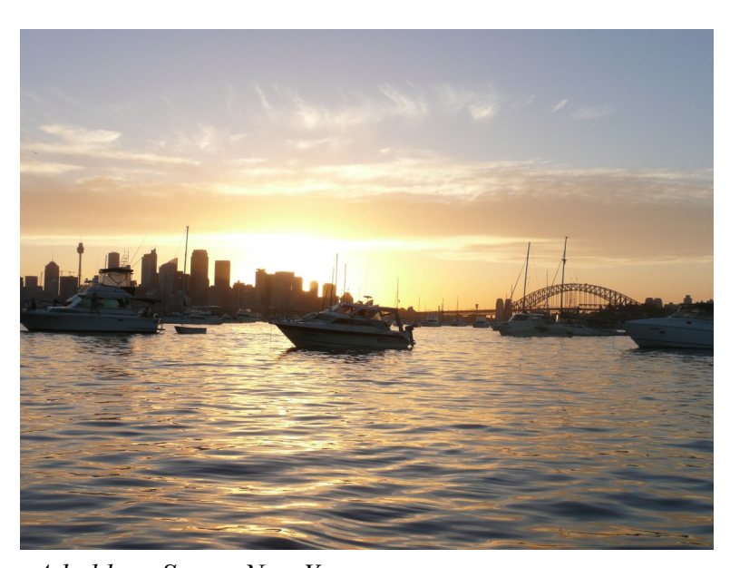
Athol bay, Sunset New Years eve

The trip back to the Hawkesbury was uneventful. All three boats joined up at Akuna Bay where fuel was taken on and clothes washed. The very hot conditions meant our clothes dried very quickly.