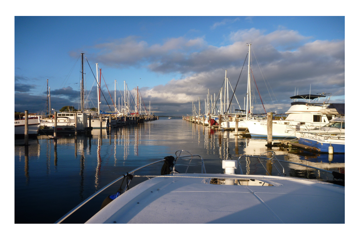
Leaving Yaringa Boat Harbour