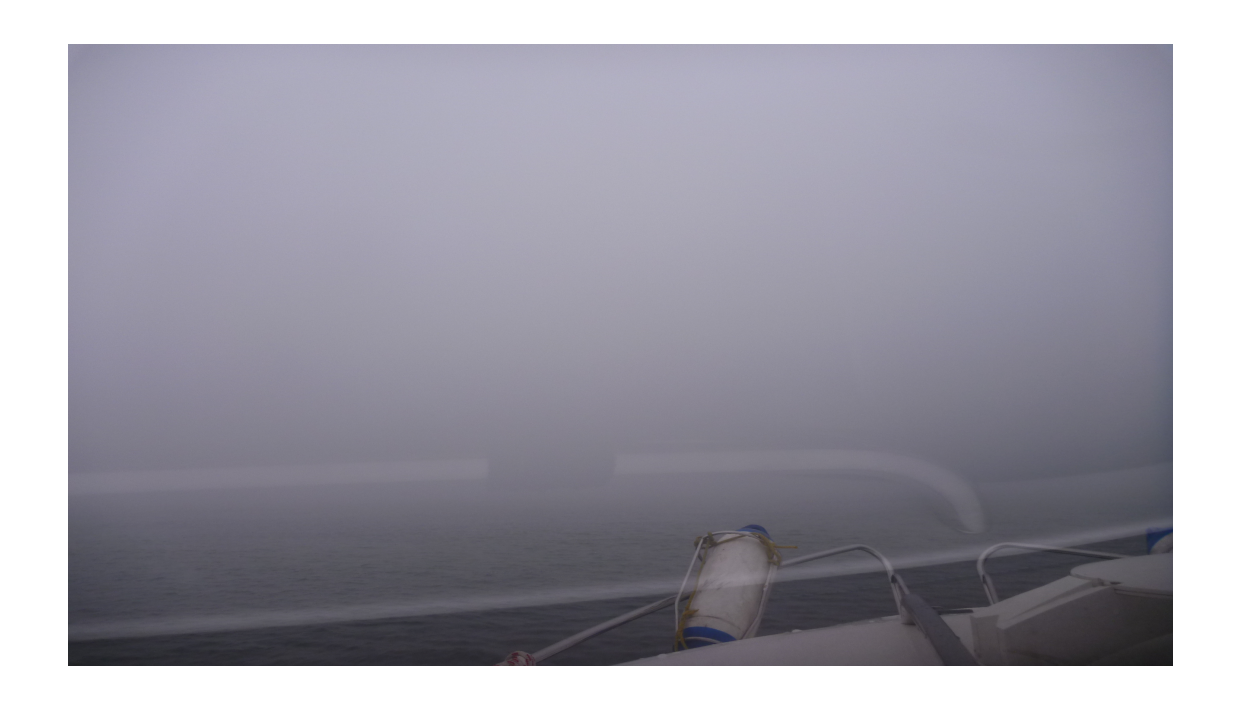
Conditions cruising to Rhyll from Hastings Marina