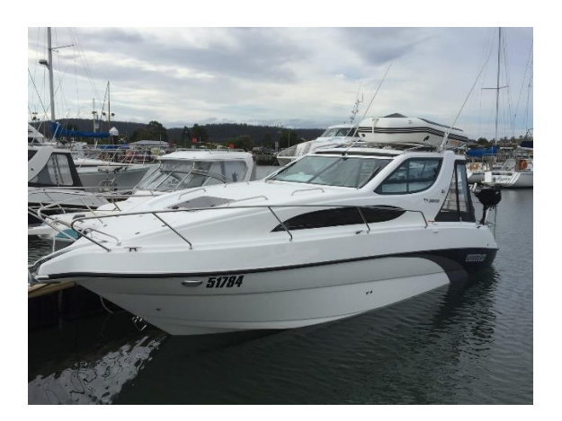
Surprise surprise another Whittley CR 2800.

First night in Wine Glass Bay. Fishing and eating all our great catch. Not a cloud in the sky and at night every star could be seen.