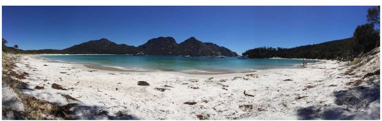
Next Day off to Coles Bay and yes another CR 2800. I could believe. A beautiful day was had shopping eating and sleeping as the wind was around 25 knots.