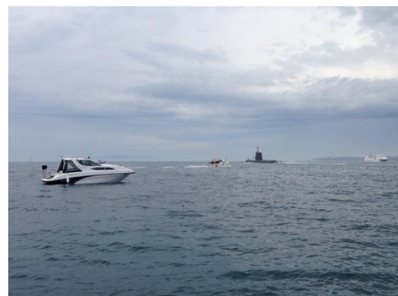
Figure 4- Sernity, Full of Beans and Kahala take a closer look.

We all re-grouped after the excitement of seeing a Submarine and made our way into Queenscliff for lunch. Fish & Chips was the order of the day, which we enjoyed in the breaks of sun outside the restaurant. The call of shops was way too strong and boating was put on hold while all shops were perused and some purchases made.