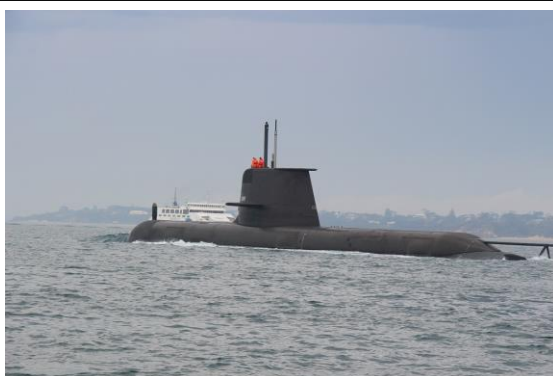
Figure 5 - Even the Ferries diverted to allow the Submarine clear passage.

After a quick look around we safely got all seven boats off the South Channel Fort Jetty and continued down the south channel towards Sorrento. At that point we expected to see the two Ferries crossing between Sorrento and Queenscliff but we were all taken by surprise to see a Black Submarine entering the bay!