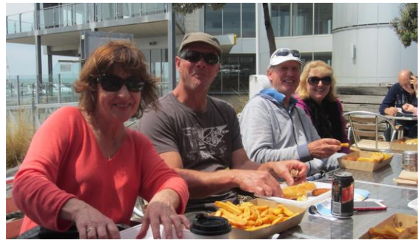
Figure 6 - Where was that bad weather - Lunch in the sun

Well the wind did come up and the trip home was a bit bouncy. I was very appreciative of Greg & Colleen rounding up “Lucky Us” and the big 2800 “Kahala” cut a swath through the chop. All we had to do was sit close to her wake for a smooth ride back to Martha’s Cove.