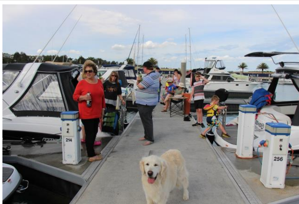
Figure 9- Happy Hour Martha's Cove

Dinner cooked and the wind had dropped off but still a little cool for the end of October, we were lucky to be able to all congregate in the café blind veranda of the Marina café for a discussion on our options for Sunday’s activities. The weather forecast was for winds up to 20 knots. It looked like a day for touring the attractions of the Mornington Peninsula. A tentative plan was developed and we would wait and see exactly what the morning would bring.