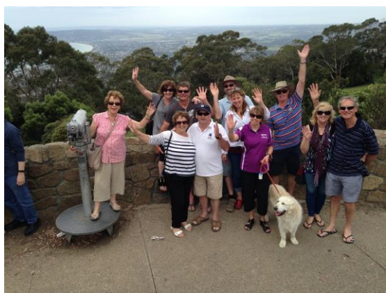
Figure 11- Arthurs Seat