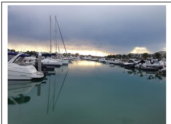
Figure 1 -Martha's Cove Marin, Saturday morning with a storm about to hit.

Seven boats were in the Marina on Friday night, and after happy hour on the jetty and dinner on the boats all crews made their way to the sheltered foyer of the Marina Café where we consulted the