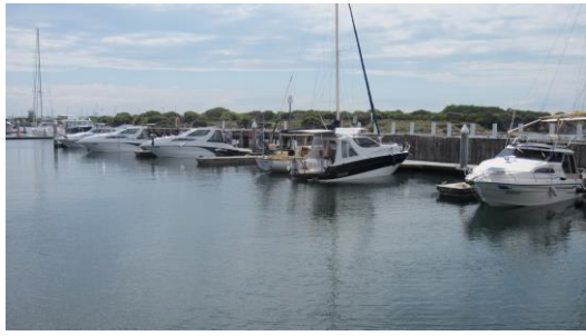
Figure 7 - Queenscliff Public Moorings