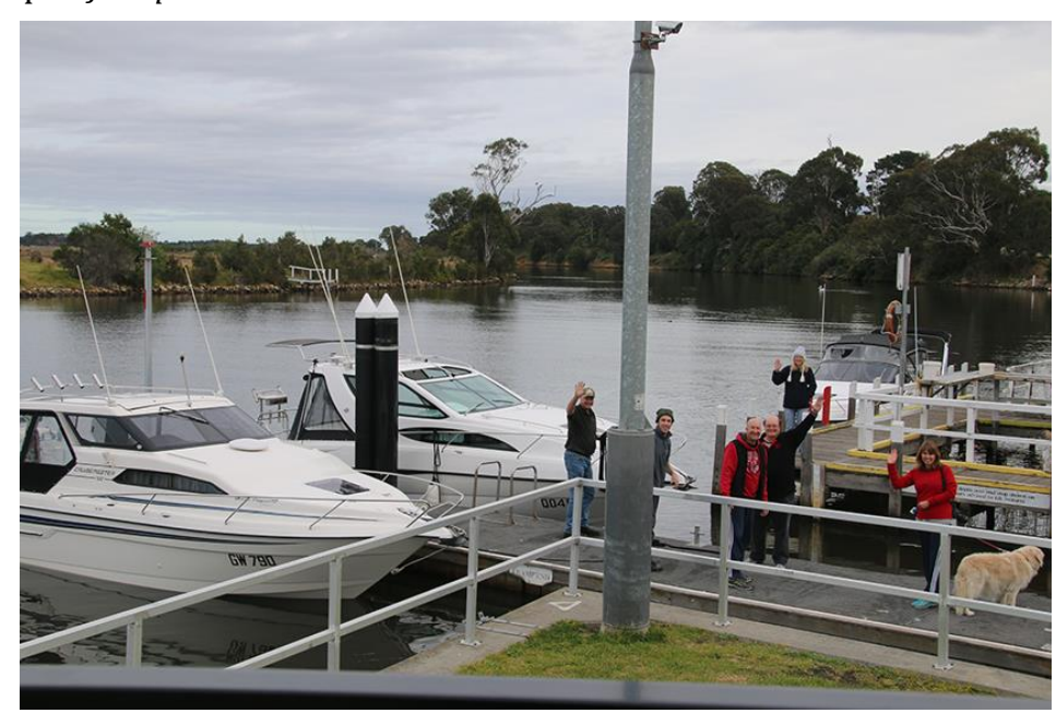
Four boats in the water at Johnsonville, Saturday morning.

and at times, sunny day. Importantly, the wind was not a factor and as we headed out of the mouth of the Tambo River into Lake King, the very water was calm. We were cruising on the plane in the direction of Paynesville very quickly. We diverted from the McMillan Straight entrance heading north-west and entered the canals