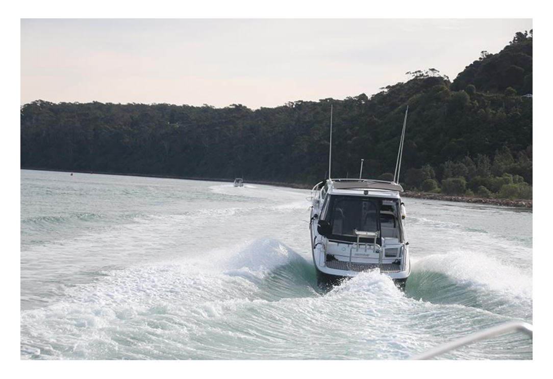
This CR 2600 sure moves some water!

Our cruise back to Lake King and the mouth of the Tambo River was incredible and much too short. The water was like glass and it was absolutely beautiful to be out there enjoying such stunning scenery.