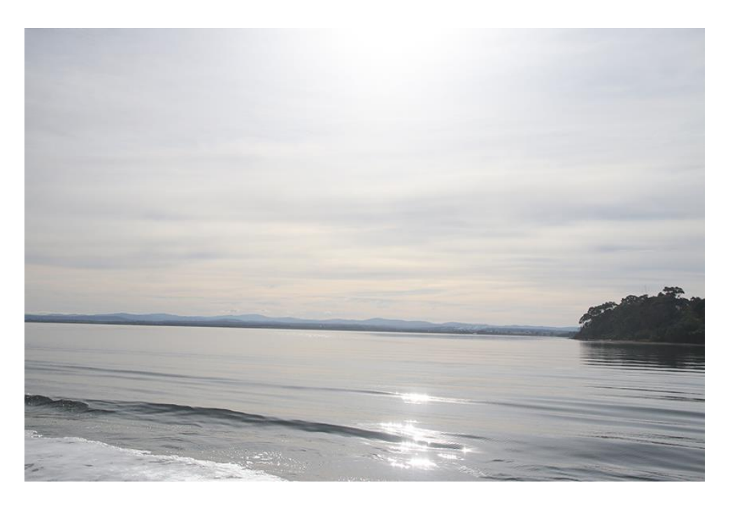
Lake King, just stunning