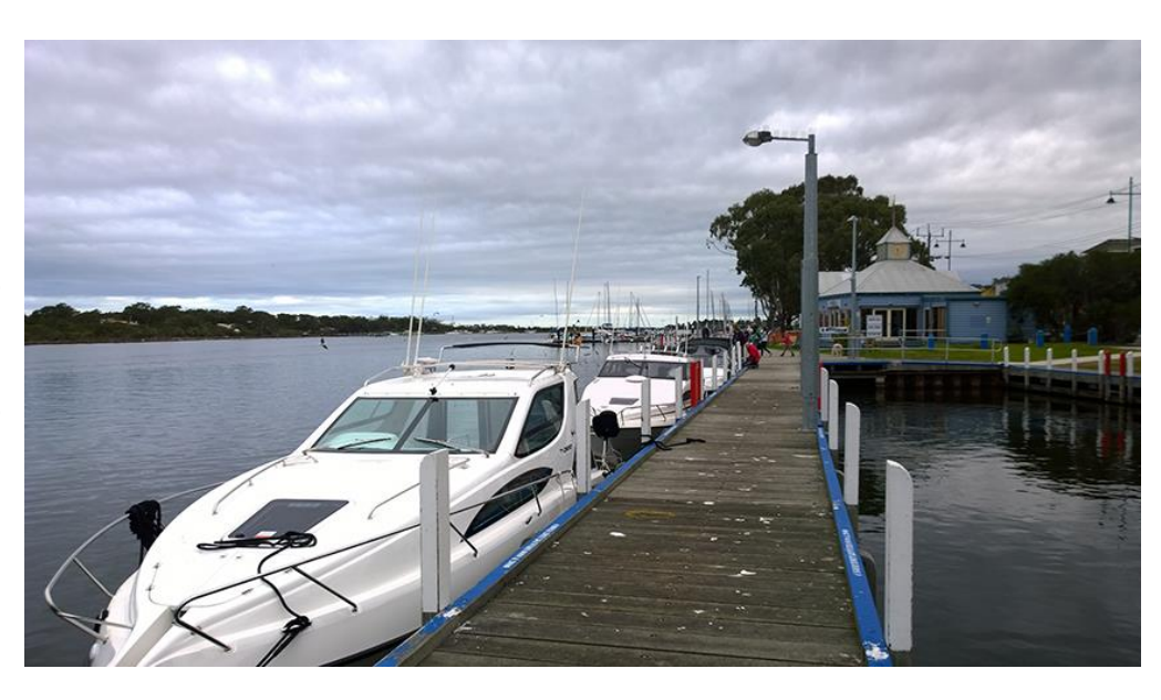
Paynesville for lunch.

Then we were back into the boats as the time was ticking on and it was now into the afternoon. We headed west out of Paynesville and around the western end of Raymond Island and into Campbell Channel: which runs east-west. south of Raymond Island. We set off for our evening mooring at