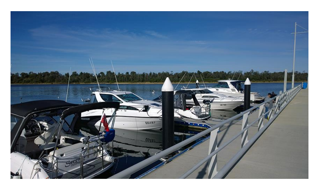
Boats parked up at Lakes Entrance