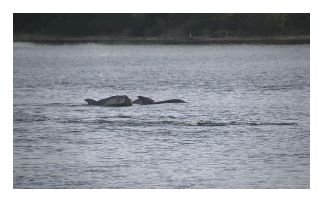
Pod of dolphins seen in Reeves Channel

Our cruise back to Lake King and the mouth of the Tambo River was incredible and much too short. The water was like glass and it was absolutely beautiful to be out there enjoying such stunning scenery.