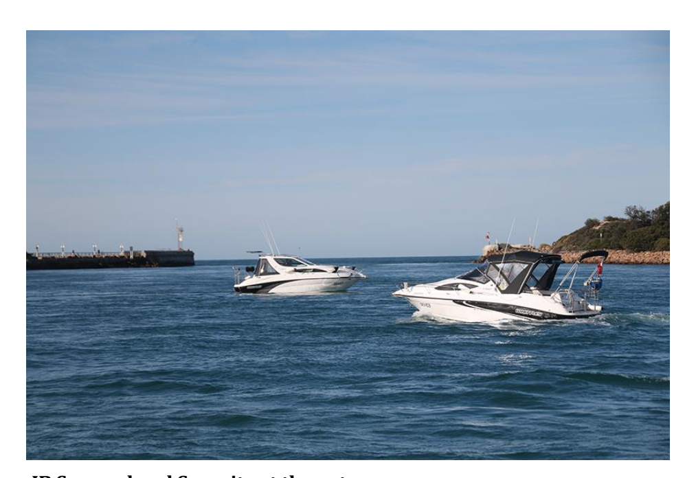
JB Squared and Serenity at the entrance

We set off in boats again along Hopetoun Channel toward Lakes Entrance. We paused for a quick photo shoot on boats as we passed the entrance to open ocean and then we headed over into Cuninghame Arm.