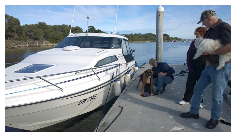
Lilly being prepared for re entry onto White Pointa

We set off in boats again along Hopetoun Channel toward Lakes Entrance. We paused for a quick photo shoot on boats as we passed the entrance to open ocean and then we headed over into Cuninghame Arm.