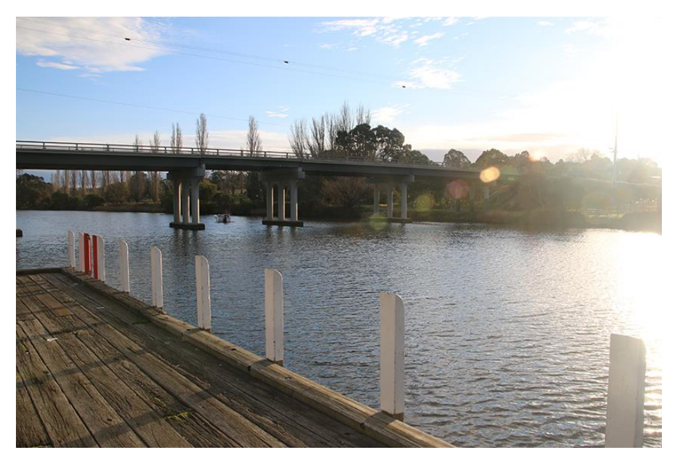
The morning sun at Swan Reach jetty looked promising.

following The morning, as per our plans, we were all ready to head off towards Johnsonville at 9:30am to sort out the battery issue. It was a cruisy start and the morning, while brisk, promised greater things with the sun just peeking out through the clouds. I had brought strawberries, some yoghurt and pancake