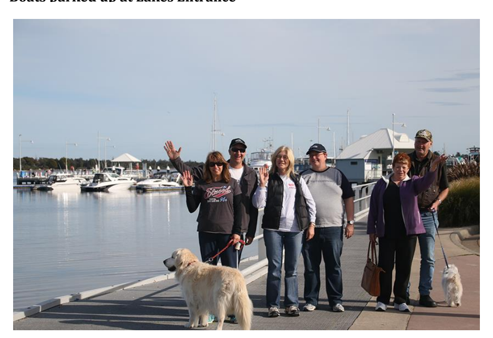
At Lakes Entrance, Whittleys in the background

Then, as we wanted to be back at Johnsonville to trailer boats and be on our way, we again set off out of Cunninghame Arm and this time, into Reeves Channel heading west back to Lake King. It was in Reeves Channel where we actually found our pod of dolphins. We paused to take photos and watch the show as there must have been 20-30 dolphins just cruising around. The Lakes system must be in a fairly healthy state by the looks of things.