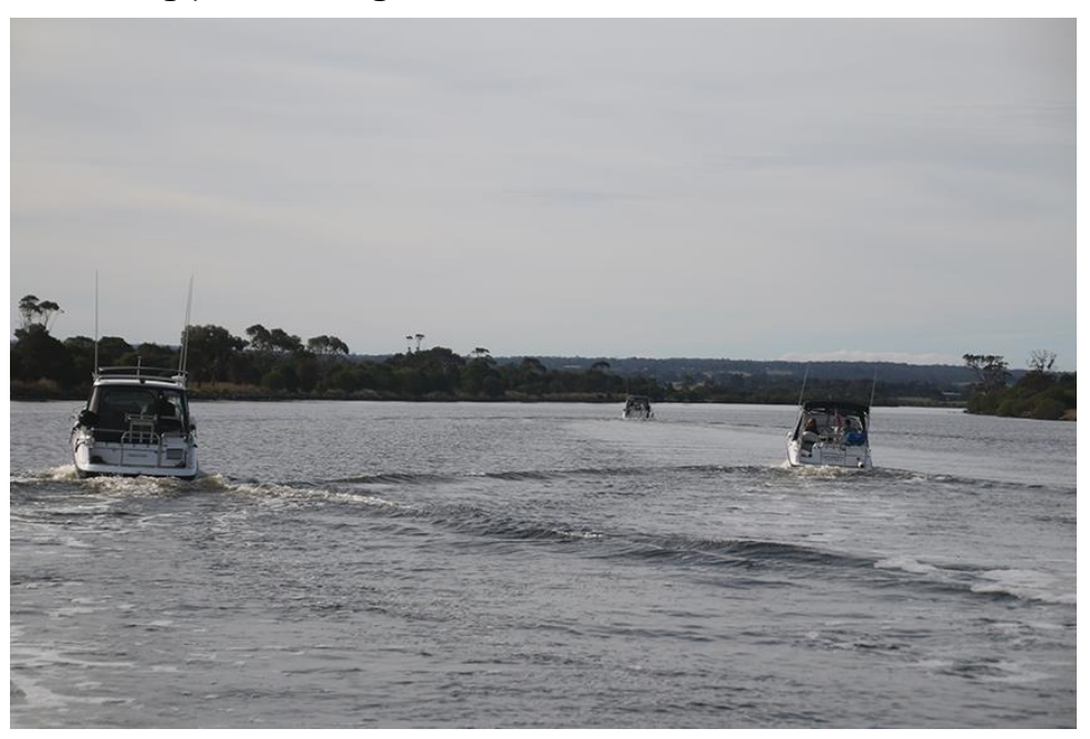
Into the mouth of the Tambo River and back to Johnsonville

We slowed for the river entrance and cruised on up to Johnsonville taking photos of the landscape and each other along the way. Lilly poked her head up out of the hatch a number of times, happy to be travelling at a slower pace and she had a good sniff.