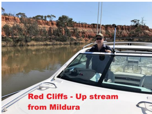
Red Cliffs - Up stream from Mildura

Friday was a beautiful 32 degree day in Mildura, which made it extremely comfortable cruising up the Murray approximately 30kms. We left Gol Gol and slowly cruised up stream past Trentham Cliffs, Psyche Bend and Red Cliffs, to a place called Bottle Bend where we came across a Goanna swimming across the Murray.