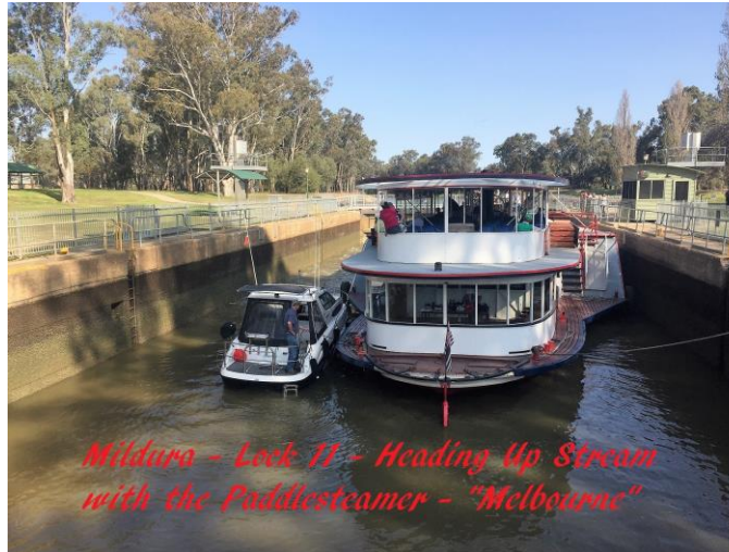
Mildura - Lock 11 - Heading Up Stream with the Paddlesteamer - "Melbourne"

We open up the new V8 on the way back to Mildura from Wentworth on Thursday afternoon and were very impressed with how nicely she cruised along the Murray. We had a plan to check out the Pub and moorings at Gol Gol, which is 8.5 minutes on the plane above Mildura and had to get there before dark. We shared the Lock with the wood fired Paddle steamer, Melbourne on the way through to a very relaxing night enjoying a meal in the beer garden at the Gol Gol Pub with a view or the sunset over the Murray.