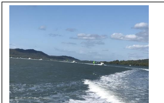
Figure 6 - Blue Team on the plane Cruising north towards Russell Island

We walked 100 metres up the road to enjoy lunch at the Paradise Hotel. It was great to relax and meet members of the NSW and QLD Whitley Clubs.