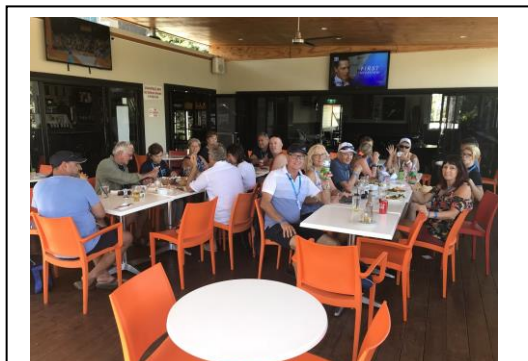
Figure 7- Lunch stop at the Paradise Hotel -