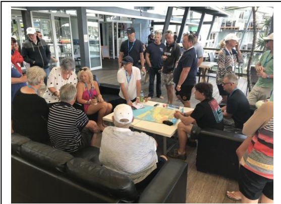
Figure 1 - Blue Team Cruise Briefing

For each Regatta, a big part of the adventure is getting there, particularly if it is interstate. I have found after attending 3 Regattas that it is very important to plan your trip. You need to allow plenty of time to get to and from the destination and importantly, time to spend exploring other waterways local to that area, before or after the Regatta.