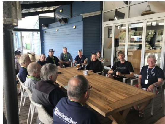
Figure 2- Green Team Cruise Briefing