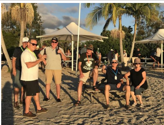
Figure 10 - Sunset Beach Bar – Pre Dinner Drinks. Just enjoying the view in a beautiful location....."Does it get any better than this?"