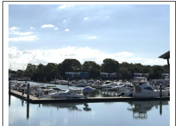
Figure 4 -Couran Cove Marina

On Day 1 of the Regatta, Blue Team were meant to cruise to Peel Island which is located halfway up North Stradbroke Island. Unfortunately the wind started to blow from the south making weather conditions unfavourable for this trip. We ended up cruising to MacLeay Island located at the southern end of North Stradbroke which was more sheltered from the wind.