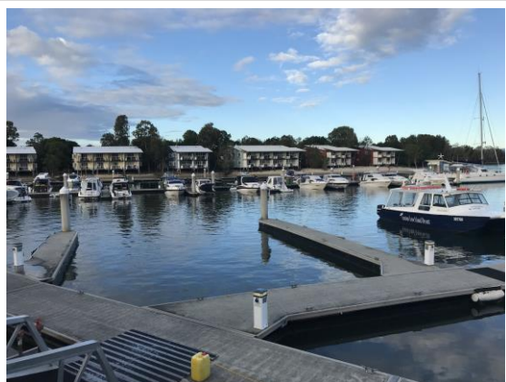
Figure 3- Couran Cove Marina and Apartments

At this year's Queensland Regatta, the boats were divided into three groups – Blue, Green and Orange. There were about 15 boats in each group and each day your group would complete one of the three cruises. After breakfast and attending your cruise briefing, you would head off, in your Whittley, following your local experienced Trip Co-ordinator around the Moreton Bay waterways, stopping at a specified location where lunch was provided. After a casual lunch we would then cruise back to the Couran Cove Marina where you would gather for pre-dinner drinks, the evening meal and some entertainment.