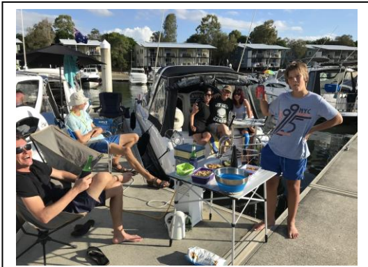
Figure 8 - Happy Hour, prior to pre-dinner drinks

Couran Cove Resort and Marina is an amazing facility with its ample marina berths, bars, restaurants, café, pools, sporting and entertainment facilities, access to the surf beach and the beautiful sunset beach bar. The staff were helpful and friendly and Queensland Whittley Club did an amazing job, organising and hosting the 2018 Whittley Regatta. They have set the bar exceptionally high in Regatta organisation. I really enjoyed our time at the 2108 Regatta, meeting new friends and catching up with friends we had met on previous Regattas. Thank you to all who attended and looking forward to catching up again in Victoria in 2020.