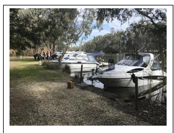
Figure 8 - Tahbilk Winery mooring, Saturday morning 28 July 2018.

We only passed a couple of tinnies with some locals trying to catch that elusive fish. We arrived at Tahbilk Winery late morning