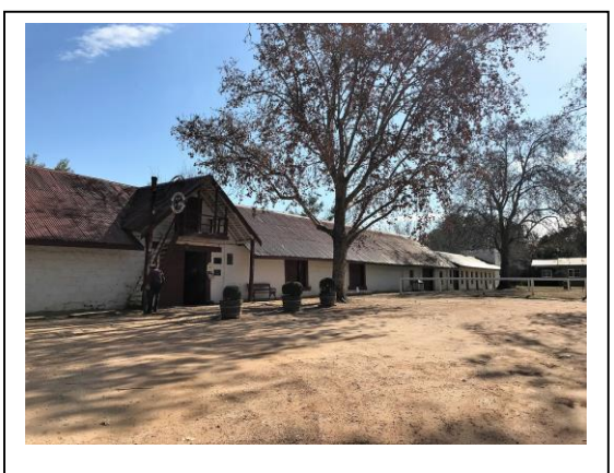
Figure 9 - Tahbilk Winery overlooking the Goulburn River

We only passed a couple of tinnies with some locals trying to catch that elusive fish. We arrived at Tahbilk Winery late morning