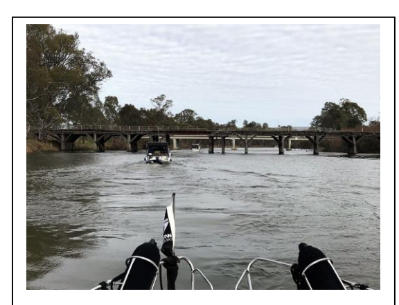
Figure 7 - Goulburn River heading upstream under Chinaman's Bridge