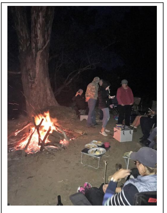
Figure 12 - Saturday night Campfire.

As the evening fell we headed back to our boats to cook dinner. It had been a beautiful winter's day – not a ripple on the water.