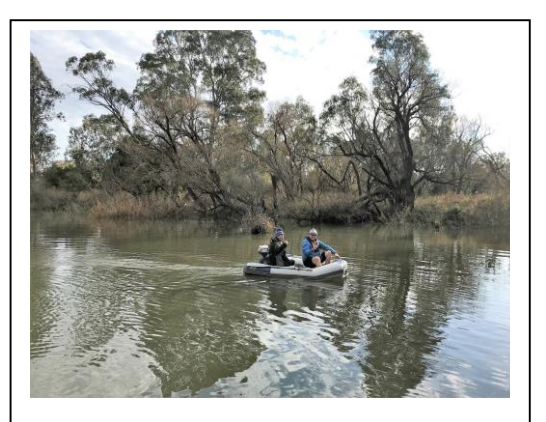
Figure 5 - Mikes, Smith & Jones, heading back to the boat ramp to guide "To the Point" through the Lake to the River.

All six boats headed upstream on the Goulburn River passing under the old wooden, Chinaman's Bridge just past the caravan park. We had a leisurely cruise along the river, enjoying the tranquillity of a winter's cruise.