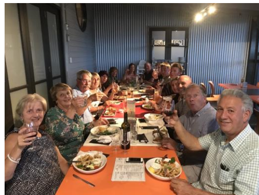
Figure 5 - Christmas Dinner in Geelong - Wharf Shed Café.