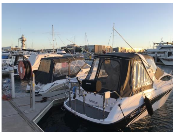
Figure 2 - Friday Night Queenscliff Harbour