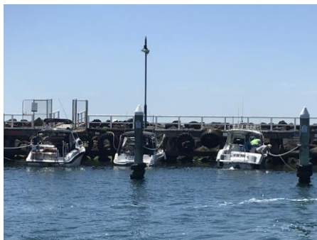
Figure 6 - Lunch at Port Arlington Marina

With the call if '10 mins' until departure given Neil decided he had time to do the washing up but after 5 mins it was all hands on deck cause others are untying & moving; as the waters were navigated again with the occasional swoosh of water entering via the clears & eyebrows . . Neil says gee the backs of my legs feel all wet, must be the way the water is getting in ? - suddenly he realises that the water is slopping out of the sink which is under his seat!