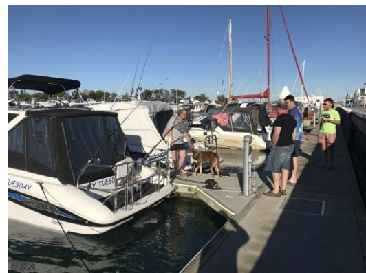
Figure 1 - Queenscliff Harbour Saturday Morning

Off we all went to the Queenscliff Brewhouse for dinner, drinks, a catch up & chatter. Hours later the with the courtesy bus hailed we were returned to the Marina for a good nights sleep.